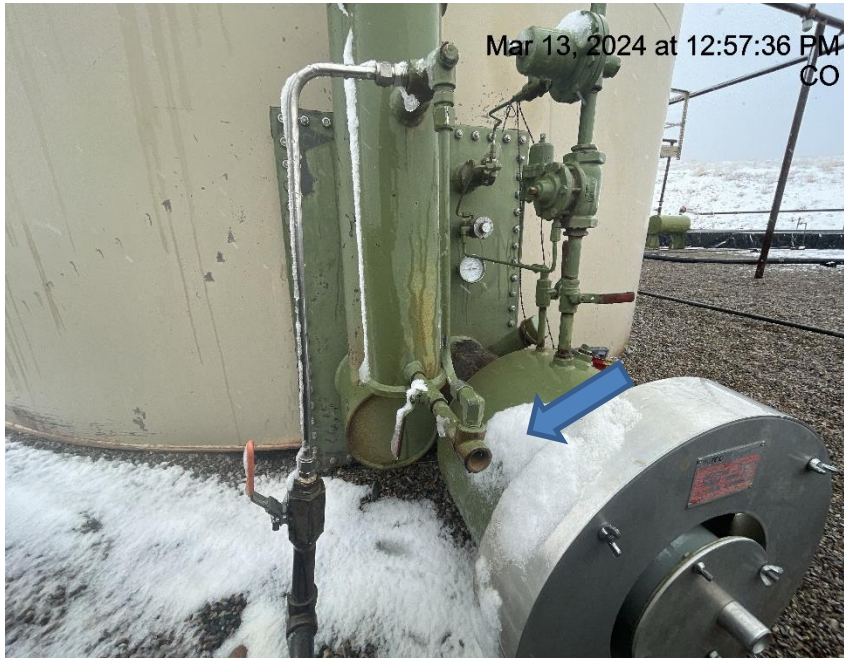
Photo # 9838 PRV vent line for tank burner does not comply with CECMC pressure safety device rules & also terminates in an unsafe manner