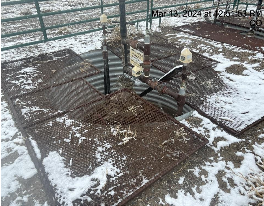
Photo # 9840 Wellhead cellar cover not properly installed /wildlife & personnel hazard