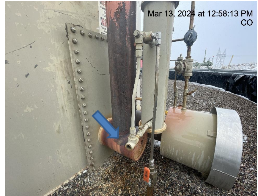
Photo # 9839 PRV vent line for tank burner does not comply with CECMC pressure safety device rules & also terminates in an unsafe manner

Photo # 9838 PRV vent line for tank burner does not comply with CECMC pressure safety device rules & also terminates in an unsafe manner