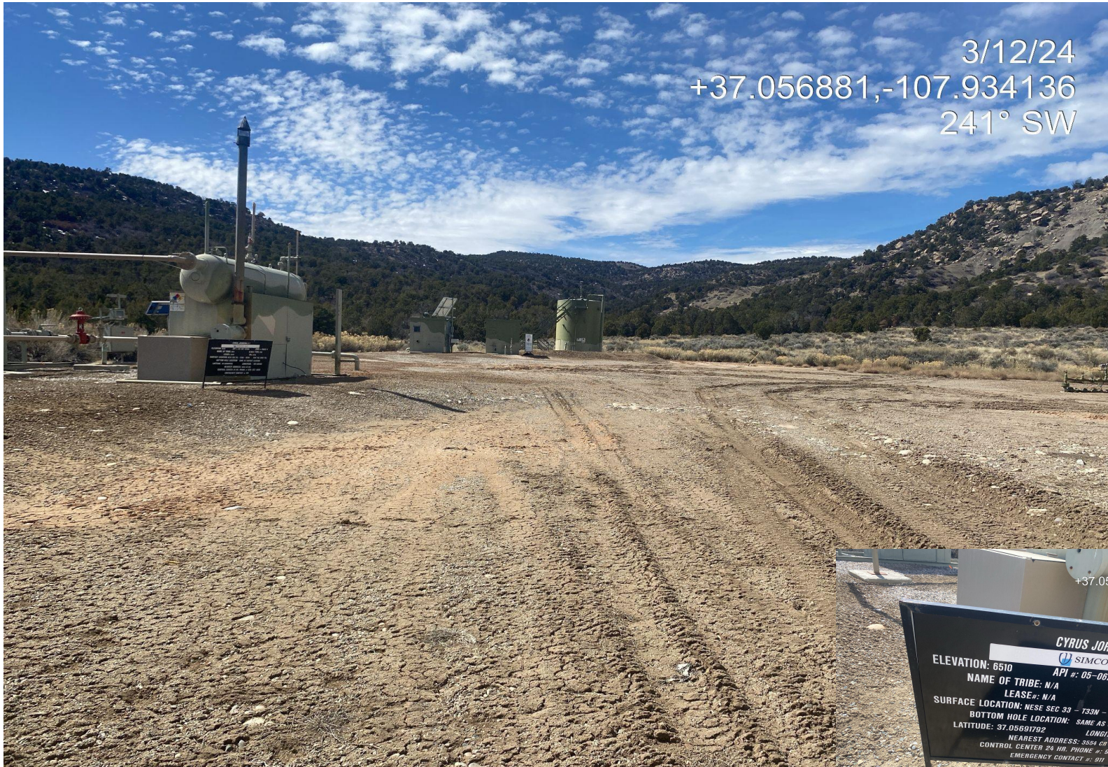
Photo 1. Overview of the disturbance taken from the entrance facing center.