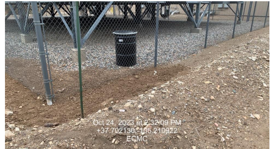
Photo 9 – Glycol Spill identified in Inspection Doc # 713600296 has been cleaned