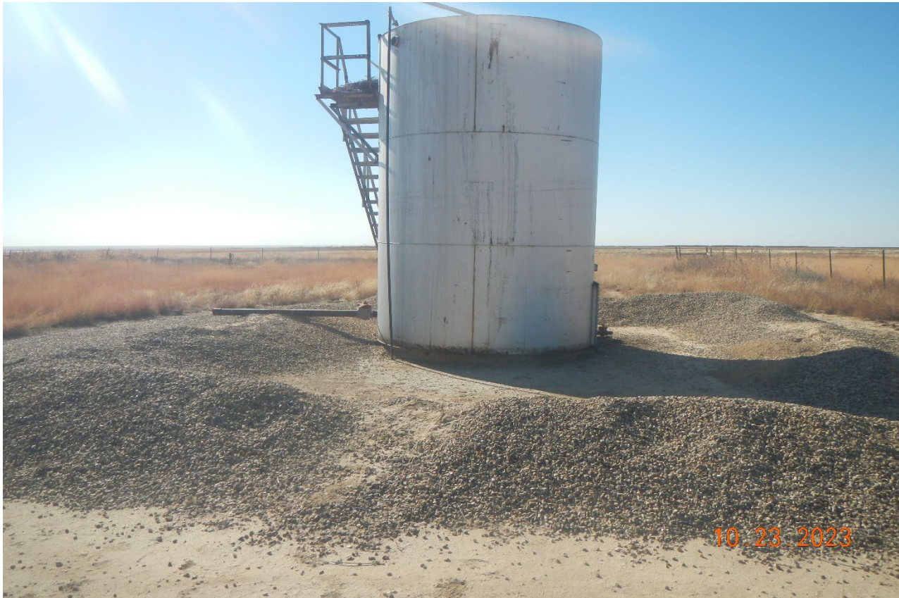
Photo 3. The berm around the tank battery is insufficient to contain a spill. If the tank is not in use then it should be removed..