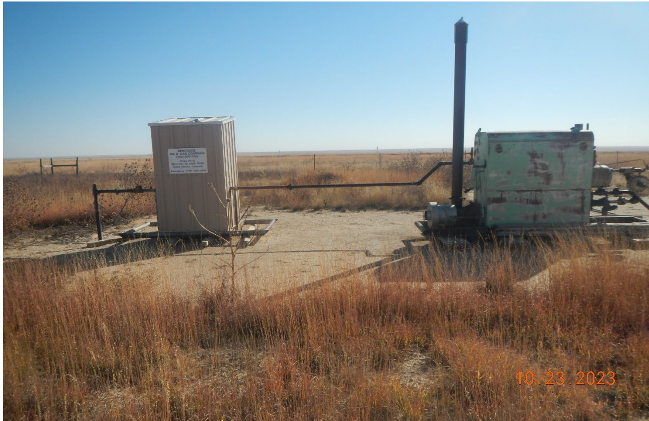
Photo 4. Facing toward the meter run.