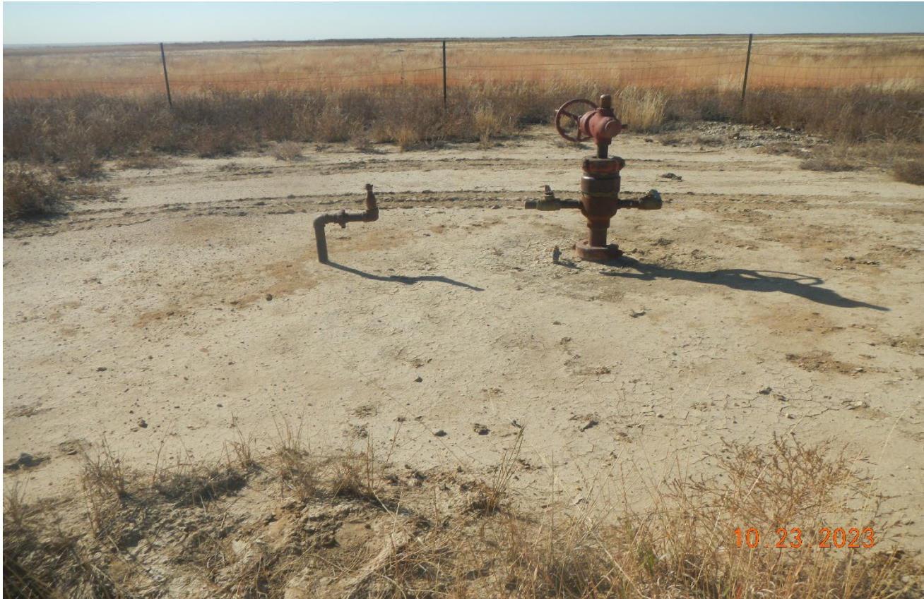
Photo 5. Facing toward the wellhead. There is a pipe riser with no OOSLAT.