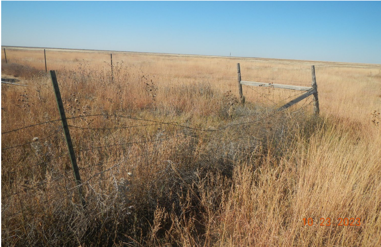
Photo 2. The fence at the northwest corner needs maintenance.