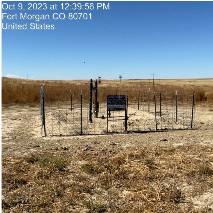
Photo 2. Photo taken of of wellhead, facing west.

Oct 9, 2023 at 12:39:56 PM Fort Morgan CO 80701 United States