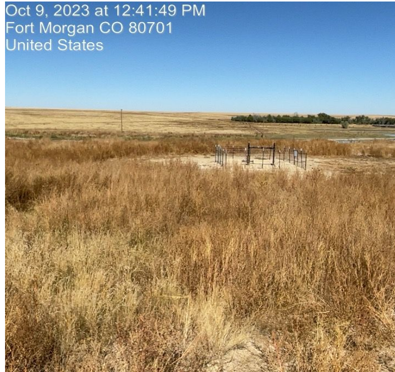
Photo 4. Photo taken facing southwest of weeds (kochia & russian thistle) on pad outer perimeter and in reclaimed area. Working area has been mowed.