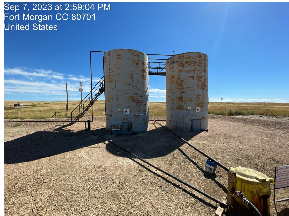
Photo 9. Photo taken of battery, facing south. This is an off location tank battery.

Sep 7, 2023 at 2:59:04 PM Fort Morgan CO 80701 United States