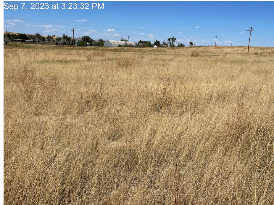
Photo 7. Photo taken facing north of undisturbed area for reference vegetation comparison.