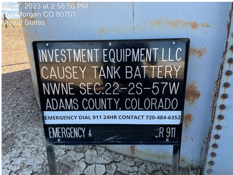
Photo 8. Photo taken of location sign. Tank battery ID 319632.

Sep 7, 2023 at 2:58:50 PM Fort Morgan CO 80701 United States