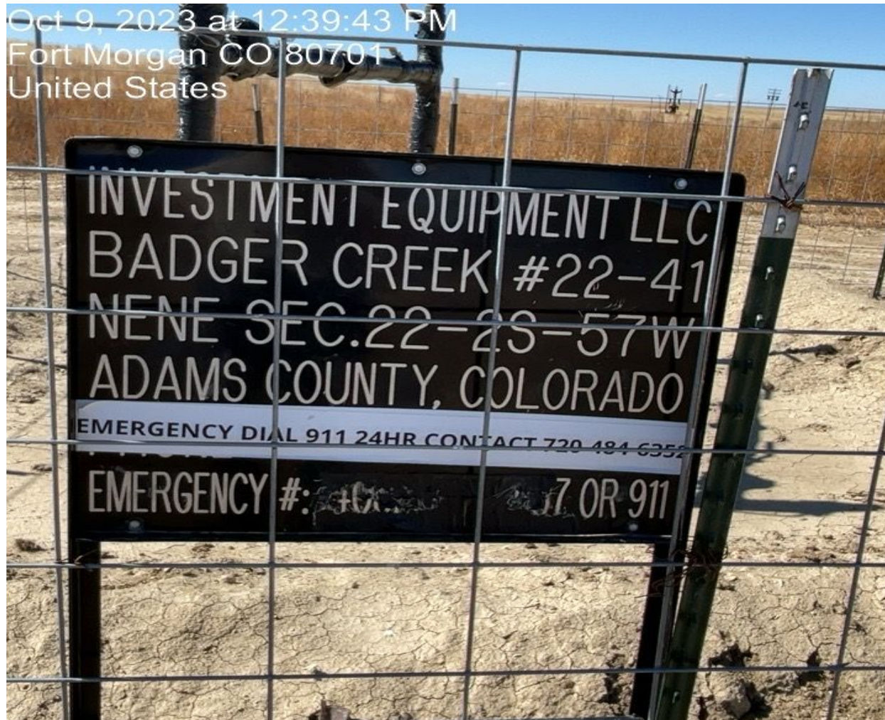
Photo 1. Photo taken of location sign. Well ID 433741.