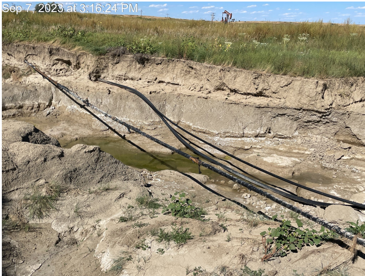
Photo 10. Photo taken facing north, of large gully with exposed un-stabilized flowlines