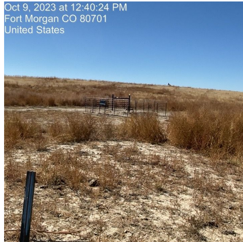
Photo 3. Photo taken facing east of weeds (kochia & russian thistle) on pad outer perimeter and in reclaimed area.

Oct 9, 2023 at 12:40:24 PM Fort Morgan CO 80701 United States