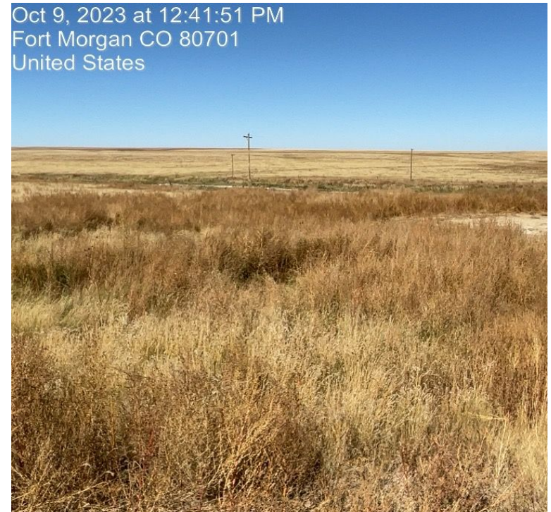
Photo 5. Photo taken facing north of weeds (kochia & russian thistle) on pad outer perimeter and in reclaimed area.