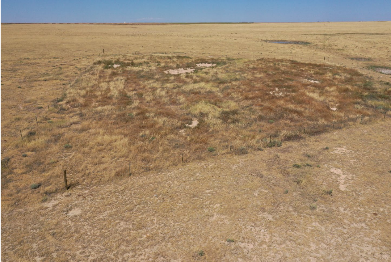
Photo 1. Drone aerial photo facing west toward the location.