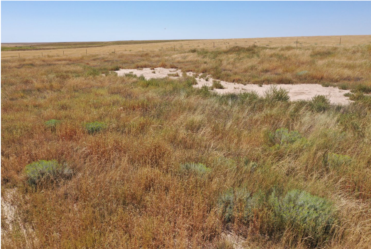
Photo 6. Closer view of the location facing south. The tall undesirable weeds (Kochia) which needs to be controlled.