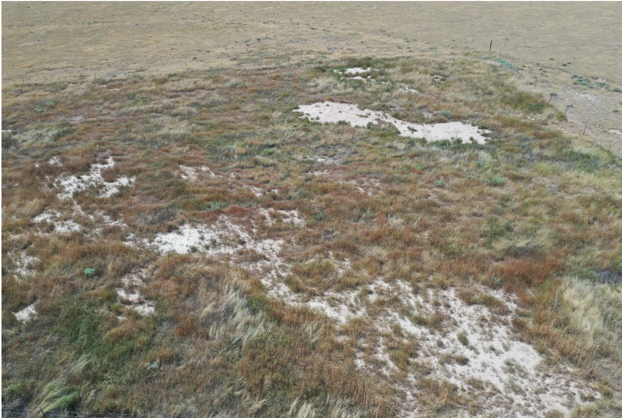
Photo 4. Drone aerial photo facing south toward the location. The reddish brown vegetation is undesirable weeds (Kochia). The desirable vegetation has not re-established and there are bare areas with no vegetation.