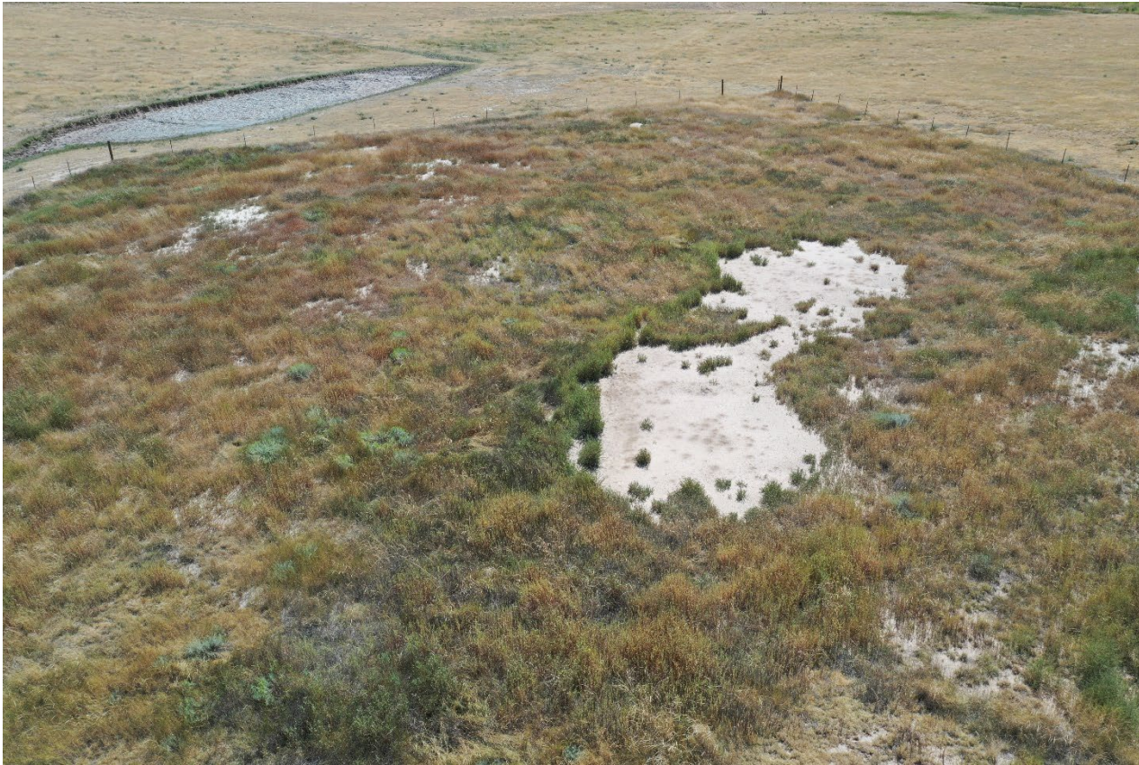
Photo 3. Drone aerial photo facing east down toward the location. The reddish brown vegetation is undesirable weeds (Kochia). The desirable vegetation has not re-established and there are bare areas with no vegetation. The bare area appears to be impacted soil from the well site.