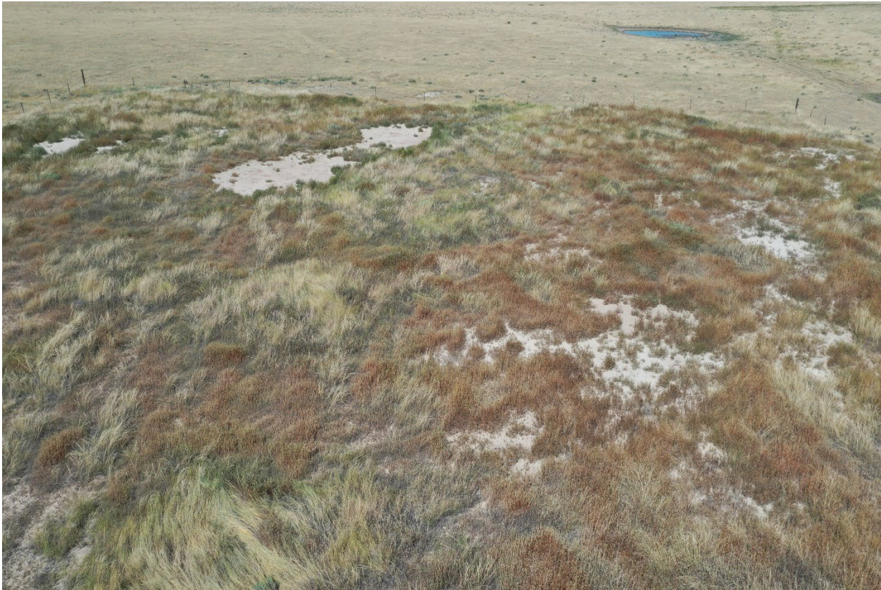
Photo 2. Drone aerial photo facing west down toward the location. The reddish brown vegetation is undesirable weeds (Kochia). The desirable vegetation has not re-established and there are bare areas with no vegetation.