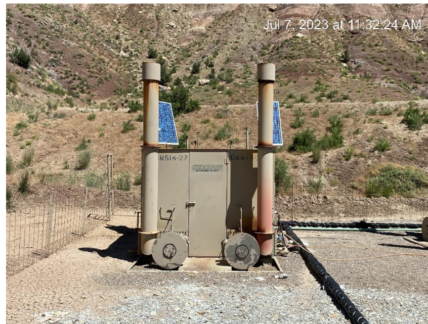
Gas meter calibration not displayed