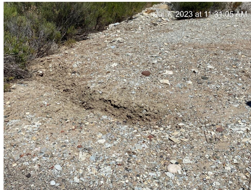
Erosion off location to production pad