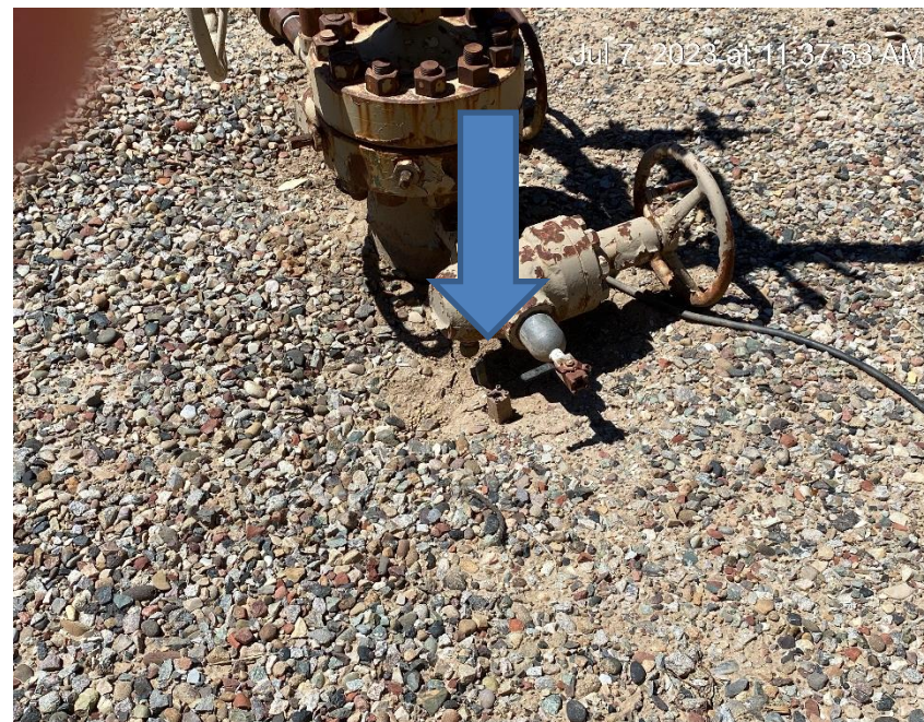
Surface casing valve left open