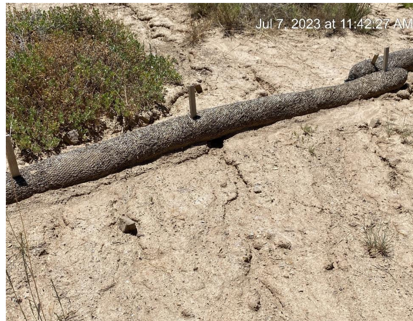
Wattles ineffective in places