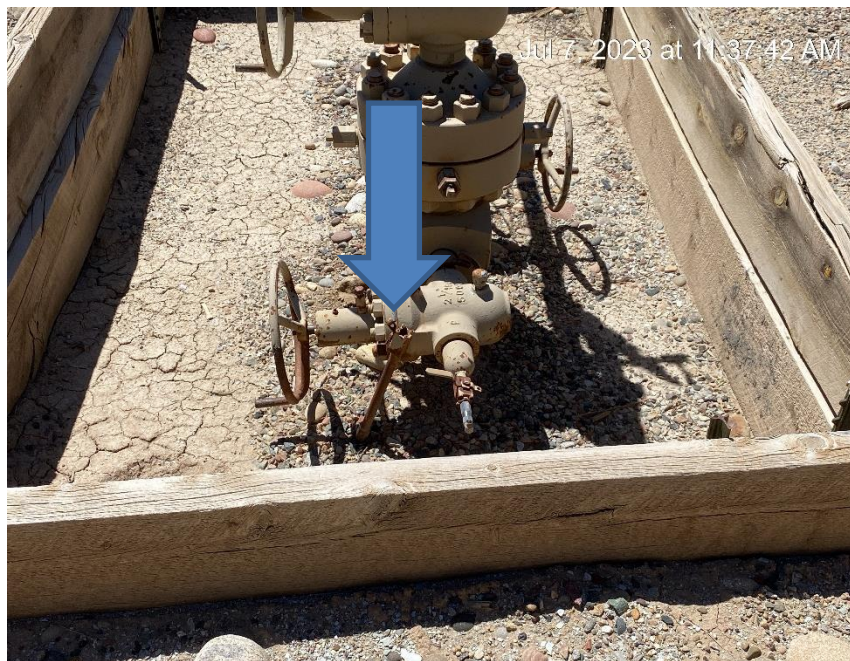
Open surface casing valve