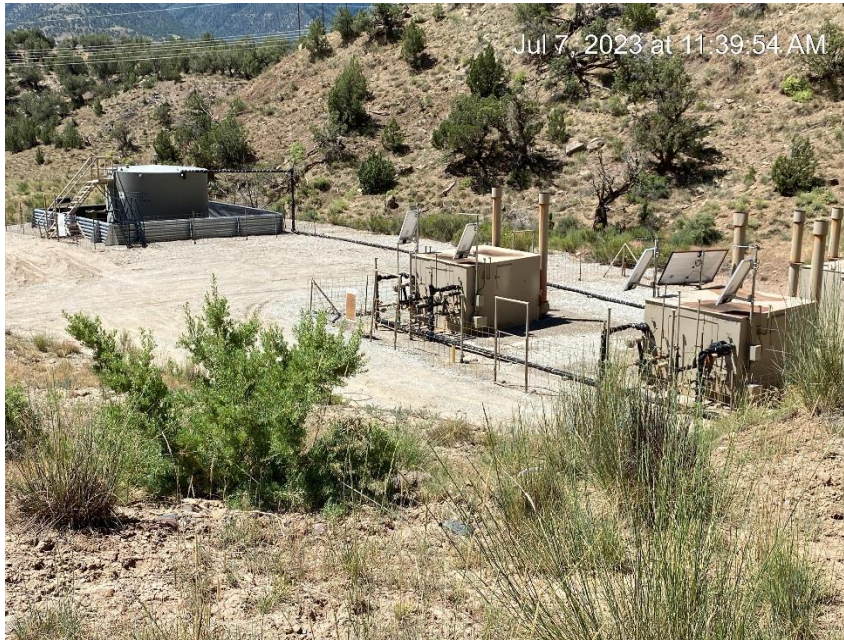
Production facility from well pad