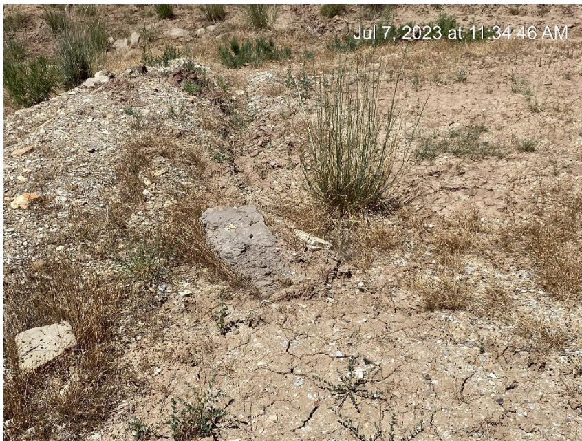
Erosion and sediment migration from location