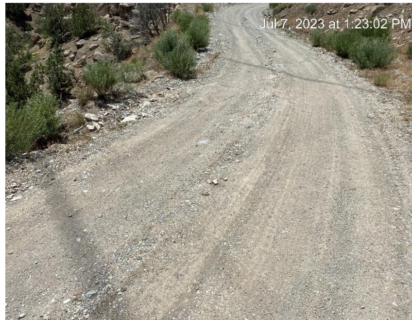
Stormwater crosses road before reaching culvert