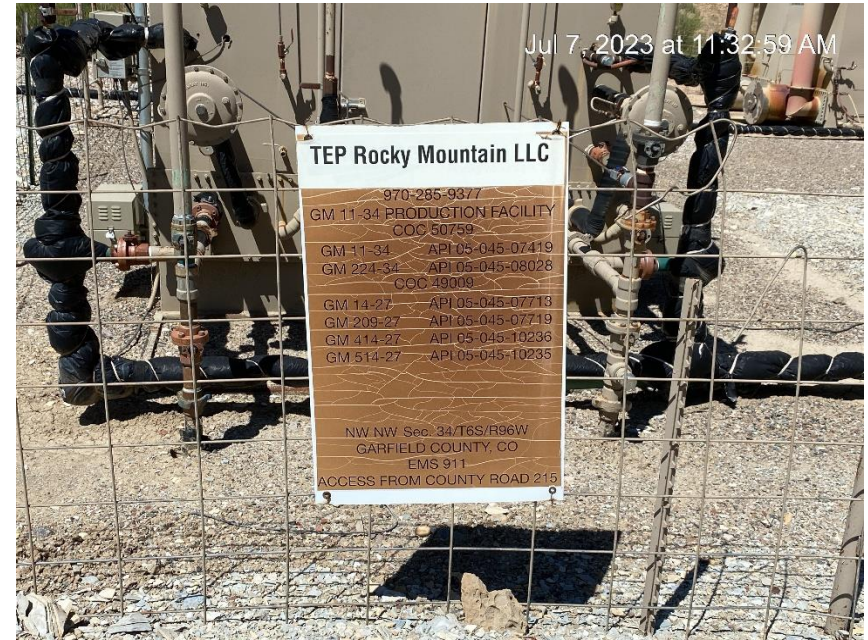
Sign at separators