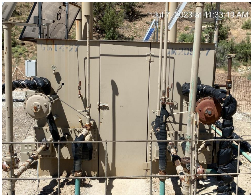
No visible display of gas meter calibration