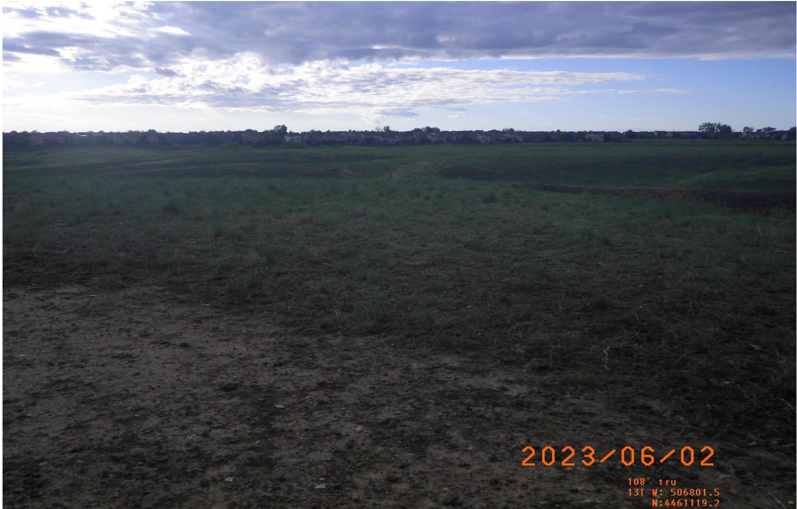
Photo 6. Overview photo of the well pad taken at ground level from the northern edge facing southeast.