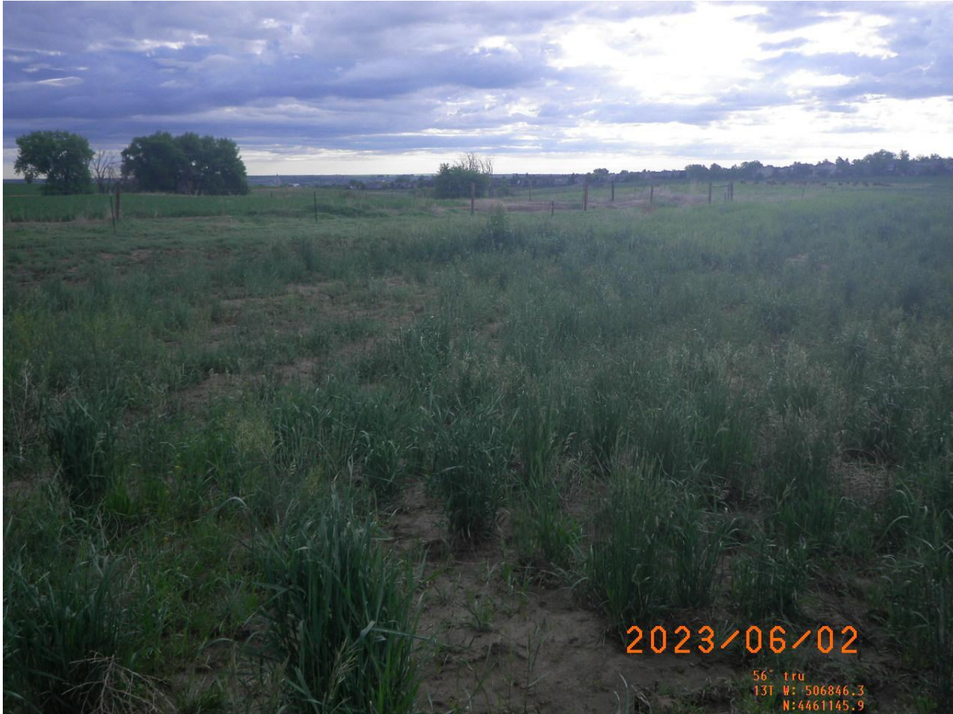
Photo 9. Well pad and tank battery reference area.