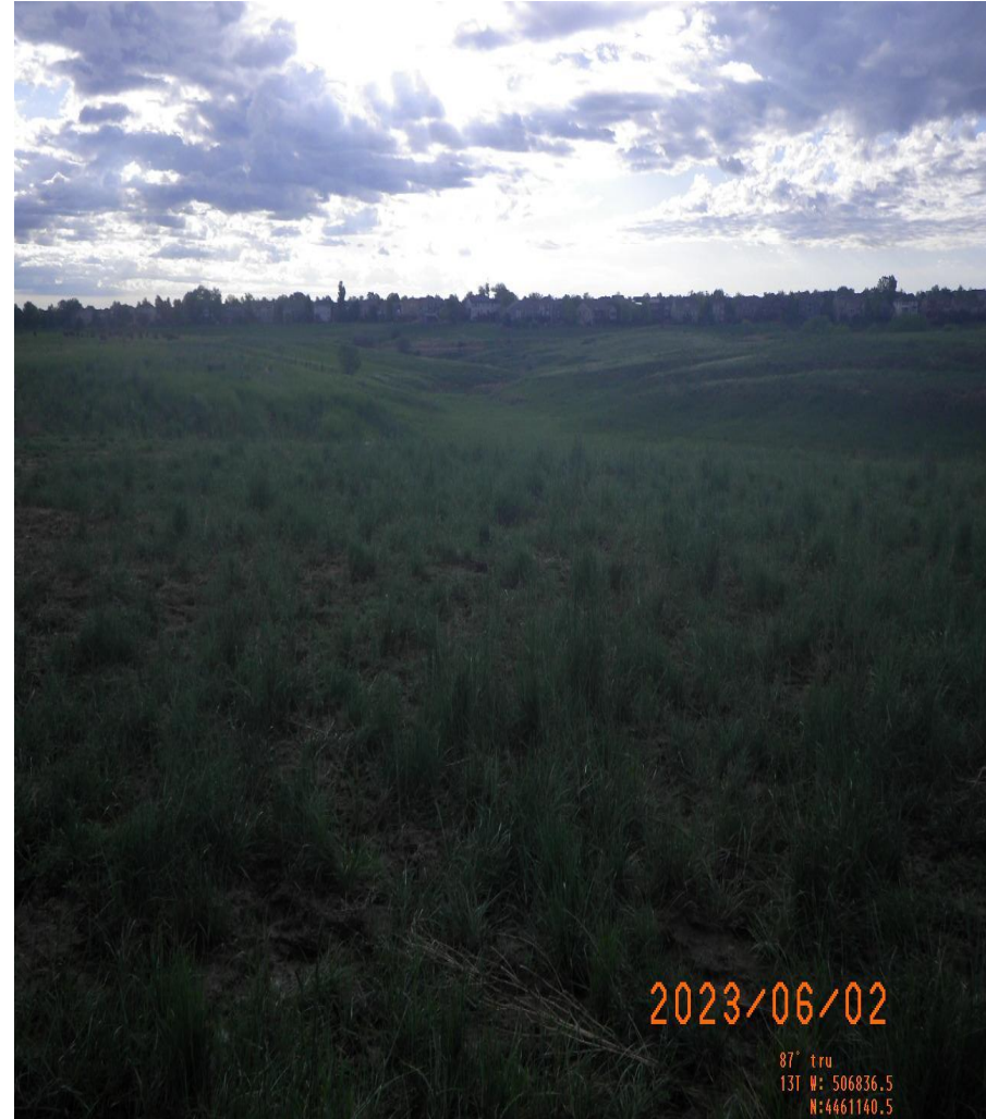
Photo 7. Cardinal photos taken at ground level from the middle of the well pad. Left photo facing north, right photo facing east.