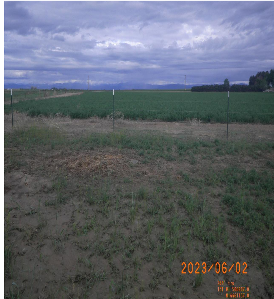
Photo 4. Cardinal photos taken at ground level from the middle of the tank battery. Left photo facing south, right photo facing west. Note: tank battery vegetation density does not appear consistent with adjacent reference area (See photo #9) and has a large amount of sediment/gravel covering the disturbance. Sediment is moving in from a recently added drainage ditch to the south side of the alfalfa field located to the west of the disturbance (see photo #5).