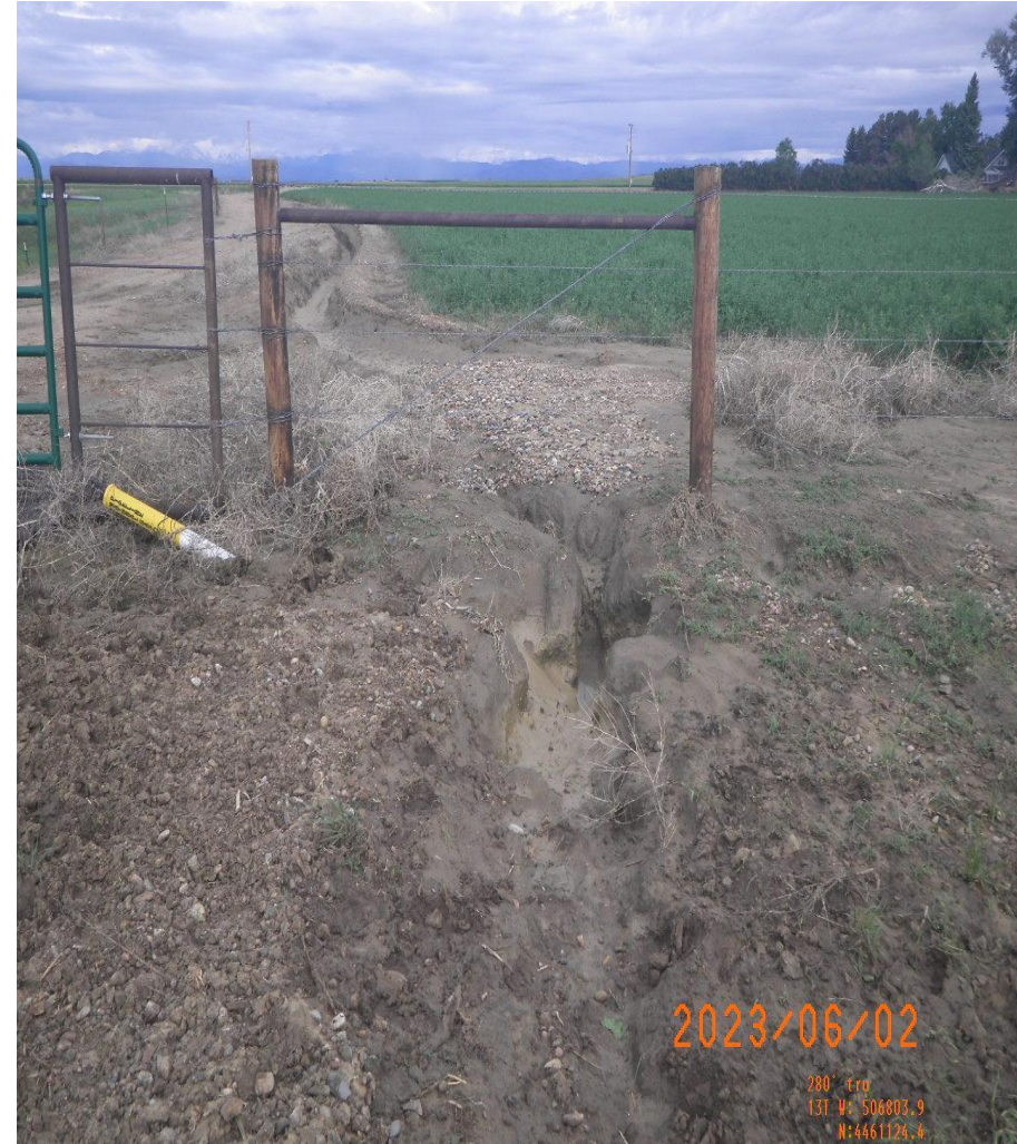
Photo 5. Photos of sediment moving into tank battery disturbance from adjacent alfalfa field.