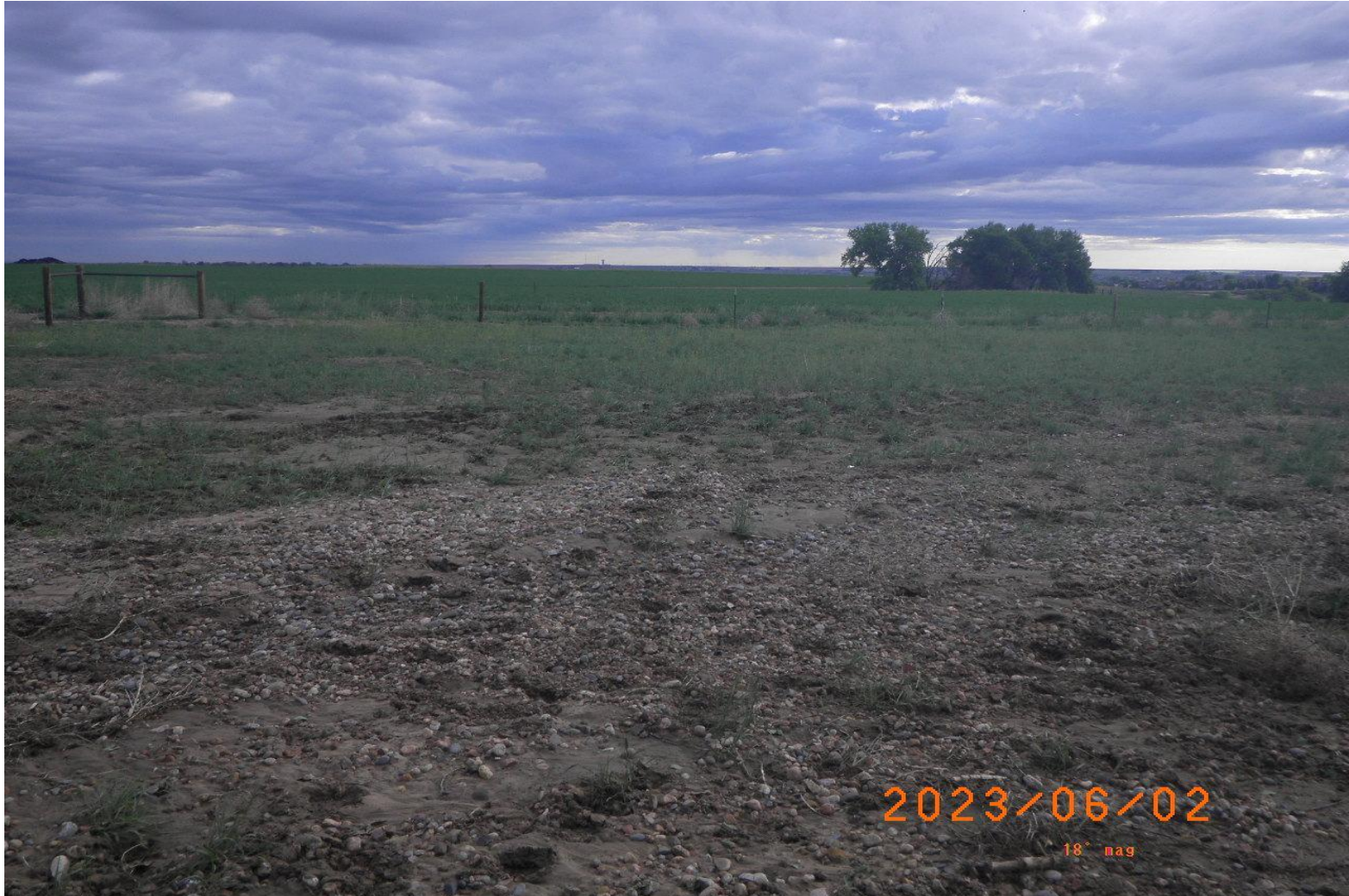
Photo 2. Overview photo of the tank battery taken at ground level from the southern edge facing north. Note: cattle have moved into the disturbance and grazed the area.