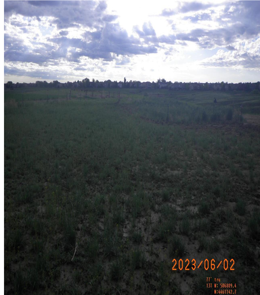
Photo 3. Cardinal photos taken at ground level from the middle of the tank battery. Left photo facing north, right photo facing east.