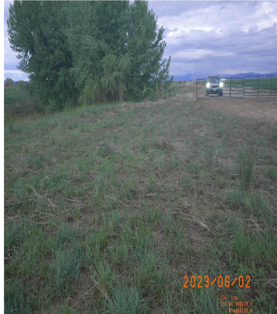
Photo 8. Cardinal photos taken at ground level from the middle of the well pad. Left photo facing south, right photo facing west. Note: well pad has higher vegetation cover than the tank battery and appears consistent with reference area (see photo #9) but has residual sediment moving in from the north. Well pad was also grazed recently.