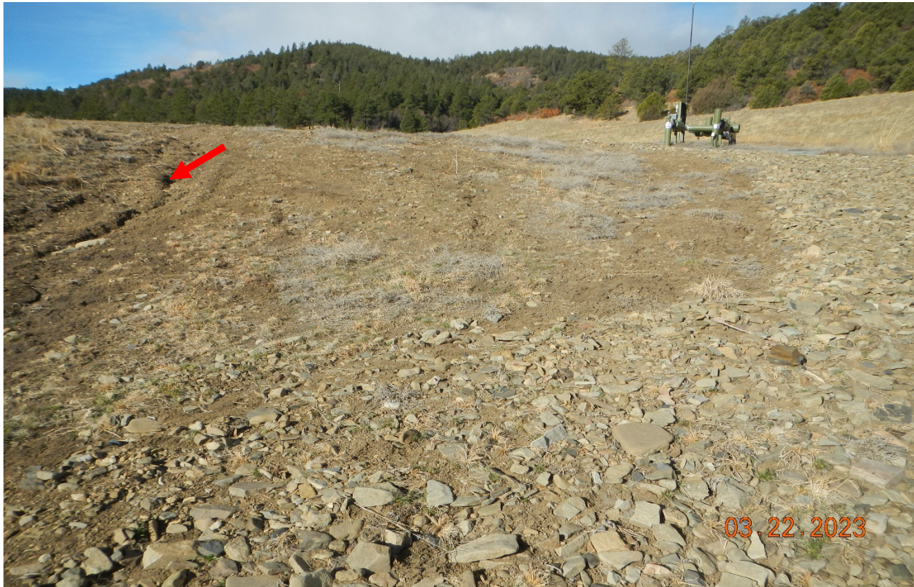
Photo 4. Facing southwest at the location. There is erosion occurring off the northeast side of the location. Additional BMP's need to be installed in this area including reseeding of this area.