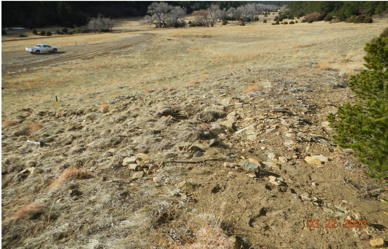
Photo 7. Facing south toward the run-on ditch which is filled in with sediment causing erosion of the cut slope. Previous corrective action is not completed.