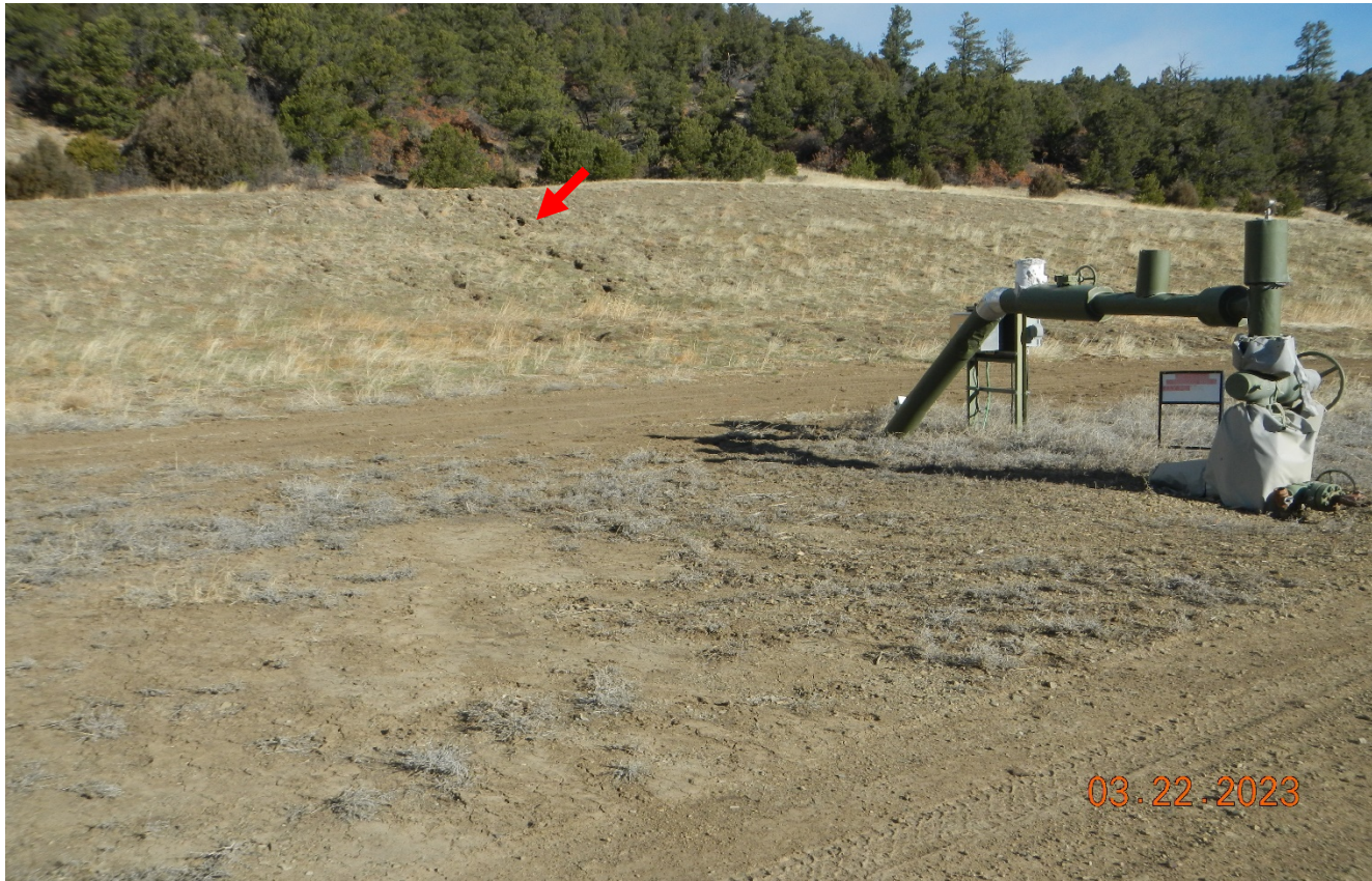
Photo 9. Facing north at the wellsite. Areas of erosion are visible at red arrow along the cut slope.