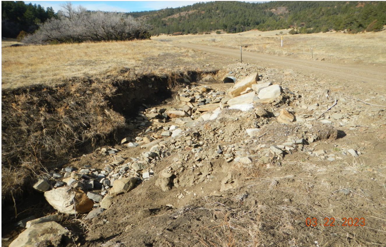
Photo 1. The culvert outlet has eroded and needs to be repaired. Previous corrective action was not completed.