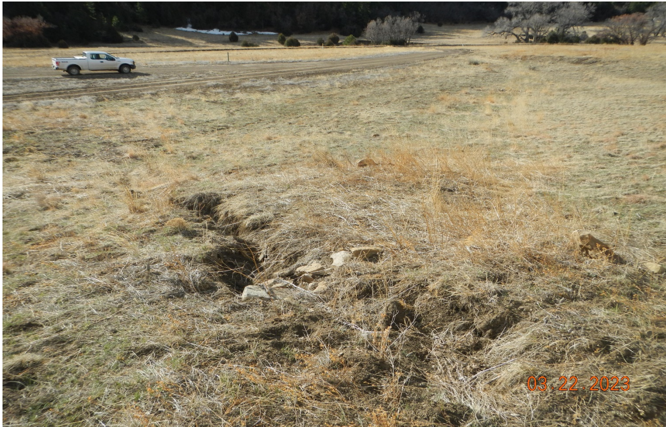
Photo 8. There are additional erosion channels along the south side of the location. Previous corrective action is not completed.