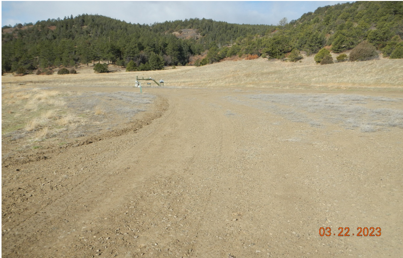
Photo 5. Facing northwest toward the wellsite.