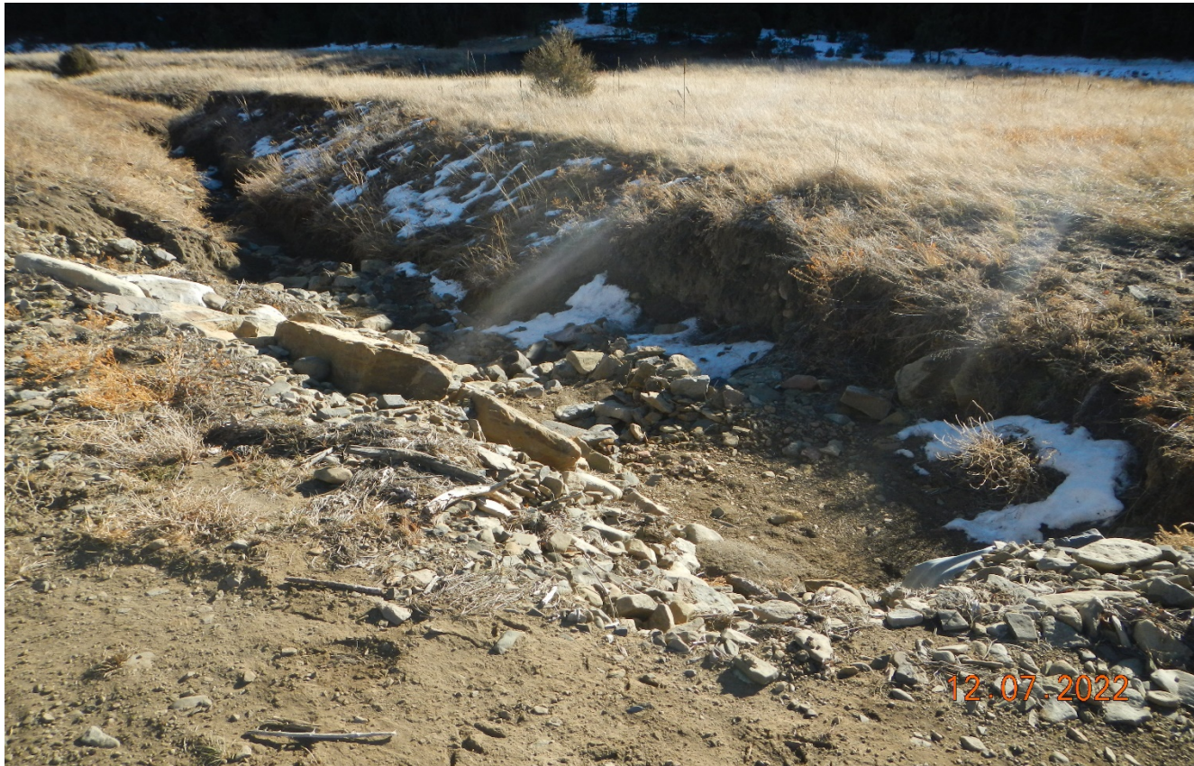
Photo 2. Facing toward the culvert outlet. The culvert outlet has eroded and needs to be repaired. Previous corrective action was not completed. BMP's must be installed per good engineering practice. (E.g. Rock outlet protection should include geotextile fabric)