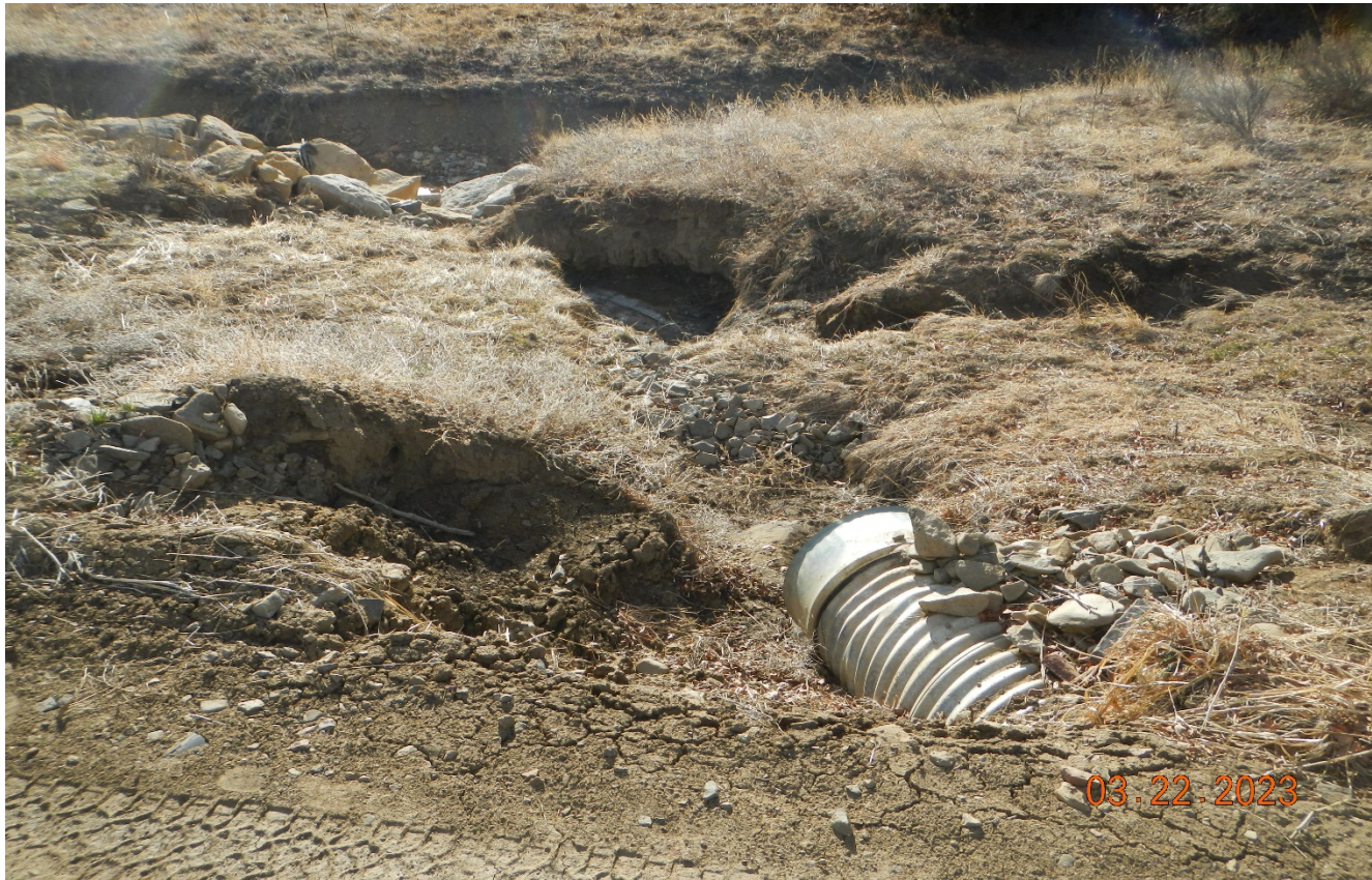
Photo 3. The next culvert along the road is also eroded at the culvert outlet with no outlet protection. Previous corrective action was not completed.