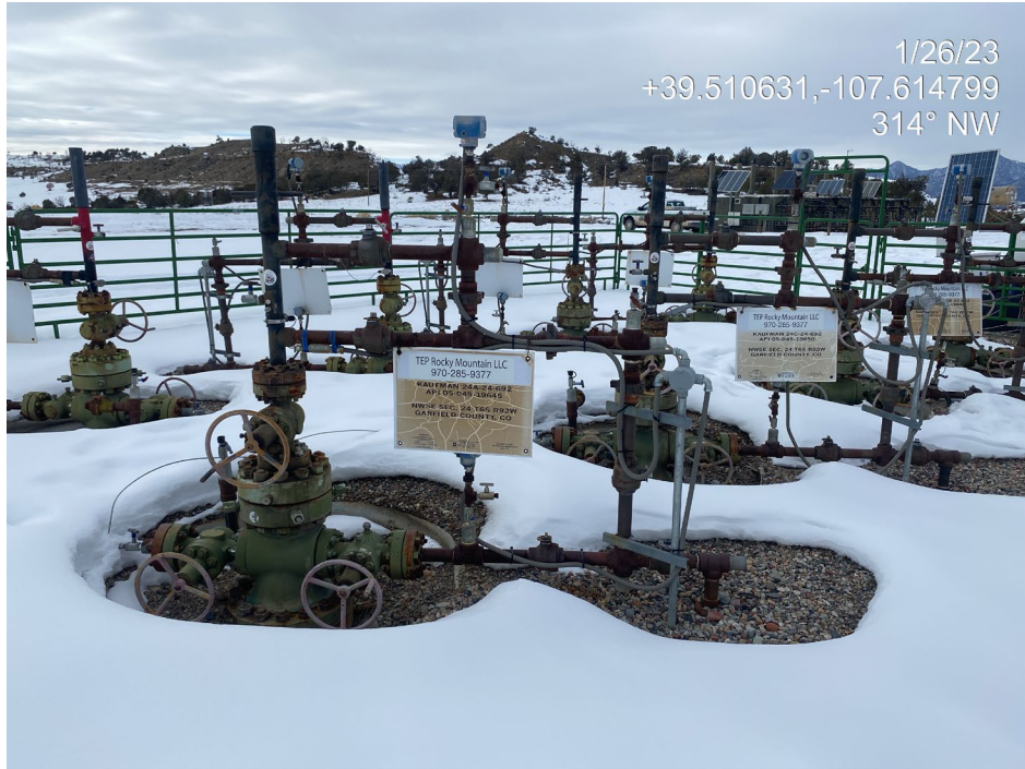
Photo 4. Photos show production areas.