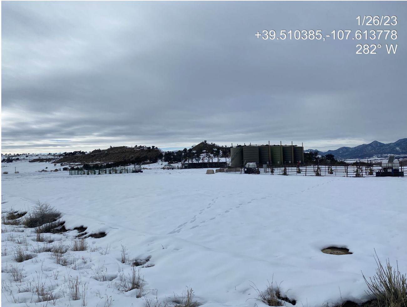
Photo 1. Photo taken from the east shows an overview of the location.