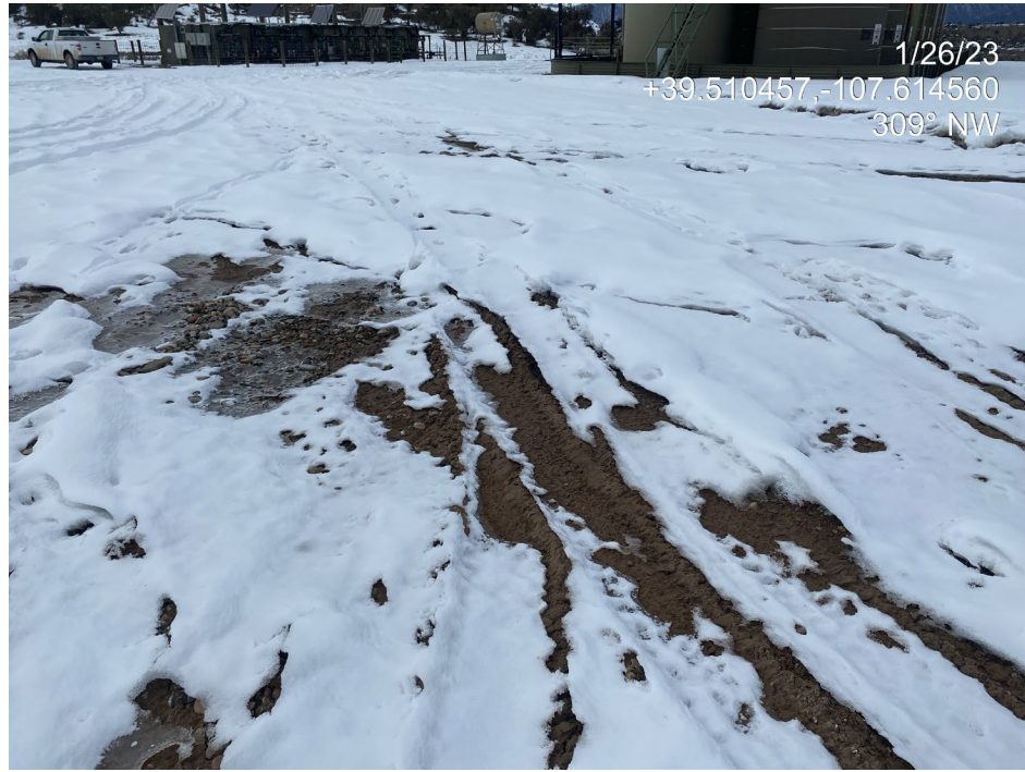
Photo 3. Photos show degradation to the pad surface and lack of stabilization BMPs and tracking controls.