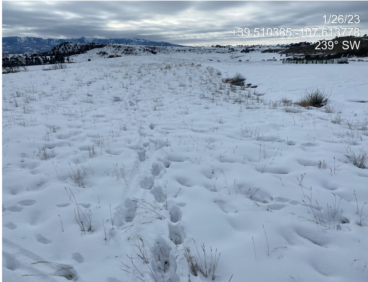
Photo 5. Photo shows an example of interim area vegetation. Perennial grasses appear established.