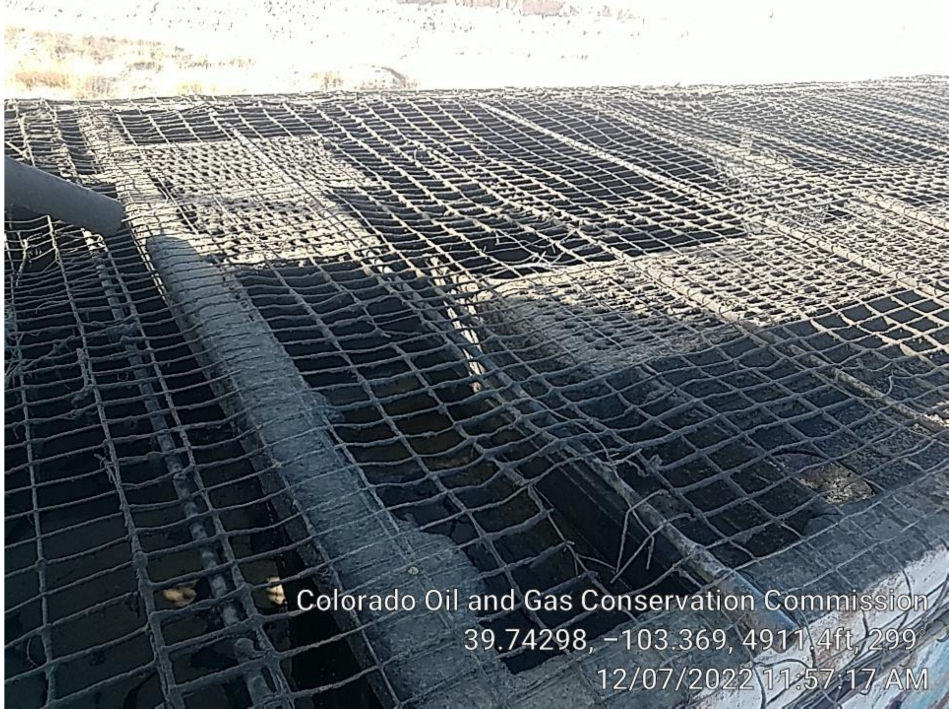
Skim tank's insides.

Colorado Oil and Gas Conservation Commission