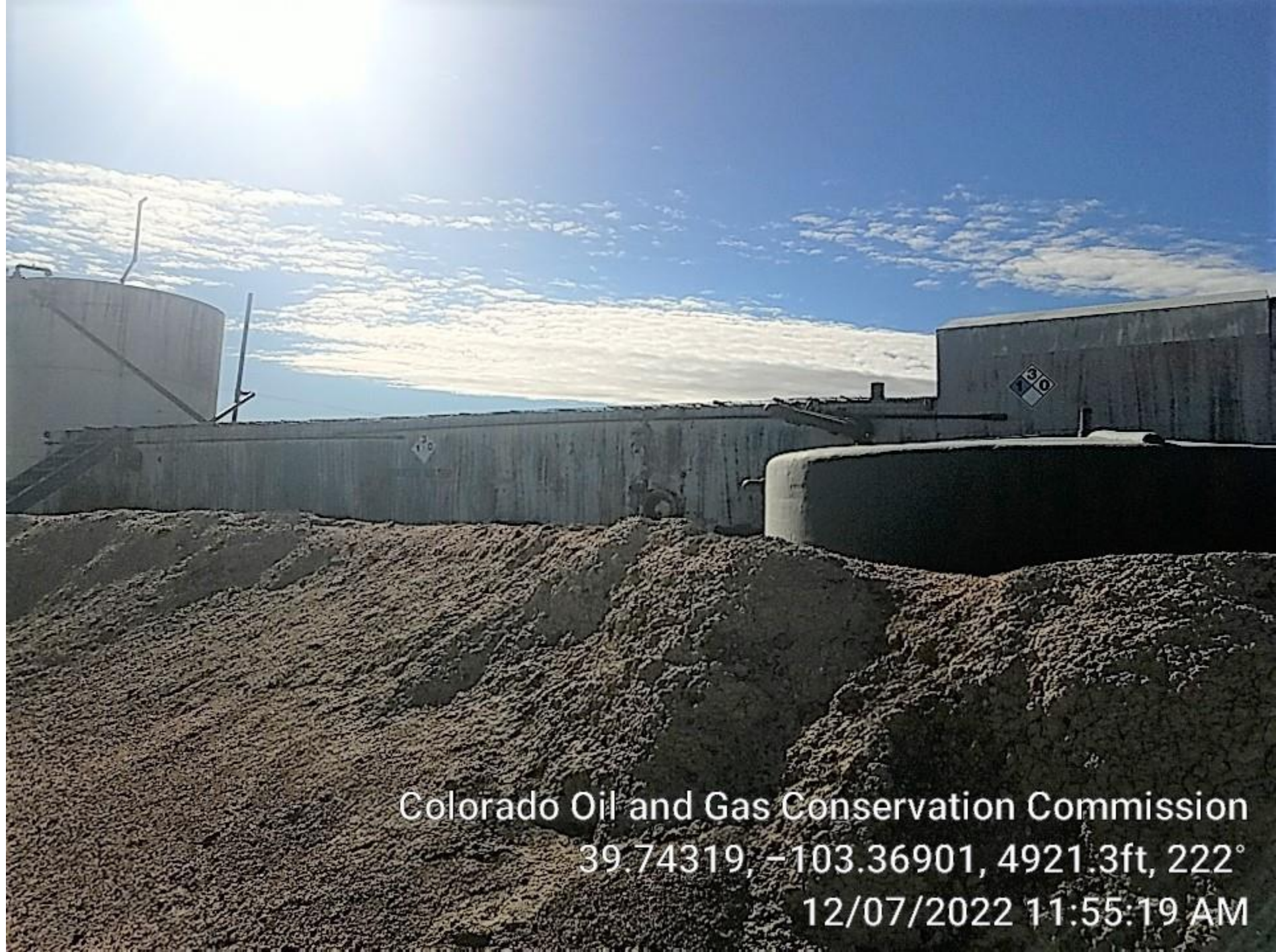
Frac tank “skim” pit.

Colorado Oil and Gas Conservation Commission 39.74319, -103.36901, 4921.3ft, 222° 12/07/2022 11:55:19 AM