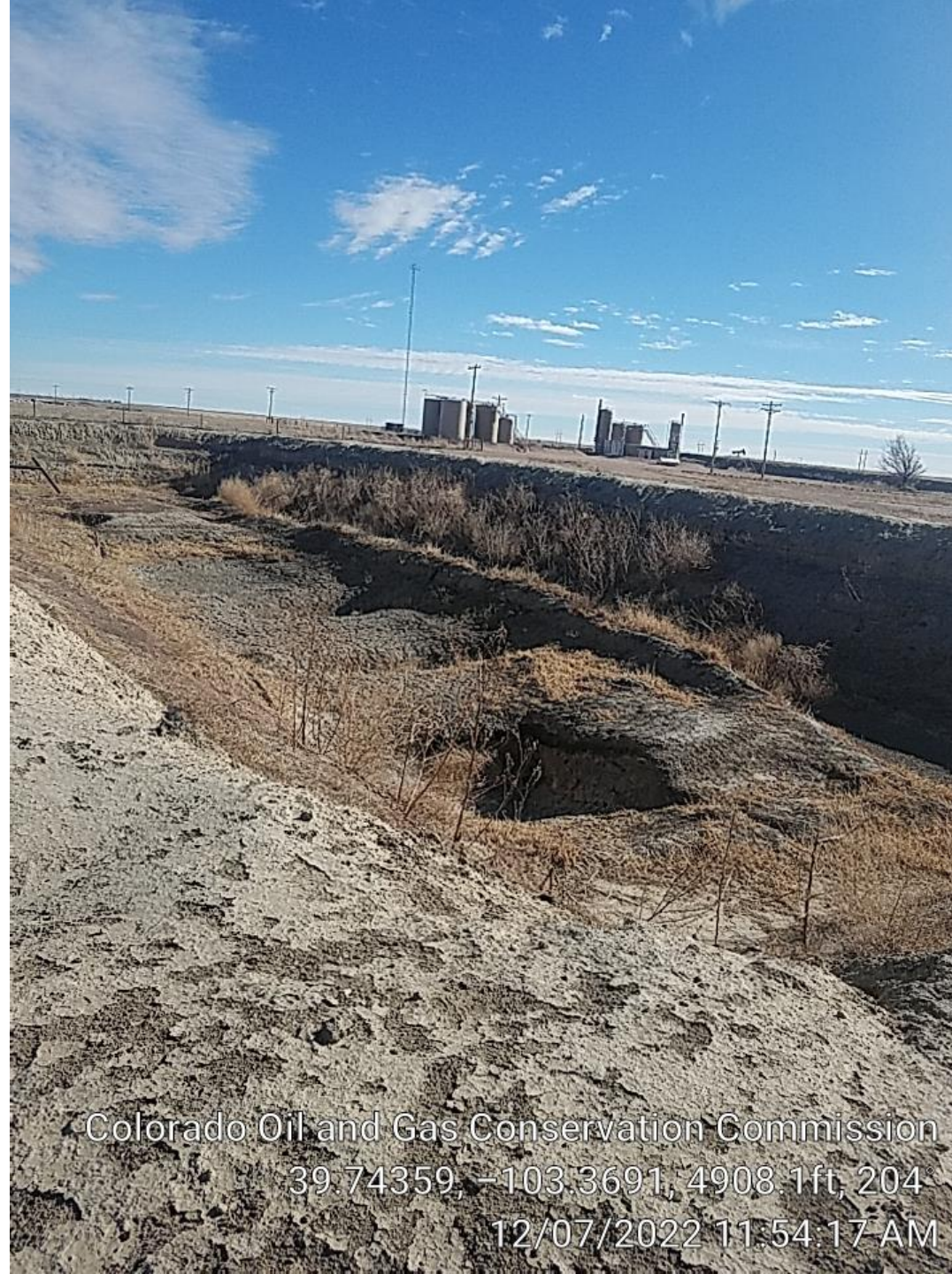
Two of two active produced water pits north of tank batteries

Colorado Oil and Gas Conservation Commission 39.74359, -103.3691, 4908.1ft, 204 12/07/2022 11:54:17 AM