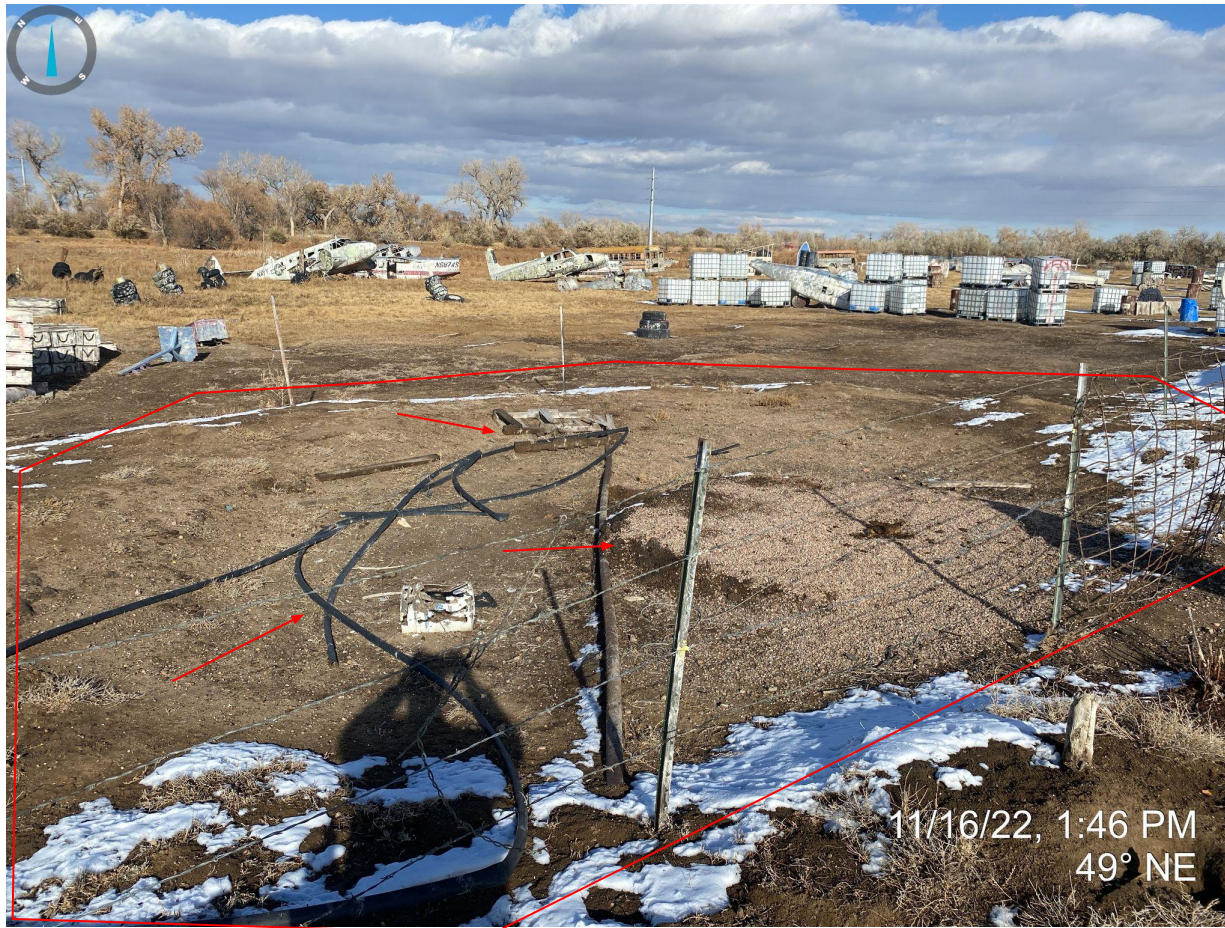
Photo 1. Taken near the former tank battery location, facing northeast. Photo illustrates the tank battery has been removed; various debris (e.g. pipe, fittings, etc) remain on site and need to be removed to comply with Rule 1004.