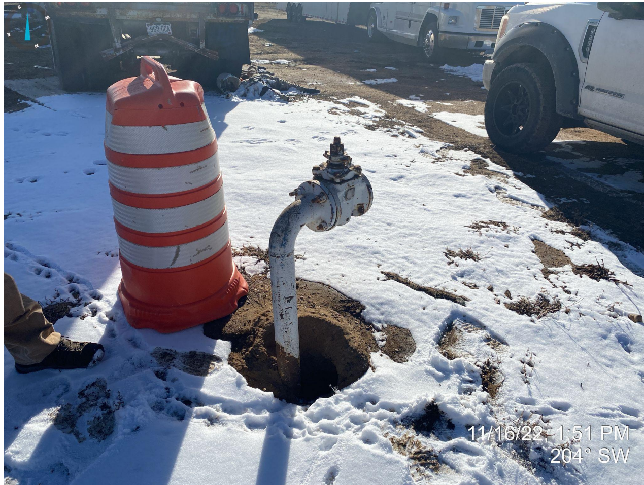
Photo 2. Taken west of the location facing southwest. Photo illustrates a pipeline riser that needs to be removed.