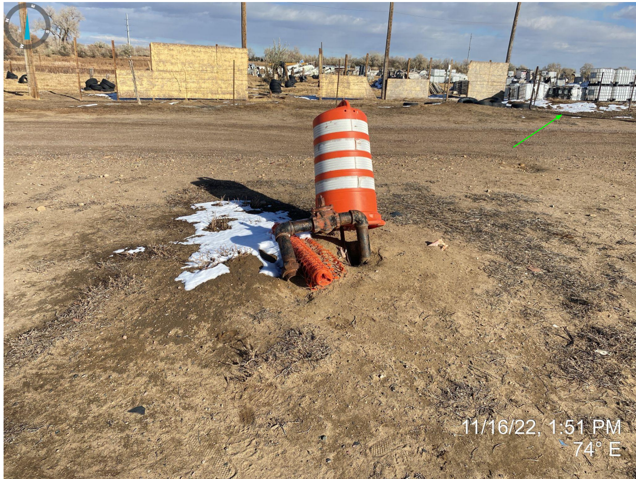
Photo 3. Taken west of the location, facing east. Photo illustrates a pipeline riser that needs to be removed. Green arrow shows former production pit that needs to be closed and approved by a Form 27.