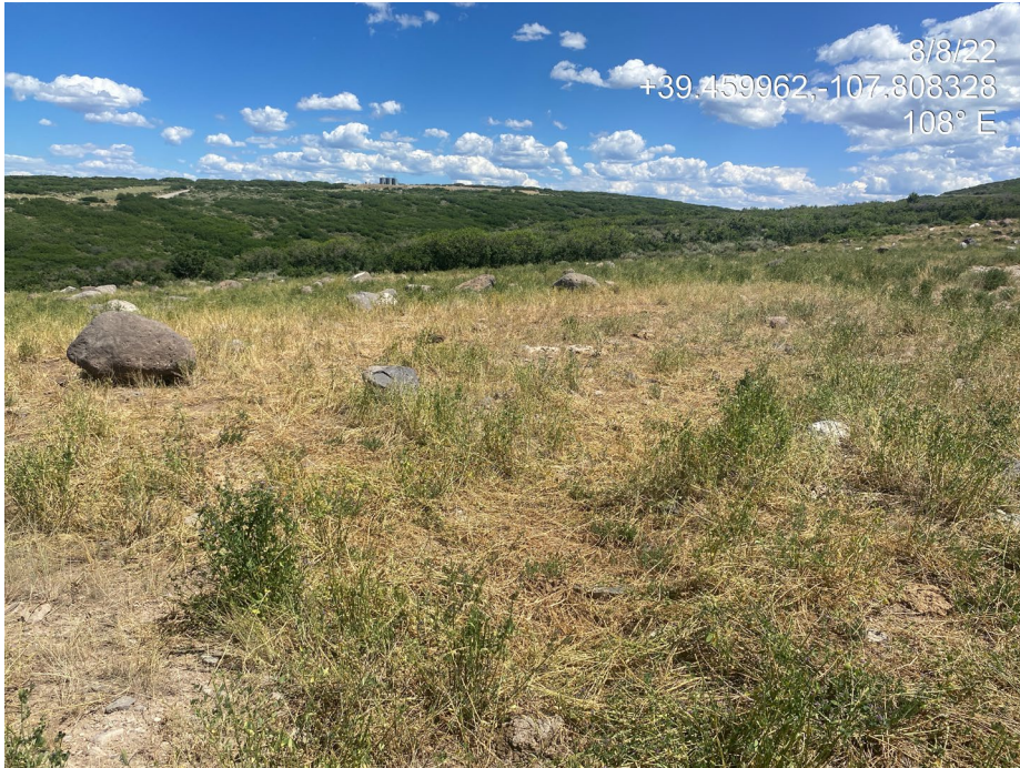
Photo 5. Photo taken from the north of the Location shows the eastern interim area. Interim areas are vegetated with bluebunch wheatgrass, western wheatgrass (native perennial grasses) and alfalfa (introduced perennial forb) which may or may not persist.