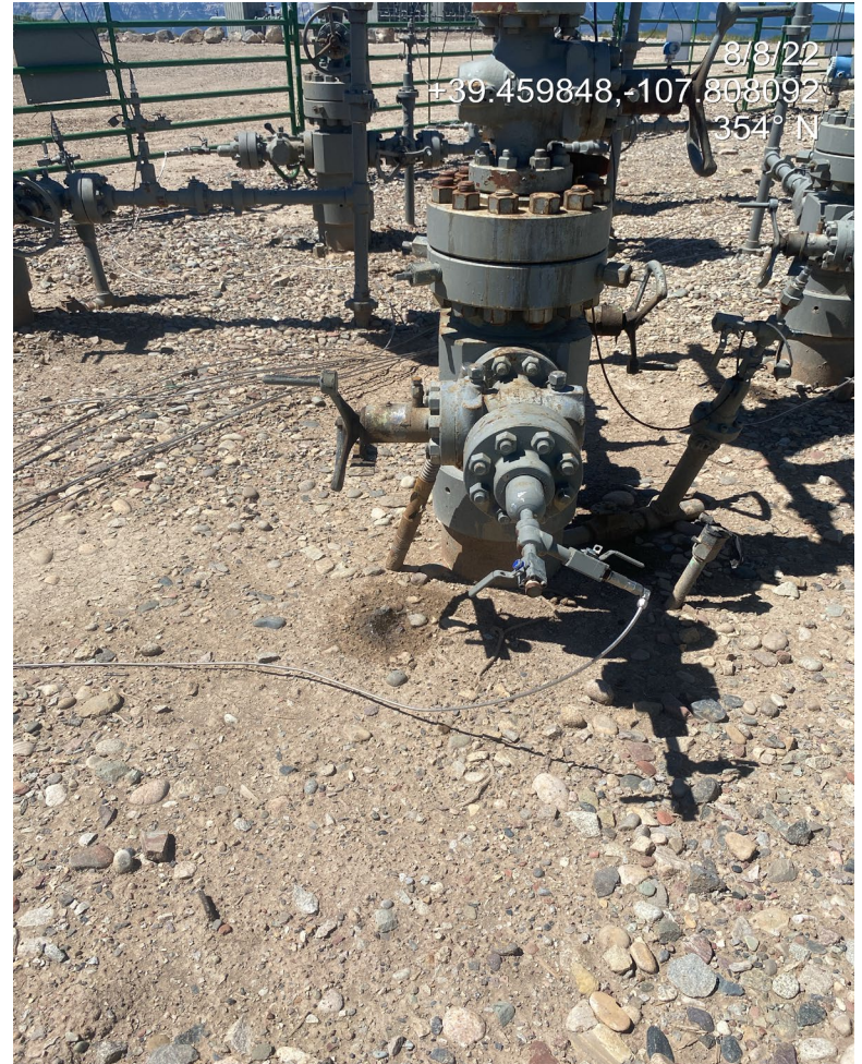
Photo 7. Photos taken from the well area shows stained soils around wellheads. Stained soils observed at the four easternmost wellheads.