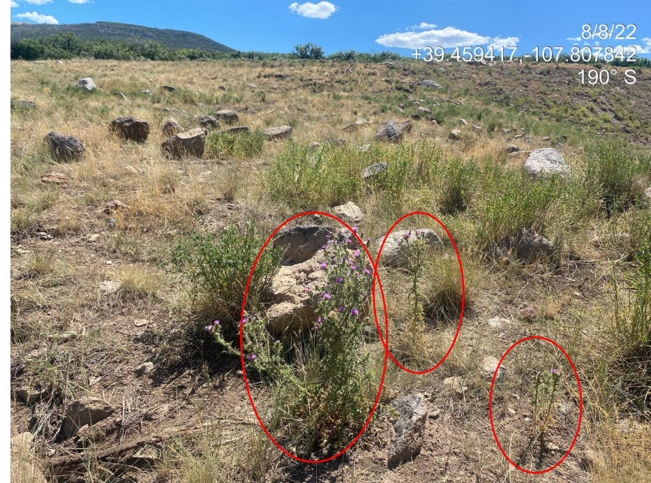
Photo 6. Photo taken from the south of the Location shows the southern interim area. Red circles indicate plumeless thistle (CO List B Noxious Weed).