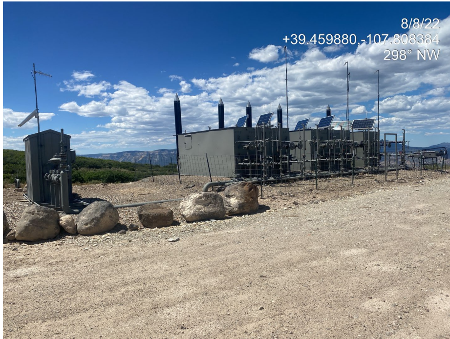
Photo 3. Photo taken from the Location entrance to the west shows an overview of the production area.