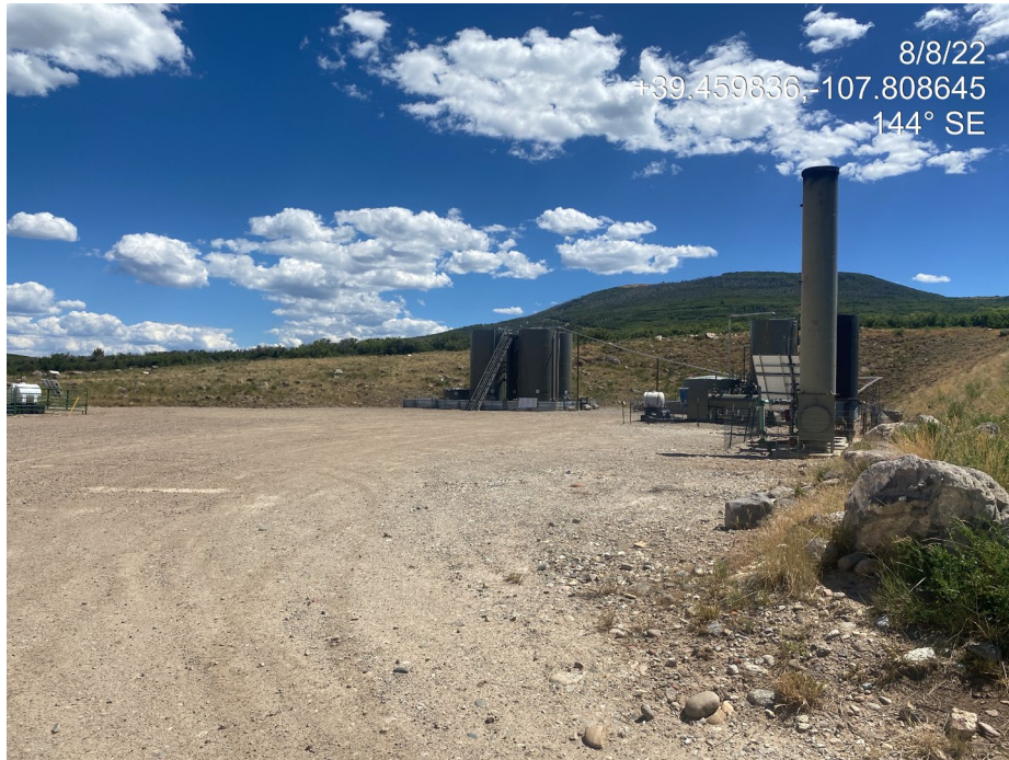
Photo 1. Photo taken from the Location entrance to the west shows an overview of the production area.