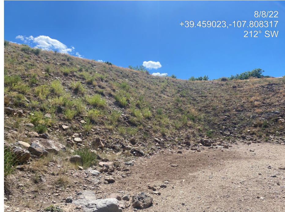
Photo 4. Photo taken from the south of the Location shows the cut slope is stabilized with perennial vegetation.