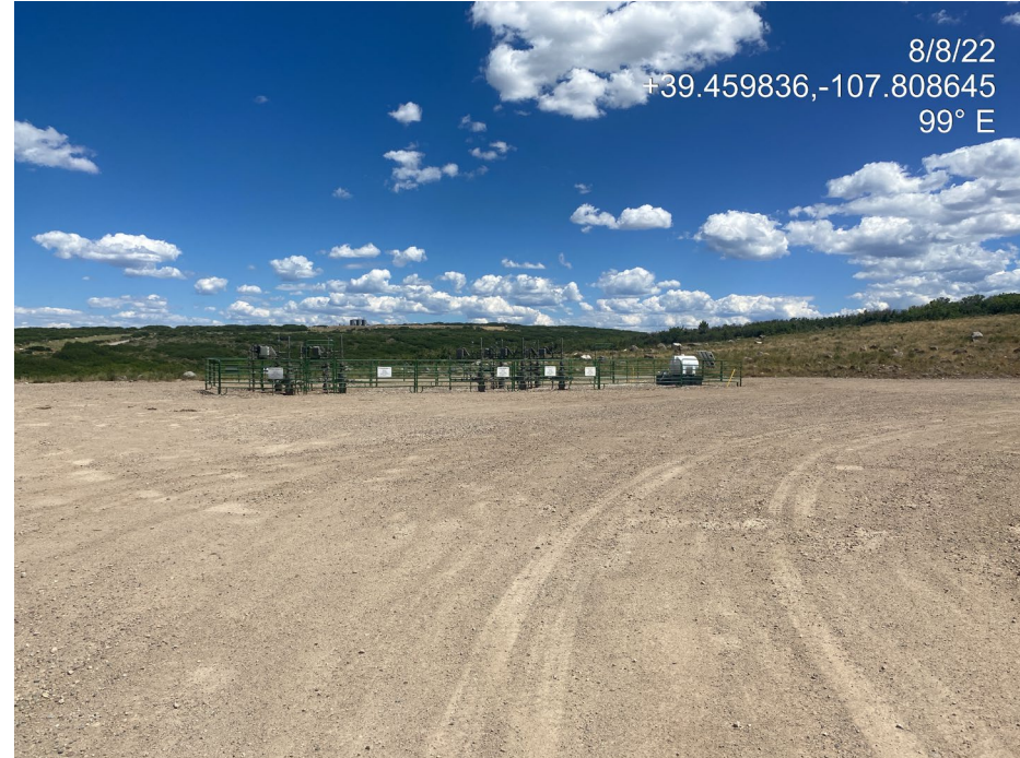
Photo 2. Photo taken from the Location entrance to the west shows an overview of the production area.