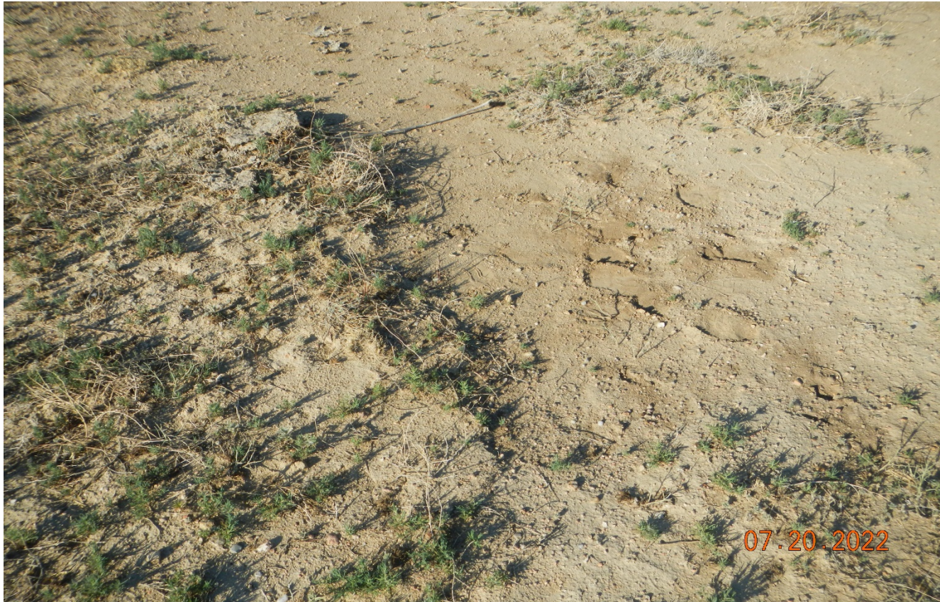
Photo 7. View of groundcover at the center of the location shows bare soils as well as undesirable weeds (Kochia, Russian thistle).