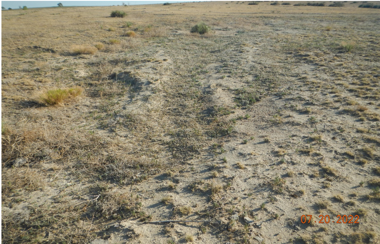
Photo 4. There are areas of sparse vegetation and undesirable weeds.