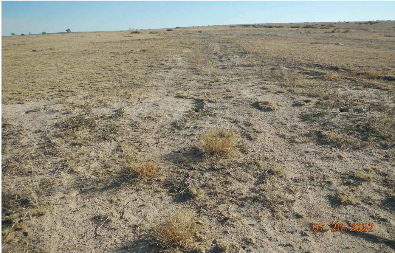
Photo 2. Facing northeast at the beginning of the access road. The vegetation along the former road has not established. There are areas of erosion that need to be repaired and stabilized.