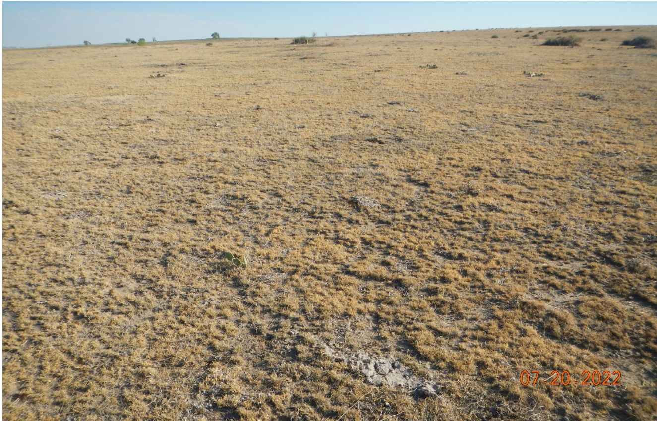
Photo 8. Facing north at the surrounding undisturbed Buffalo grass pasture.