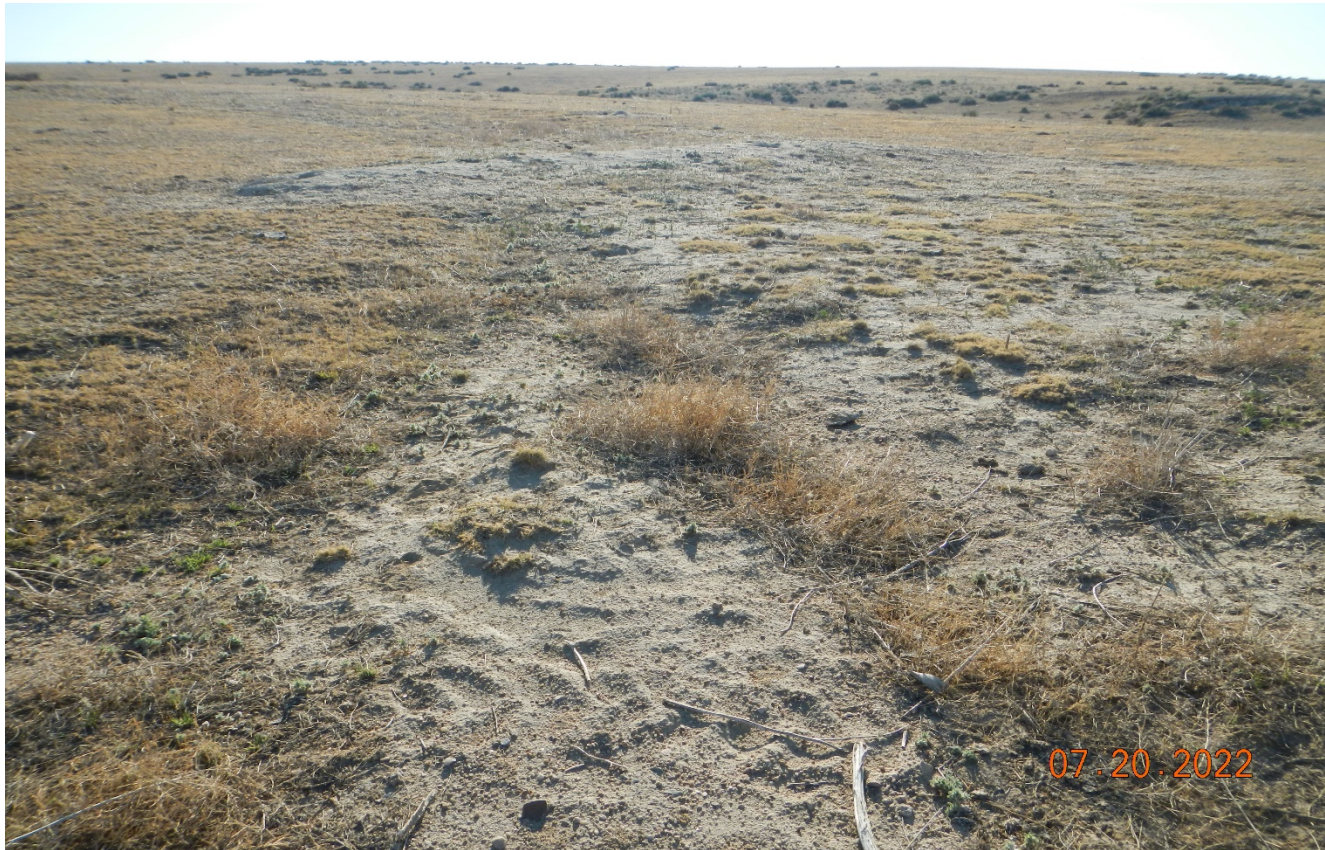
Photo 1. Facing northeast at the beginning of the access road. The vegetation along the former road has not established.