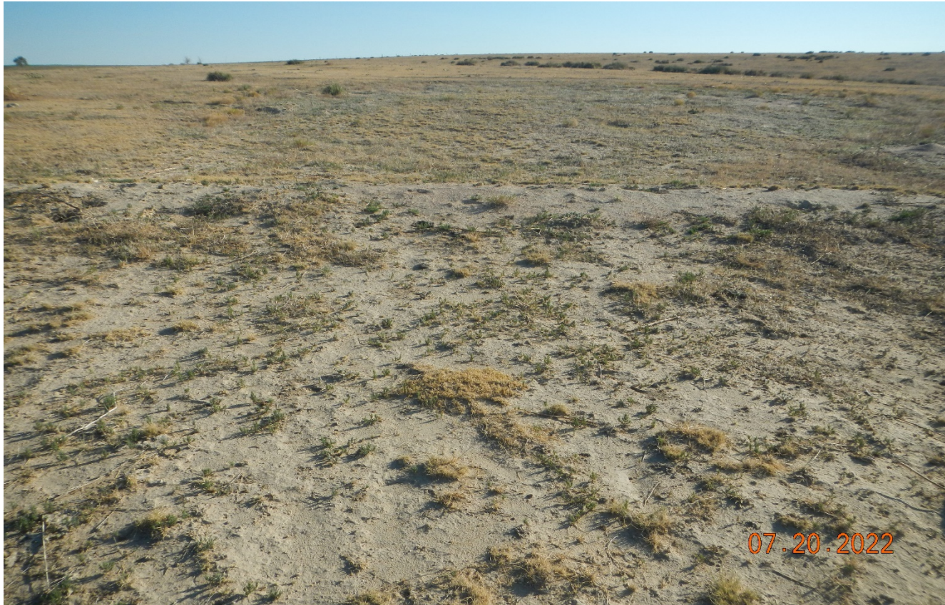
Photo 3. Facing northeast toward the location. The location has not established desirable vegetation cover of at least 80% of reference area levels.