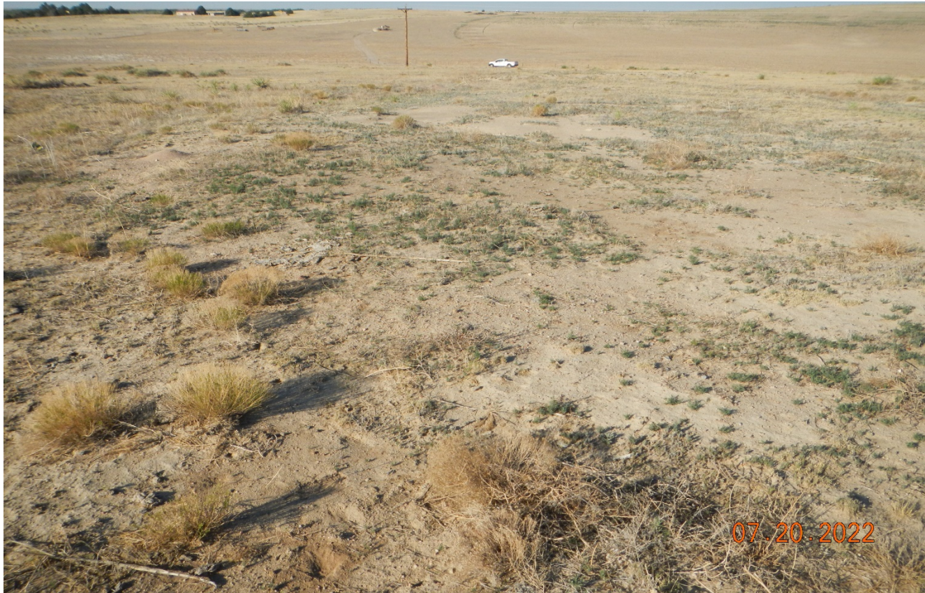
Photo 5. Facing southwest at the location. There are areas of sparse vegetation and undesirable weeds.