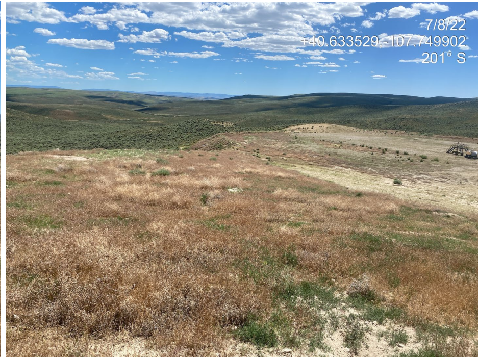
Photo 2. Photo taken from the northeast shows an overview of the southern portion of the Location. Refer to additional Photo 1 comments.