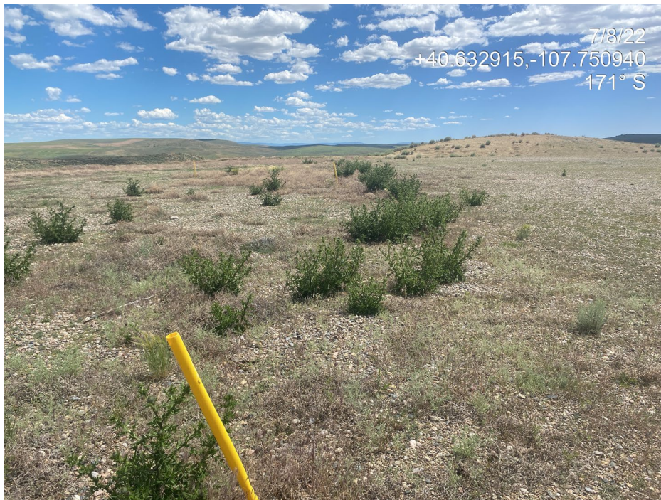
Photo 5. Photo taken from the center of the Location shows an example of bull thistle, a CO List B Noxious Weed on Location.