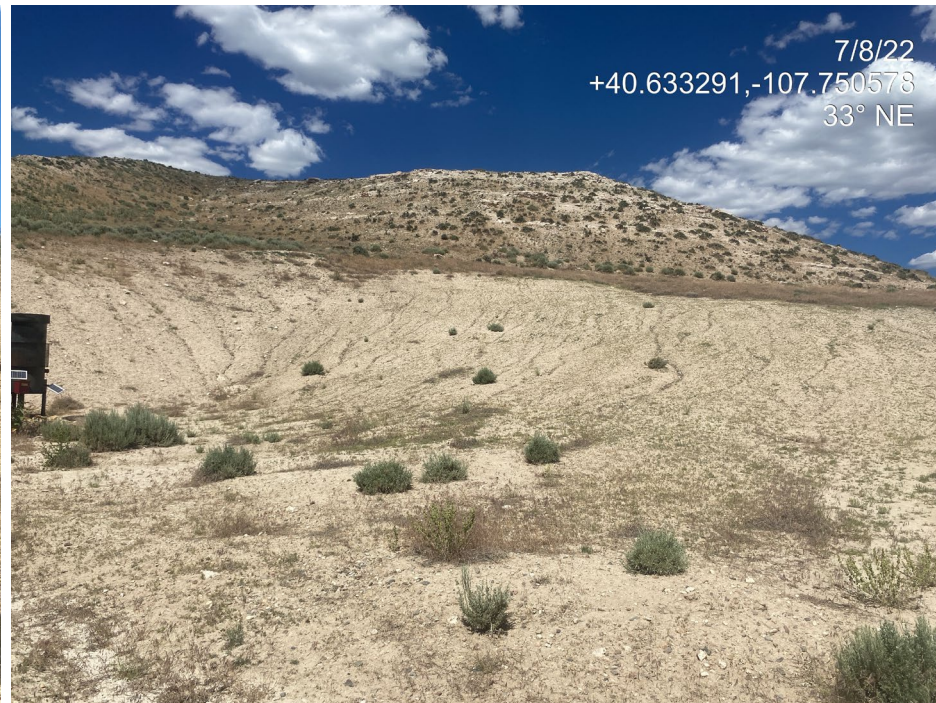
Photo 10. Photo taken at the northeast of the Location shows rill erosion occurring on the unstabilized and unprotected cut slope.