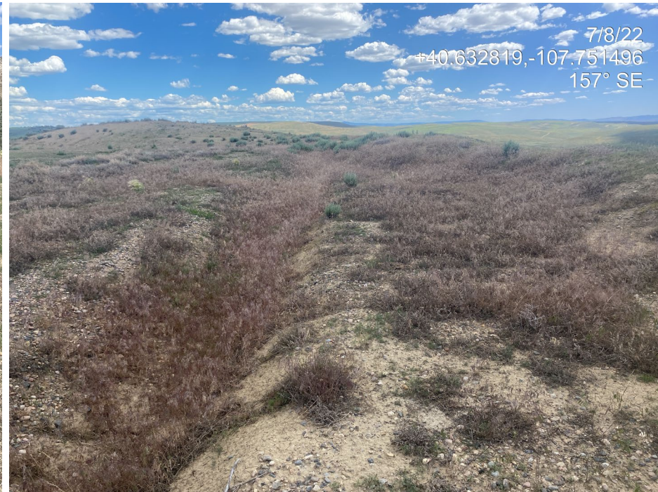
Photo 8. Photo taken from the west of the Location shows the pad surface covered with cheatgrass, a CO List C Noxious Weed.