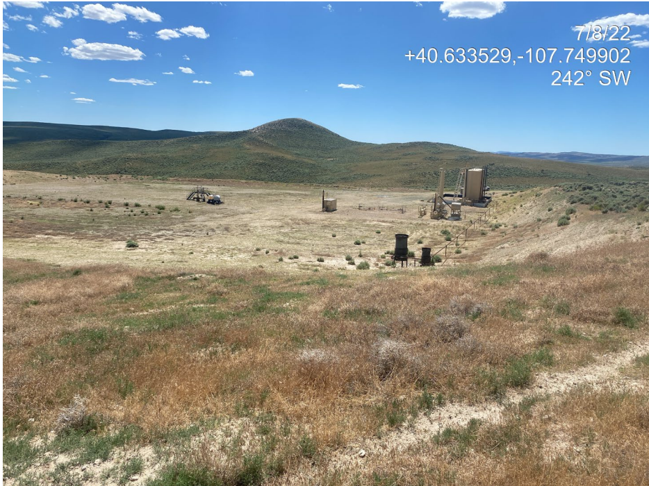
Photo 1. Photo taken from the northeast shows an overview of the northern portion of the Location. Photo also shows dense cover of cheatgrass (List C Noxious) and Russian thistle (undesirable plant species). Note, interim reclamation has not been performed.