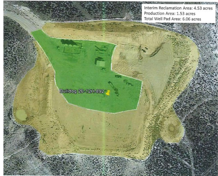
Photo 4. Photo shows the “Location Drawing” from document #401412004 which shows an estimate of production areas and interim reclamation areas included in variance request document #401291893. Variance expired 5/1/2022. Interim reclamation is required.