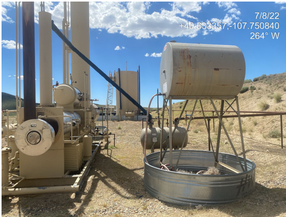
Photo 9. Photo taken from the north of the Location shows an example of missing or insufficient wildlife protection BMPs on a secondary containment stock tank.