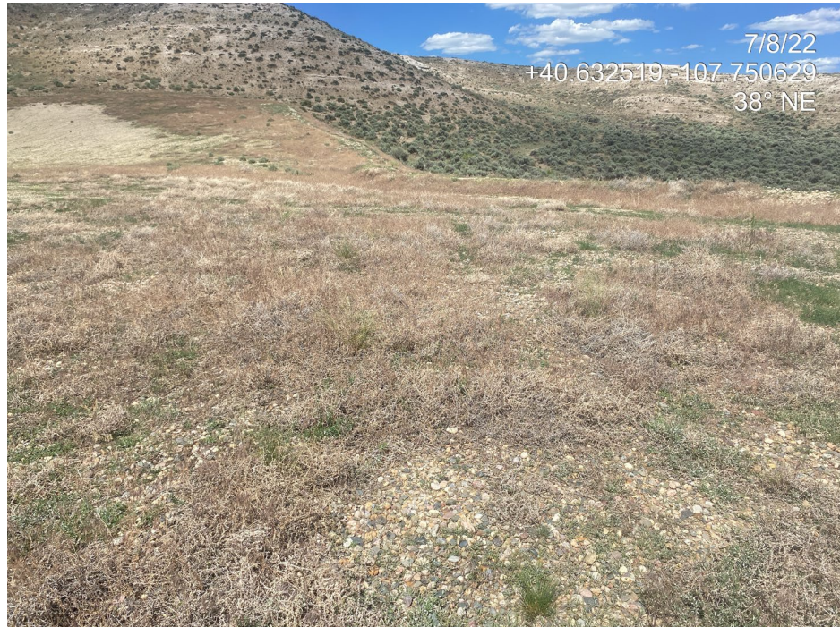
Photo 7. Photo taken at the south of the Location shows the pad surface covered with Russian thistle, an undesirable plant species.