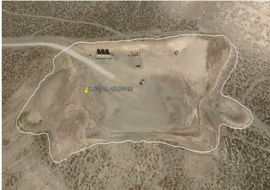
Photo 3. Photo shows aerial imagery of the Location from Google Earth. Imagery is dated 10/2019. The white line indicates a ground track walked during the 7/8/2022 inspection showing the approximate disturbance/unreclaimed area.