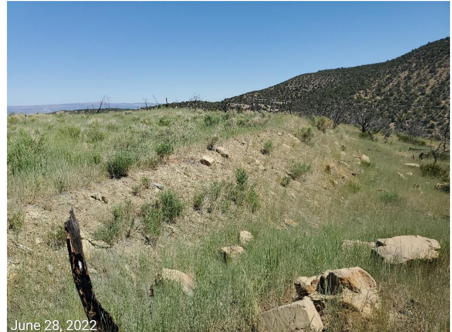
Photo 2: Photos showing cut and fill slopes of the Location, as well as what appears to be the topsoil stockpile (arrow).