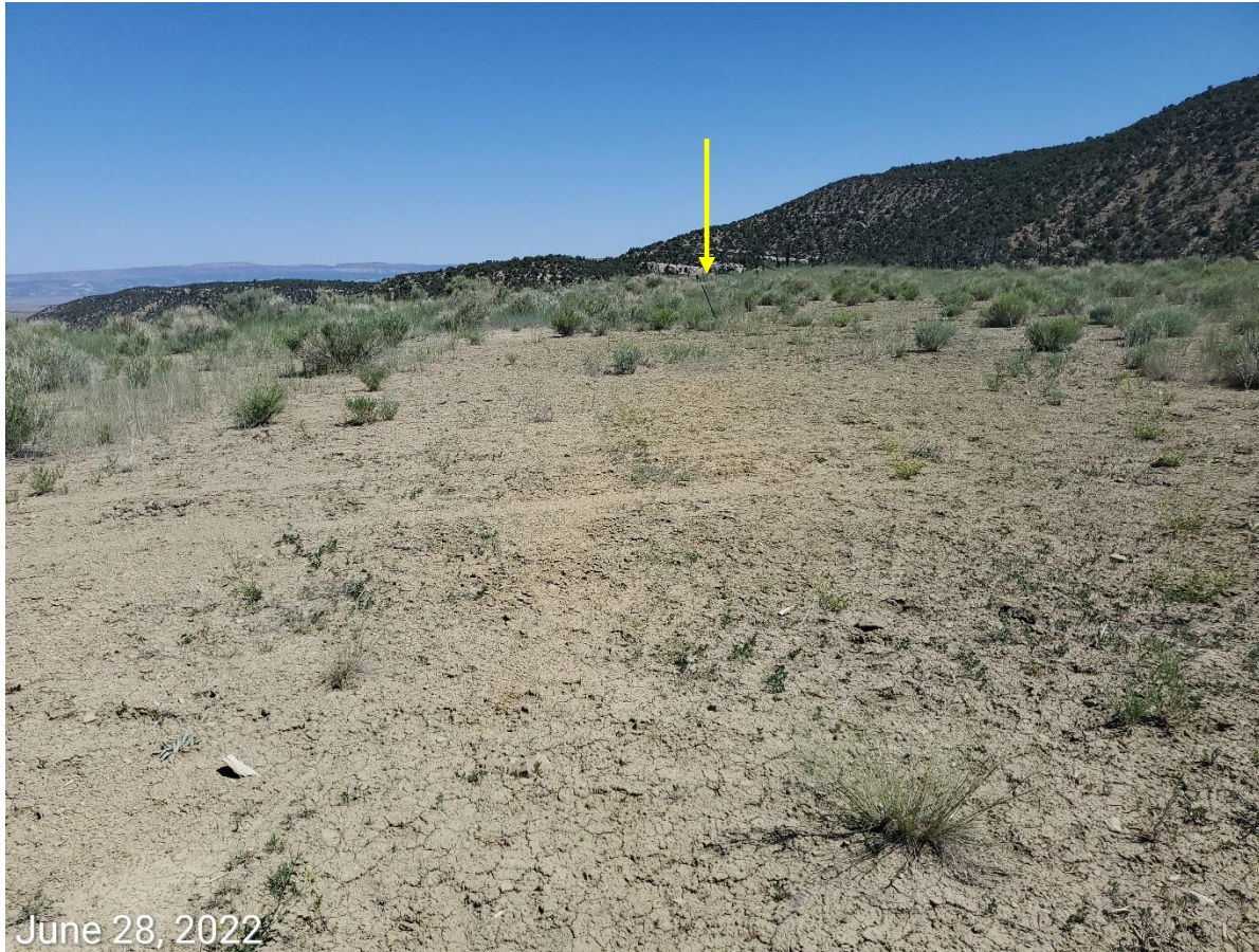
Photo 3: Photo taken from the Location, facing north. Photo shows well pad and well marker; pad has been constructed, however well has not been drilled; all Form 2 and Federal “permits to drill” on file for the Location have expired, and the Location is subject to Final Reclamation requirements. Submission of additional permits does not waive compliance with 1004 requirements.