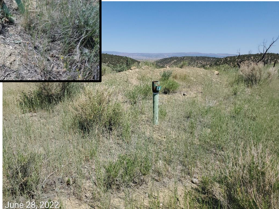
Photo 3: Photos showing various pipe equipment observed on the Location; well has not been drilled.