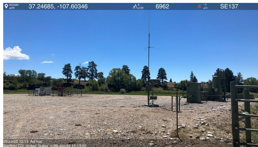
IMG 02 Location overview