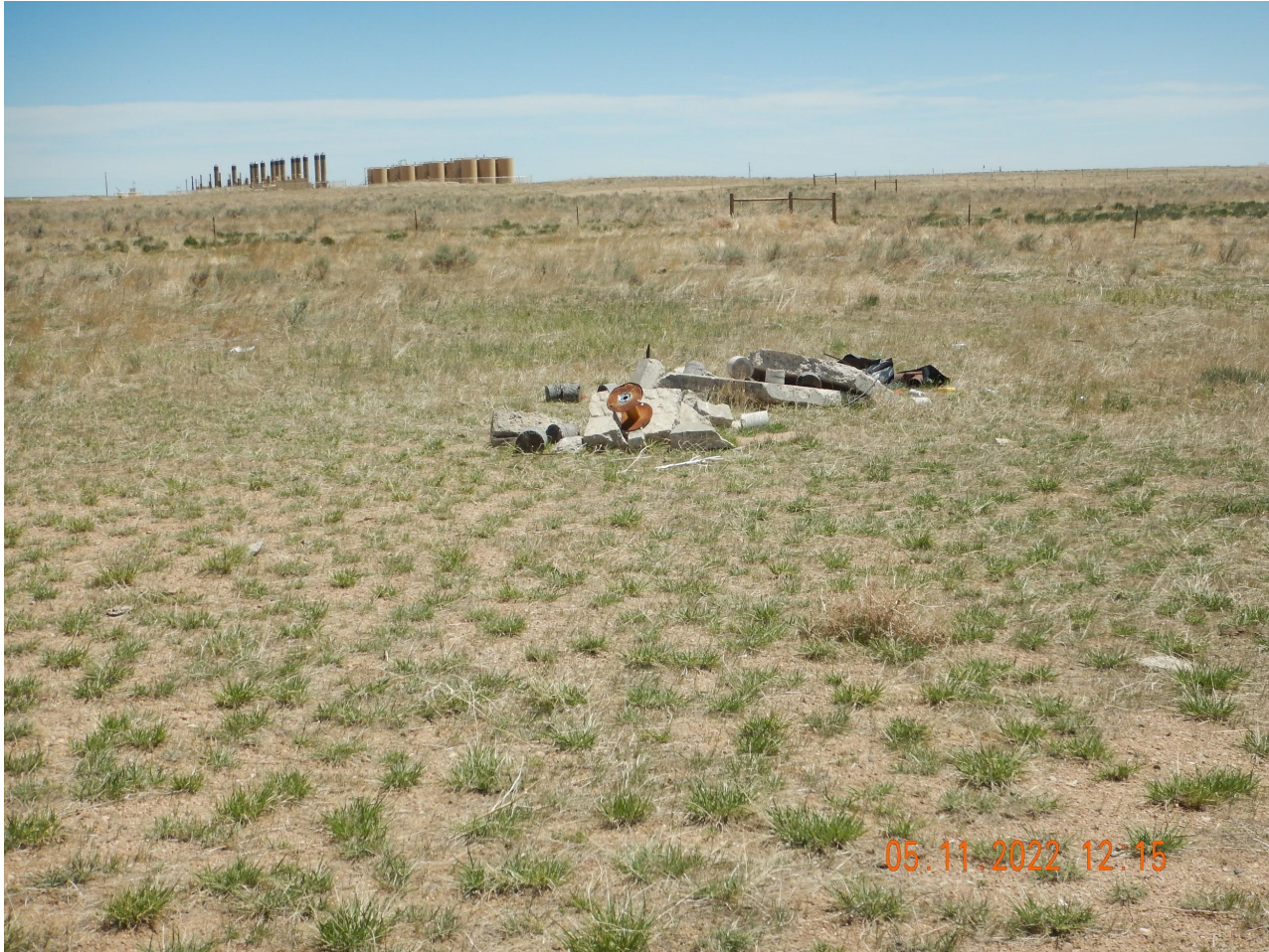
Photo 7. Photo taken from western interim reclamation area, facing West. See comments under Photo 3. Photo illustrates trash and debris that has been dumped on location.