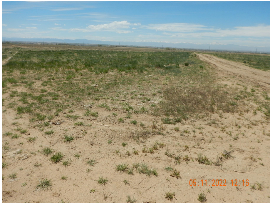
Photo 5. Photo taken from western interim reclamation area, facing West. See comments under Photo 3.