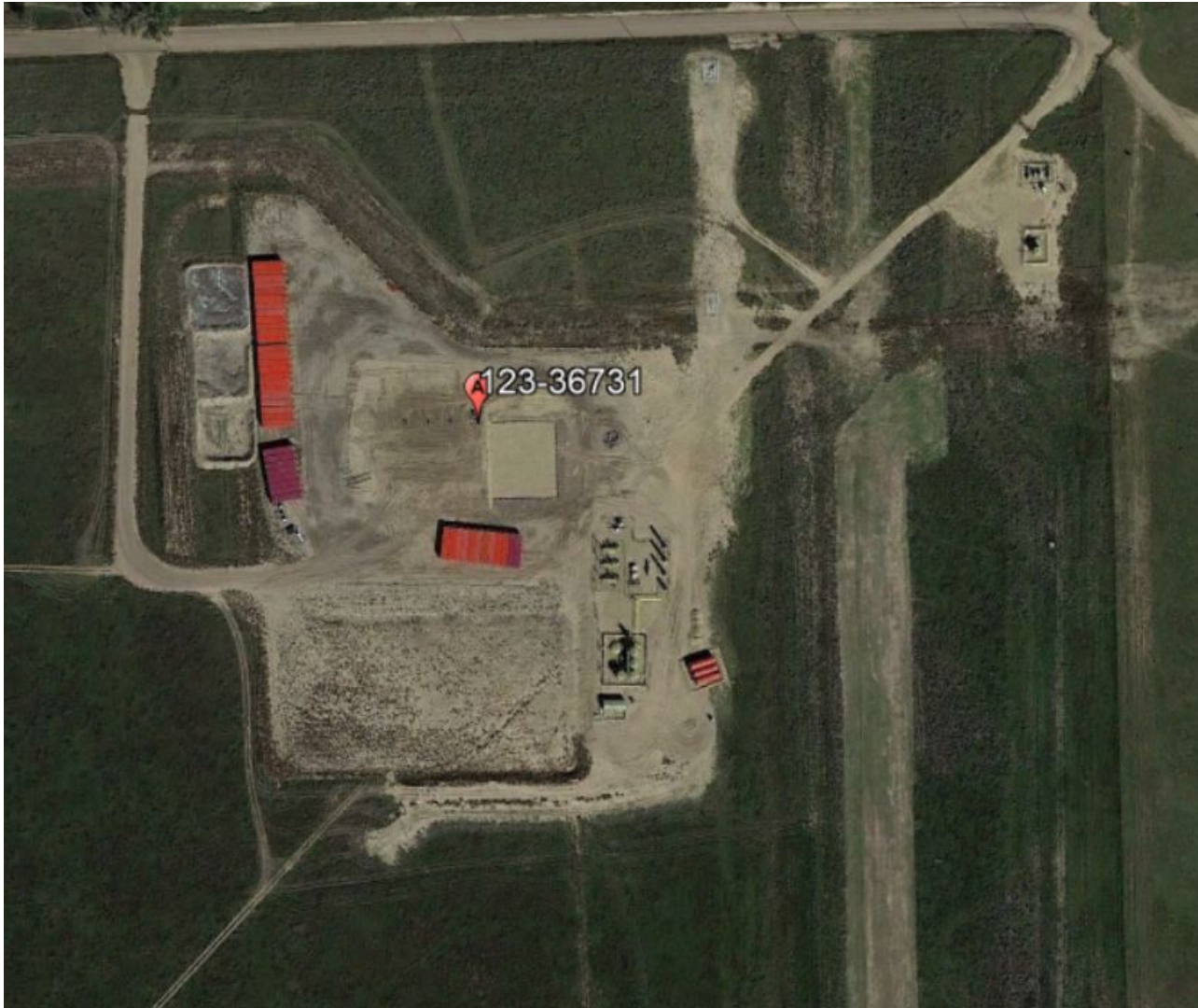
Photo 1. Google Earth aerial imagery from 10/6/2013. Photo illustrates the total disturbance area during drilling operations.