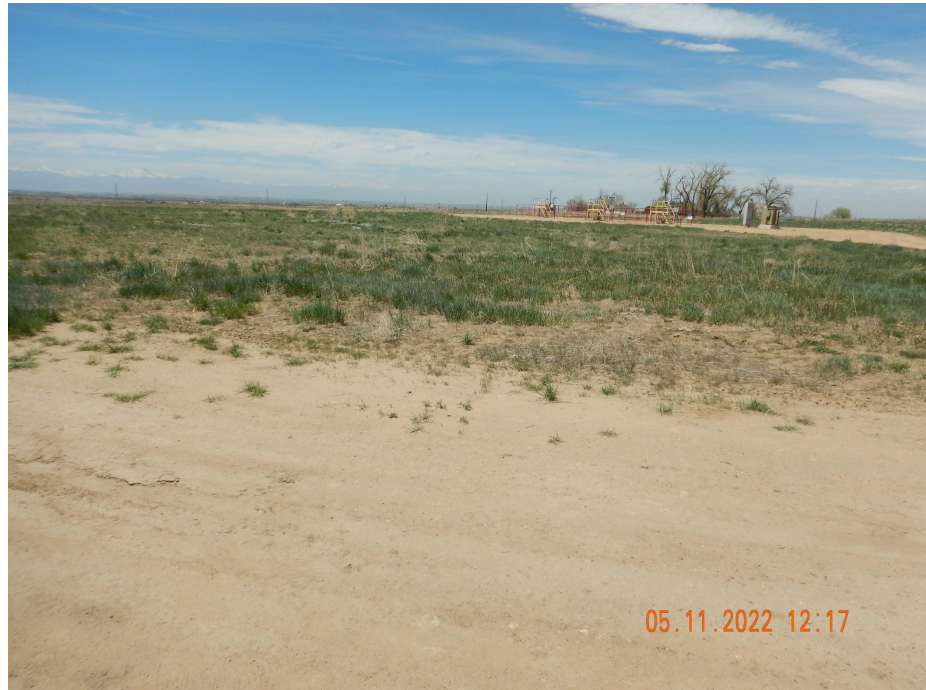
Photo 6. Photo taken from the northwest interim reclamation area, facing Northwest. See comments under Photo 3.