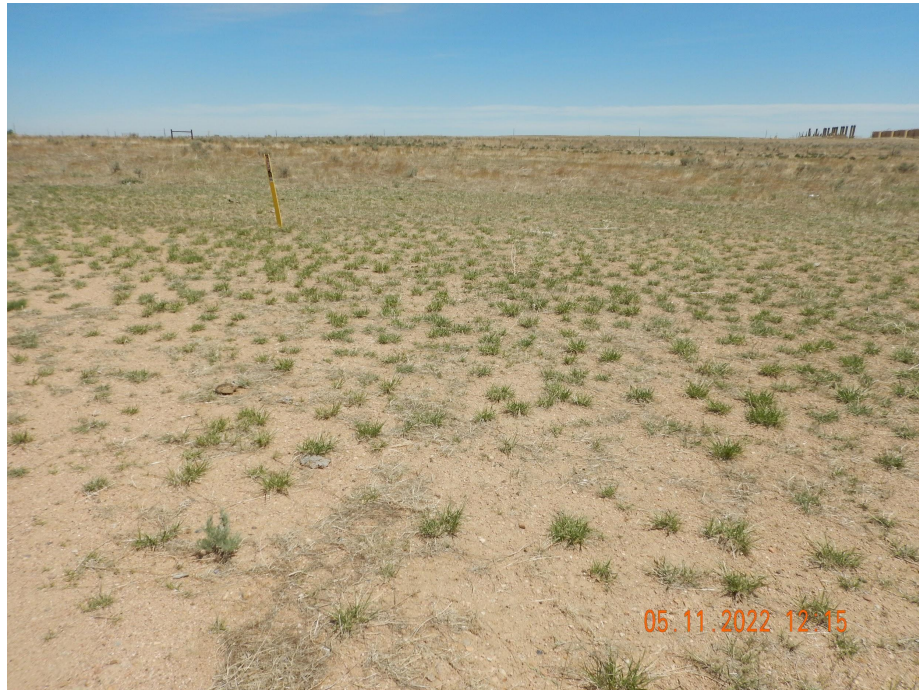
Photo 3. Photo taken from eastern interim reclamation area, facing East. Photo illustrates desirable perennial vegetation which is better than reference areas that consist of annual grasses and shrubs.