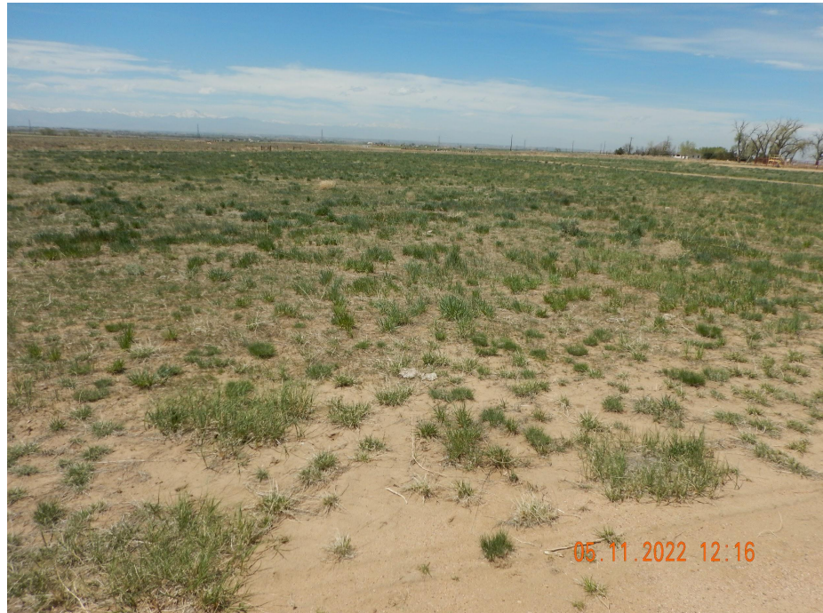
Photo 4. Photo taken from the southwest interim reclamation area, facing West. See comments under Photo 3.