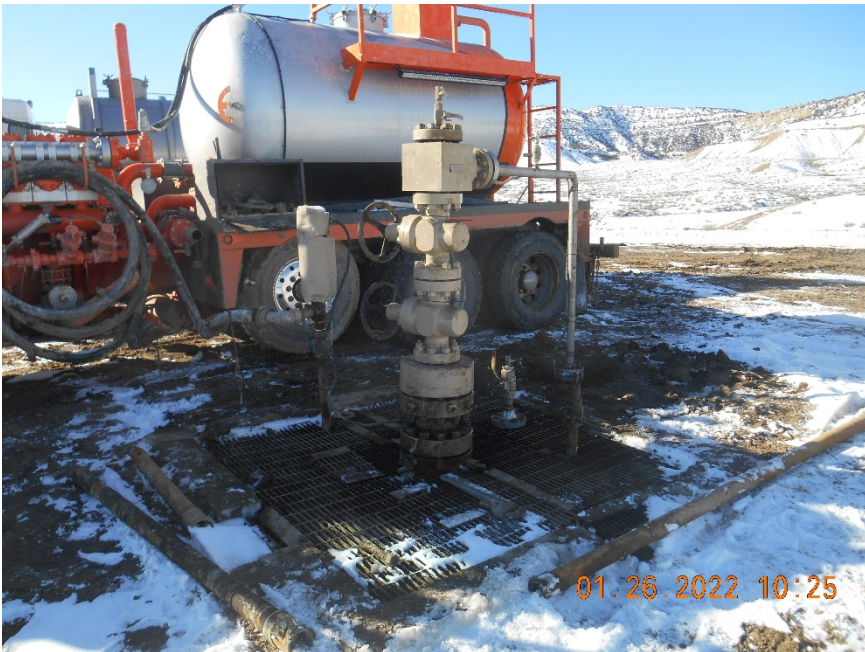
Injection wellhead during MIT