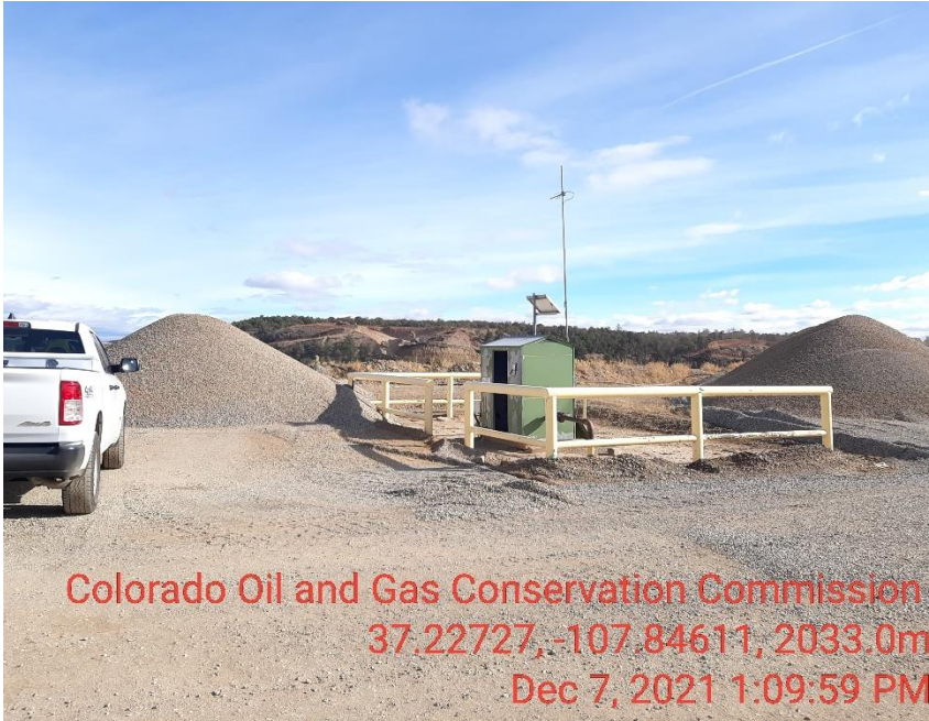
Photo 1 meter house