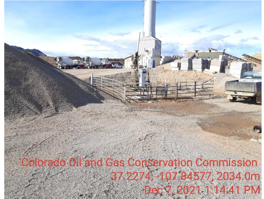
Photo 6 Only open side to well head.