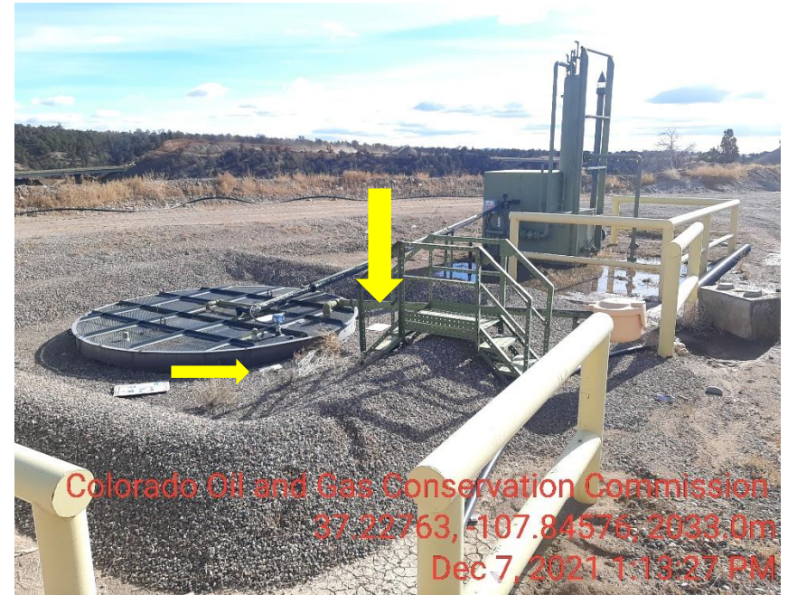
Photo 4 all signs have come off tank and are laying on ground.