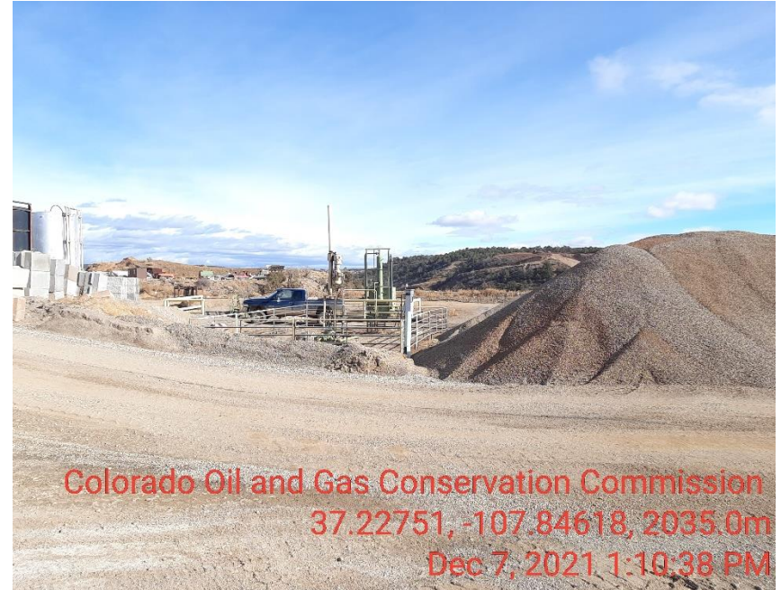
Photo 2 WH. Gravel piles blocking access to well head.