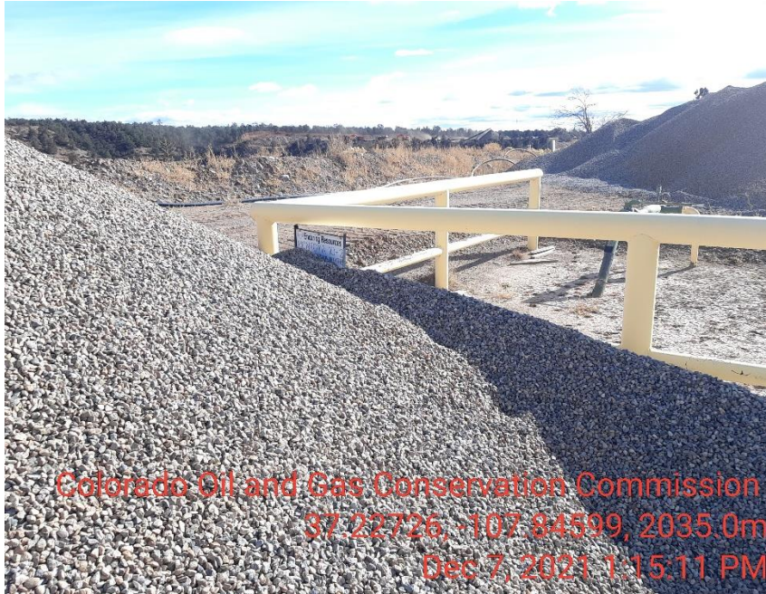
Photo 7 Well sign buried by gravel pile.