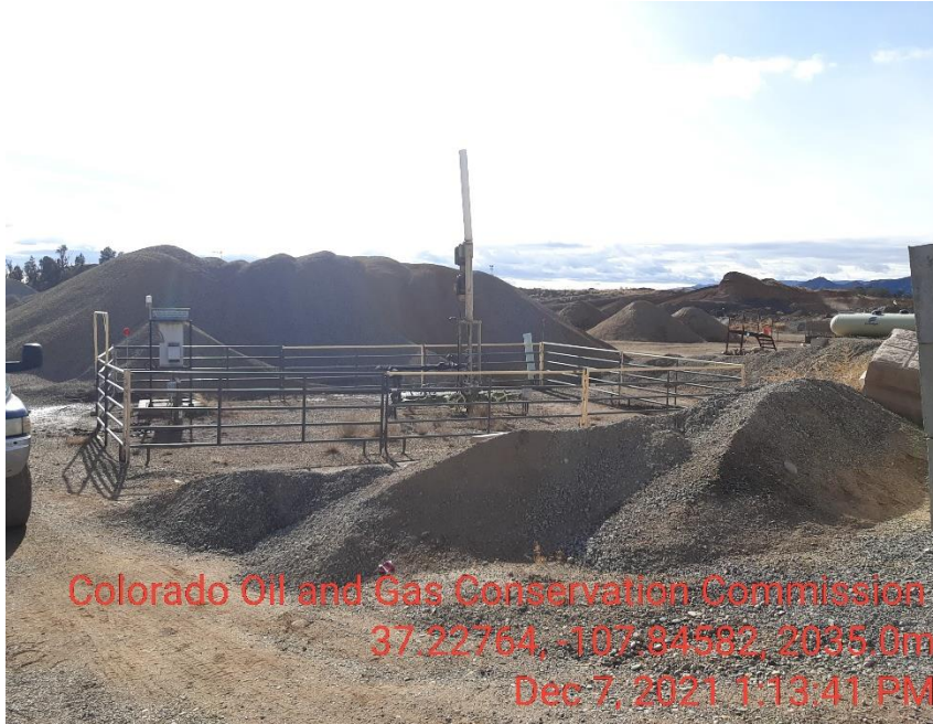
Photo 5 Access blocked to well head