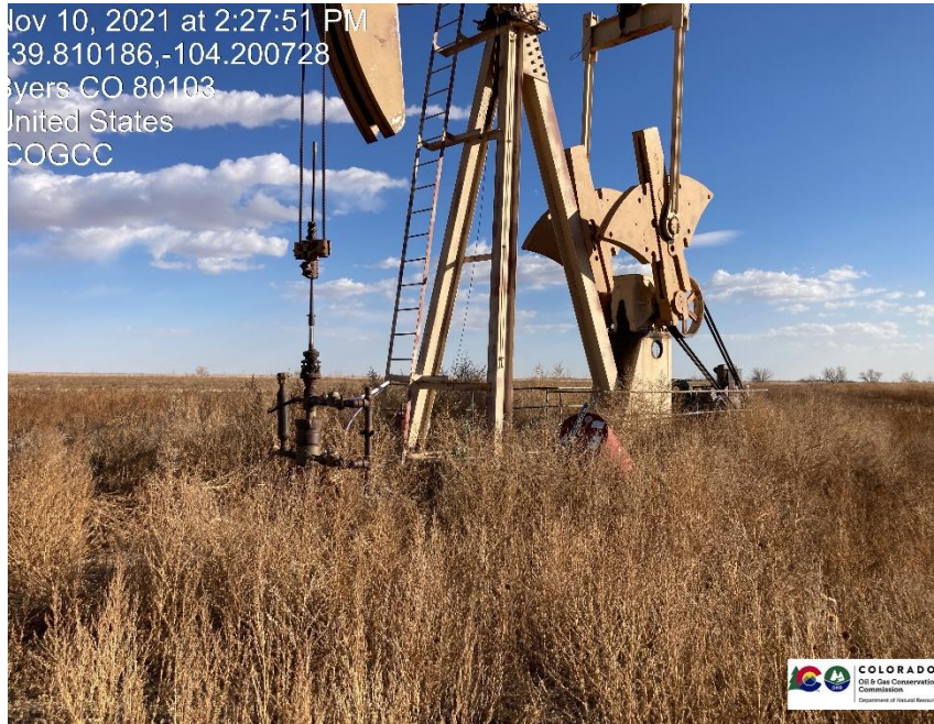
Pic 1 wellhead, weeds unmanaged.