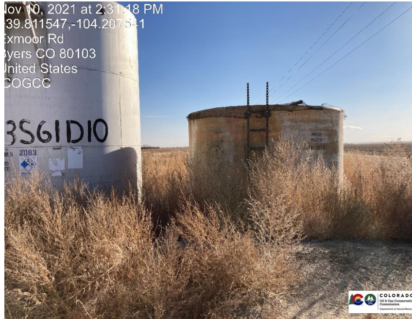
Pic 7 Tanks,