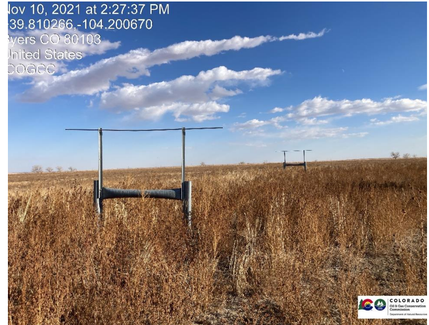
Pic 2 unused equipment by pump jack weeds unmanaged