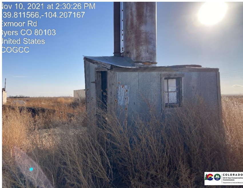
Pic 3 separator house weeds unmanaged

Nov 10, 2021 at 2:30:26 PM 39.811566,-104.207167 Exmoor Rd Byers CO 80103 United States COGCC