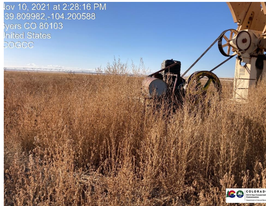
Pic 4 pumpjack motor, weeds unmanaged.

Nov 10, 2021 at 2:28:16 PM 39.809982,-104.200588 Byers CO 80103 United States COGCC