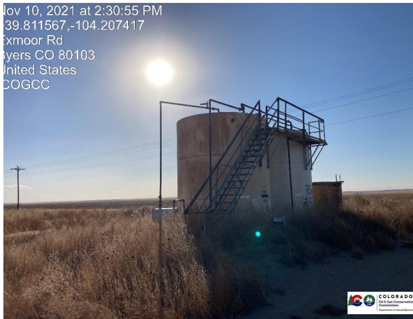
Pic 5 tanks, unable to inspect berms due to weed growth

Nov 10, 2021 at 2:30:55 PM 39.811567,-104.207417 Exmoor Rd ayers CO 80103 United States COGCC