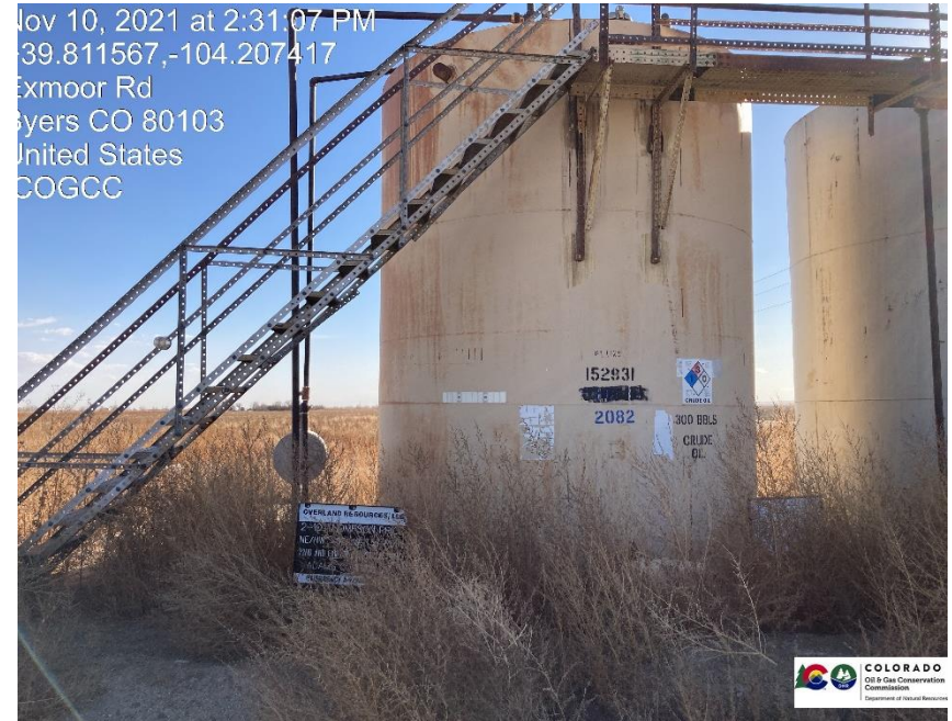
Pic 8 tanks