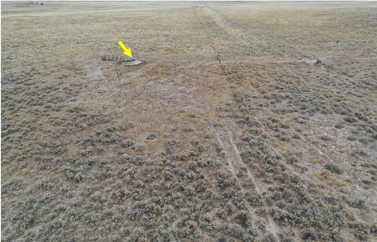
Photo 1. Drone aerial photo facing northwest toward the well site location. There is a livestock water tank located at the yellow arrow.