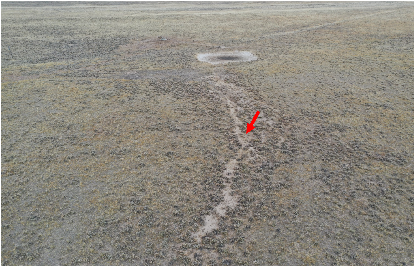
Photo 4. Facing southeast. It appears there was a former spill that occurred downhill from the pit shown in the direction of the red arrow. This area has insufficient vegetation re-establishment and extends out approximately 450' from the pit.