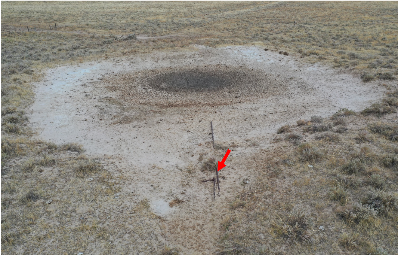
Photo 5. Facing southeast toward the pit. There is exposed piping shown at red arrow. The piping equipment was never removed.