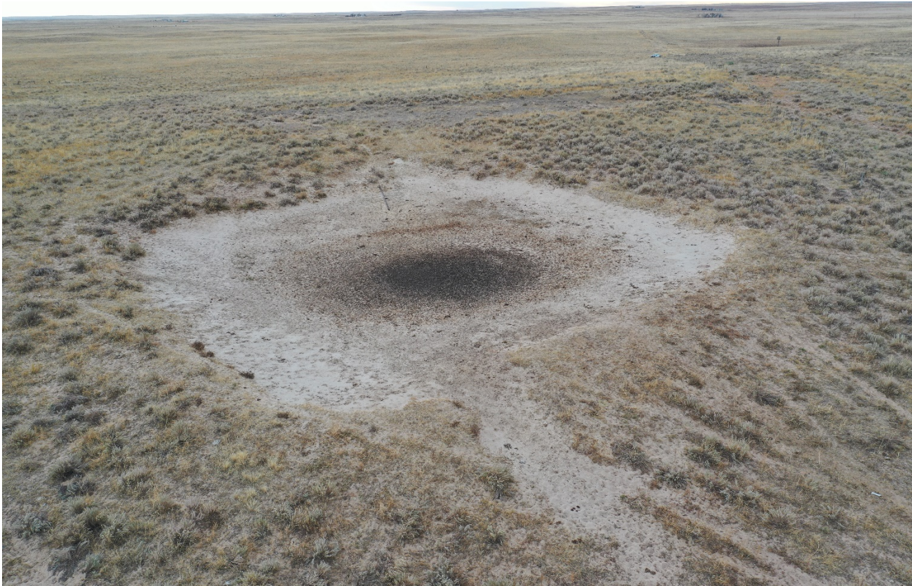
Photo 3. Facing east. The JAMES HUNT 1 Pit is not closed and reclaimed per 1004 Rules.