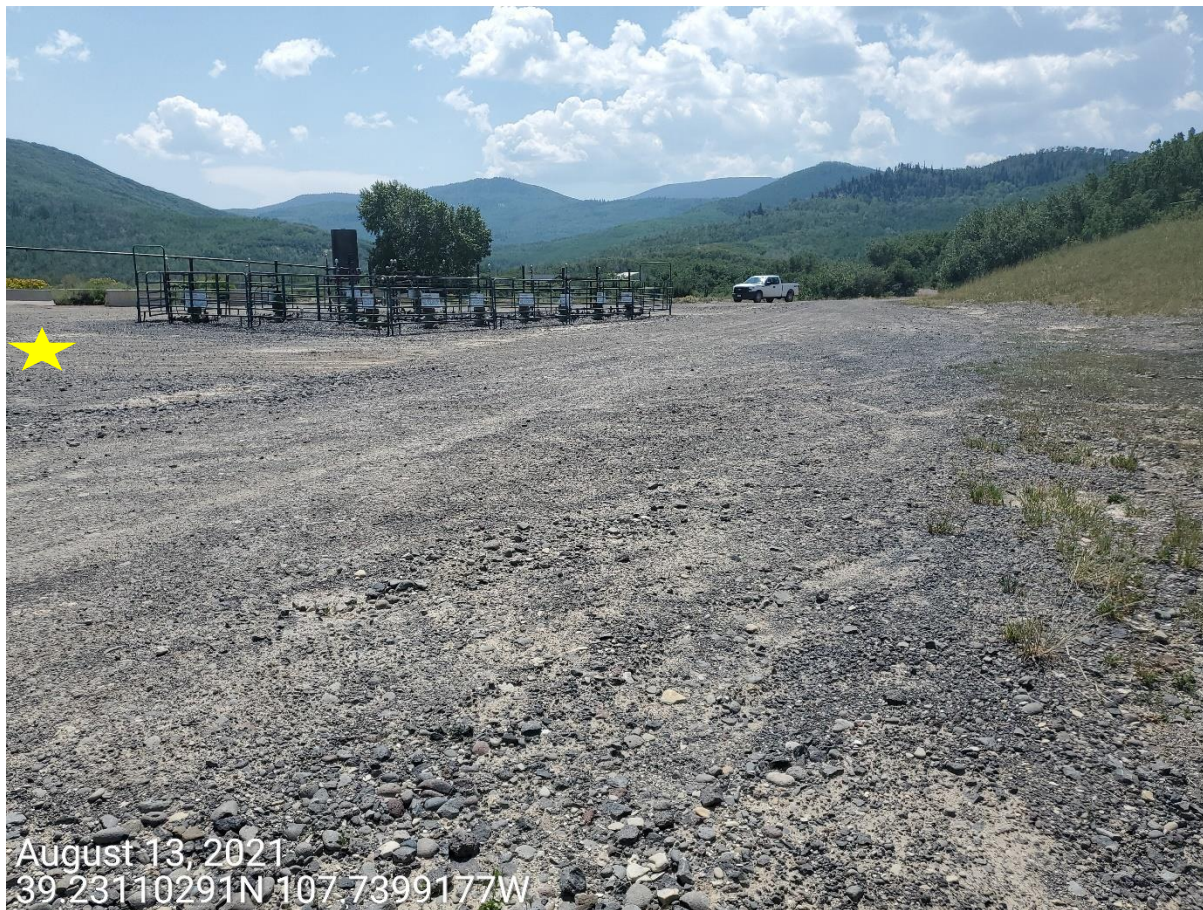
Photo 3: Photo shows all wells on the Location. Star indicates approximate Location of the Vega Unit 4 well (API 05-077-08189) as indicated by Form 6(s) #401337066.