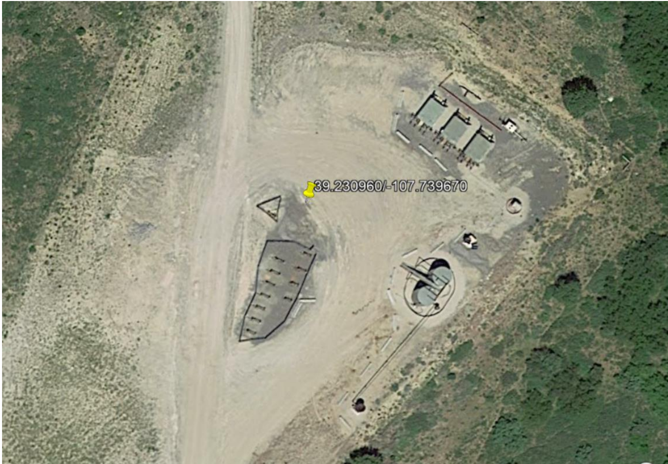
Photo 2: Google Earth aerial image showing location of the Vega Unit 4 well (API 05-077-08189) actual location as indicated by Form 6(s) #401337066. Well was PA on the Vega Unit 4 Location, and not to the south as indicated by the well files.