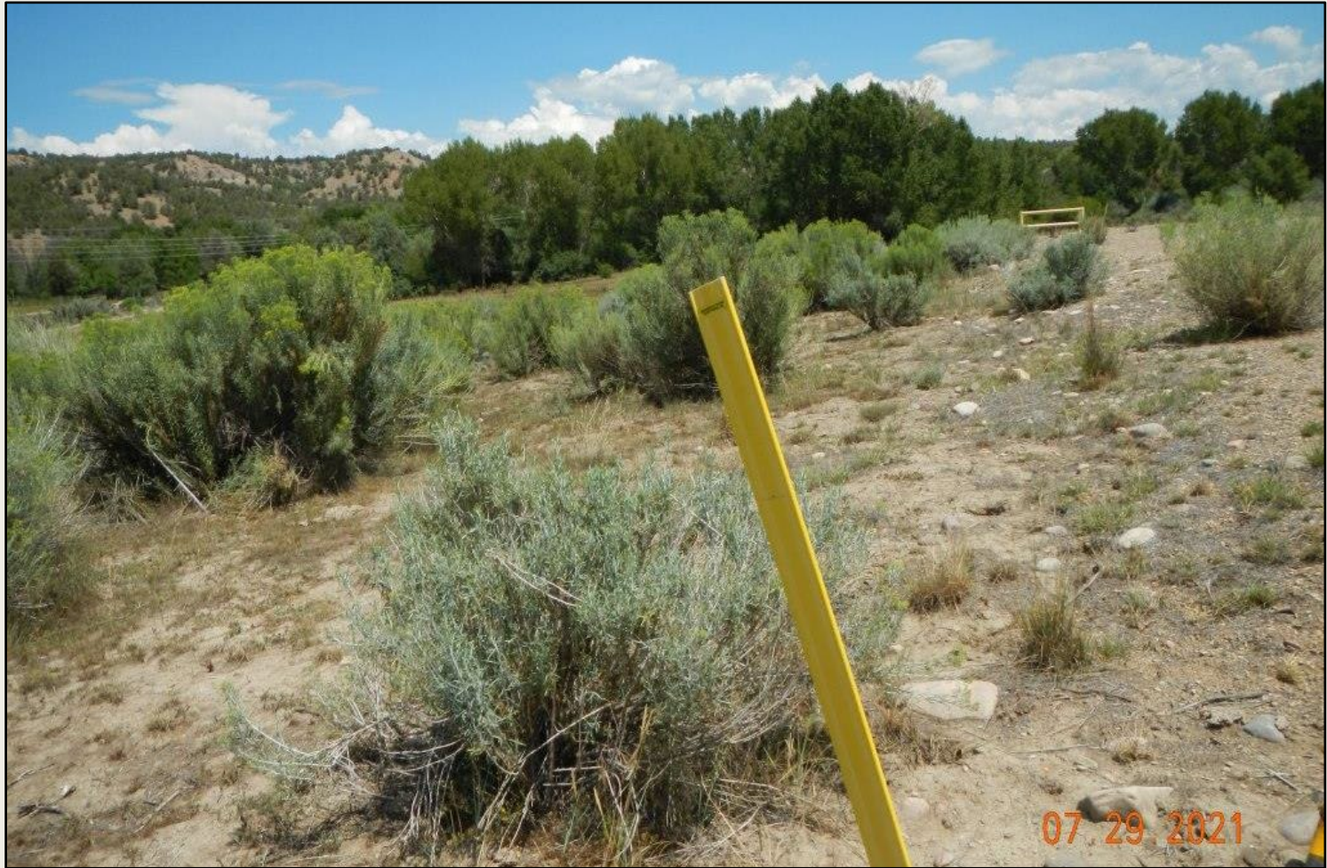
Photo 2. View of the northern project area from the northwestern corner facing eastward. Revegetation is progressing within the project area with crested wheatgrass, western wheatgrass, and rubber rabbitbrush.