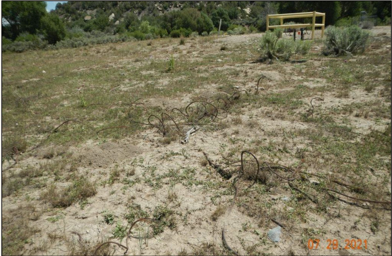
Photo 4. View of cable debris observed within the northern project area.