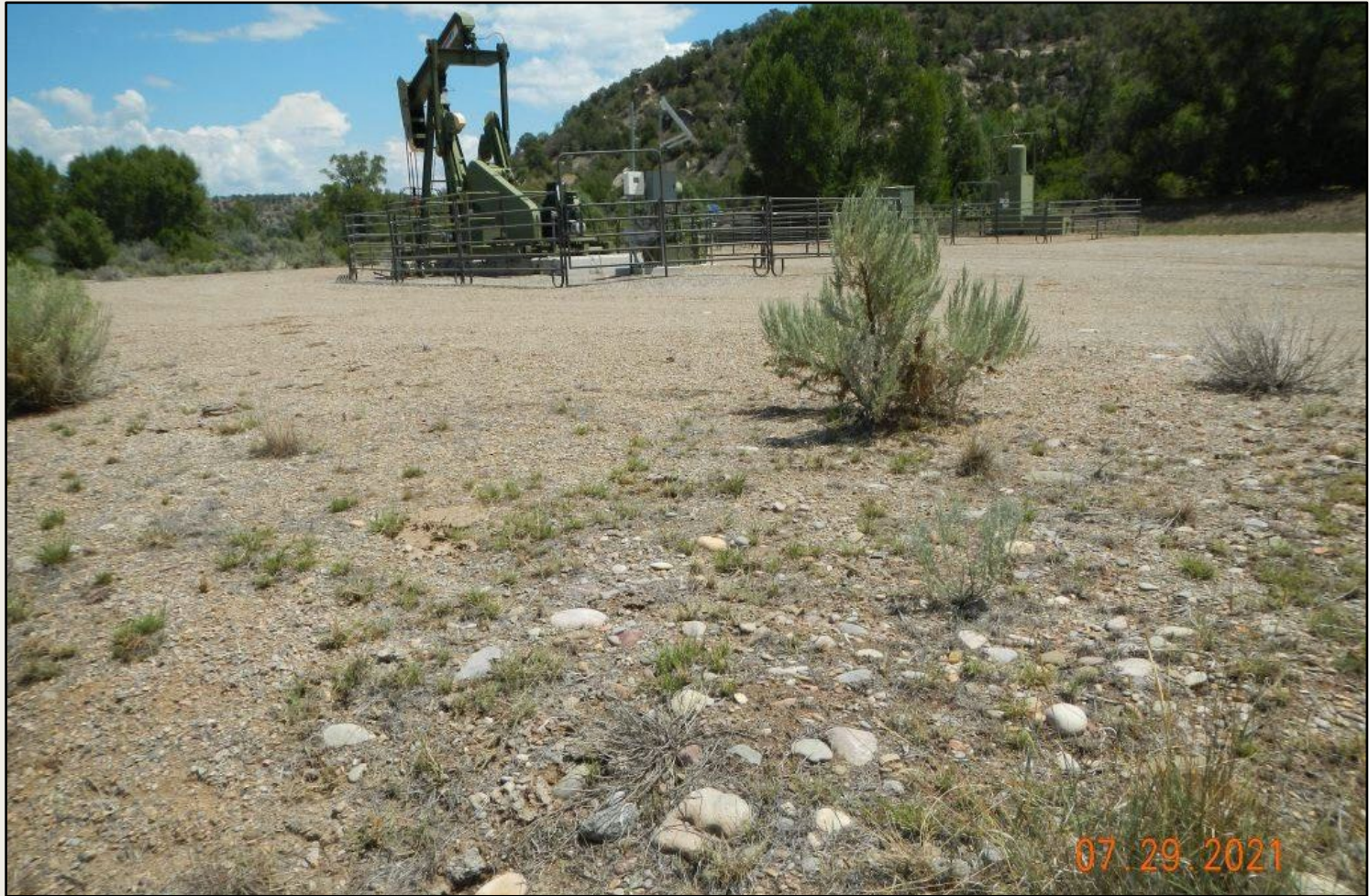
Photo 1. View of the project area from the well pad entrance facing center.