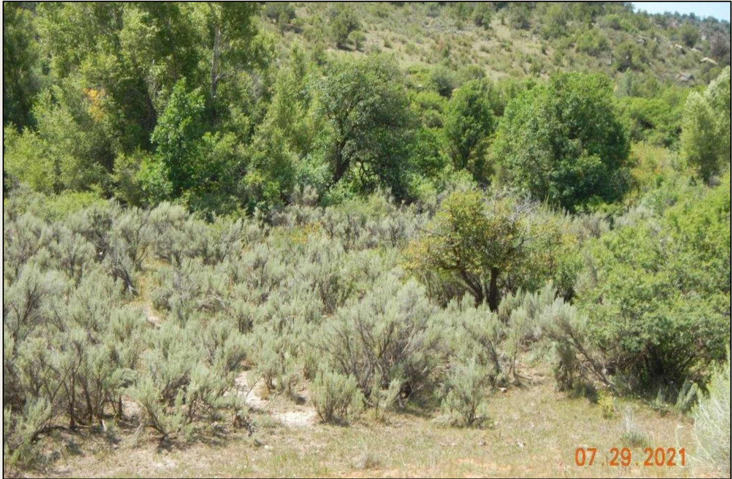
Photo 5. View of the reference area comprised of big sagebrush mosaic with narrow leaf cottonwoods, western wheatgrass, and gambel oaks.