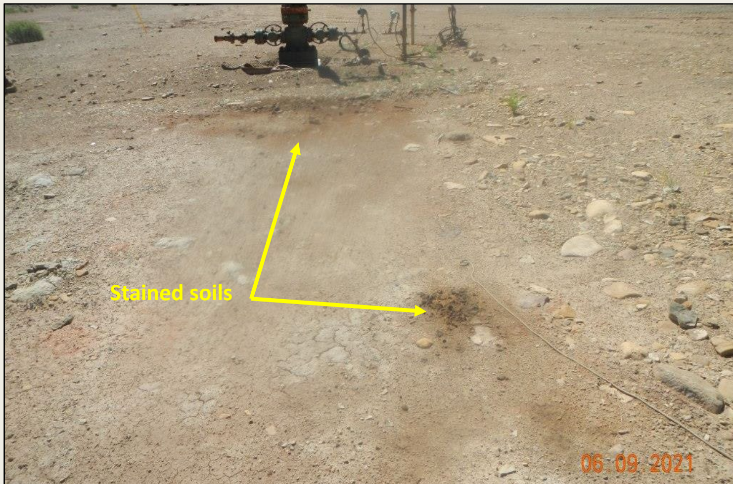
Photo 4. View of stained soils observed around the wellhead.