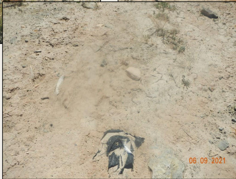
Photos 5-7. View of debris observed within the project area. Scattered debris observed scattered around the project area.