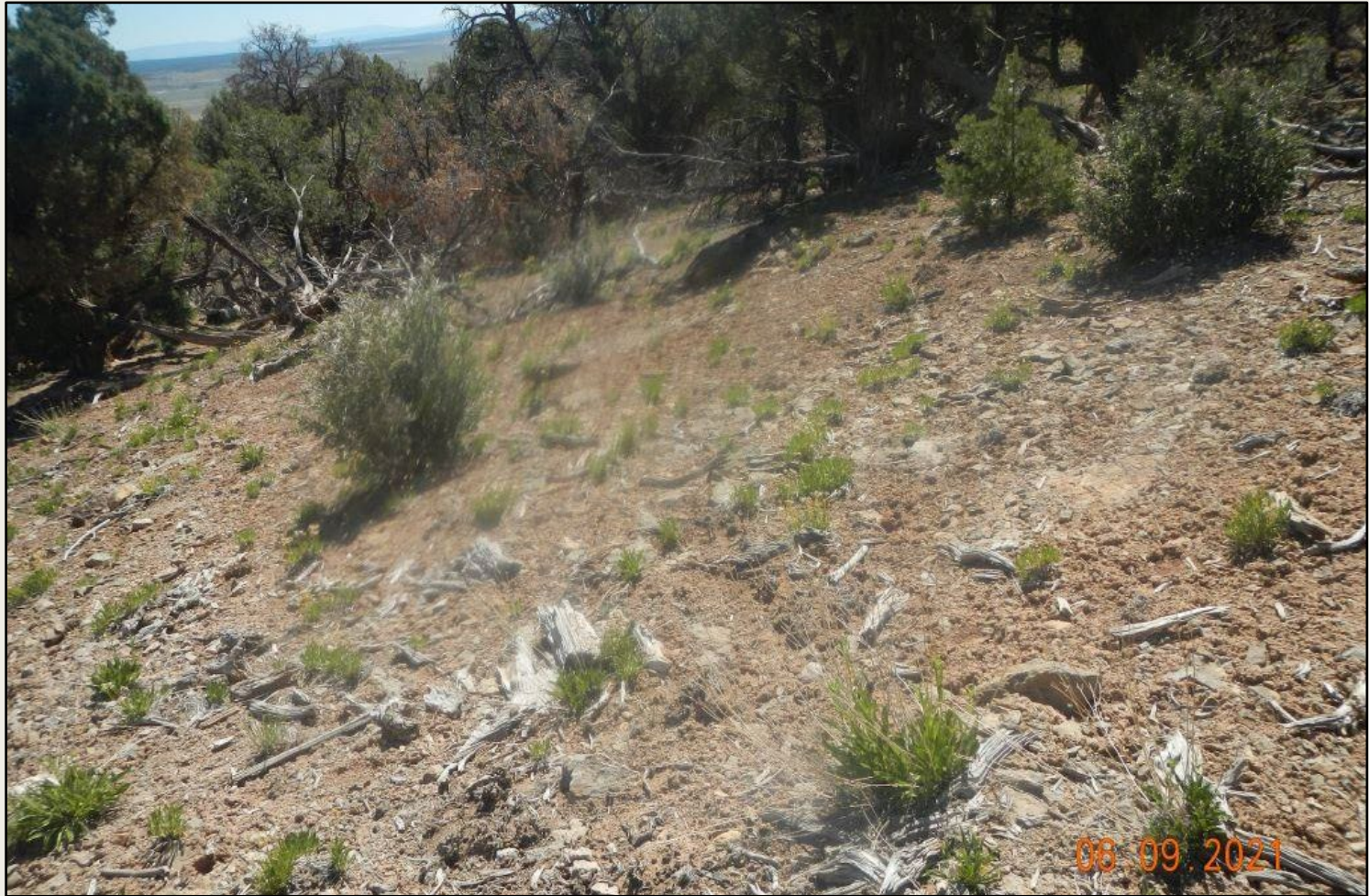
Photo 8. View of reference area comprised of pinyon and juniper woodland with an understory of mountain mahogany, Tetrandeum sp., ephedra, yucca, and Indian ricegrass.