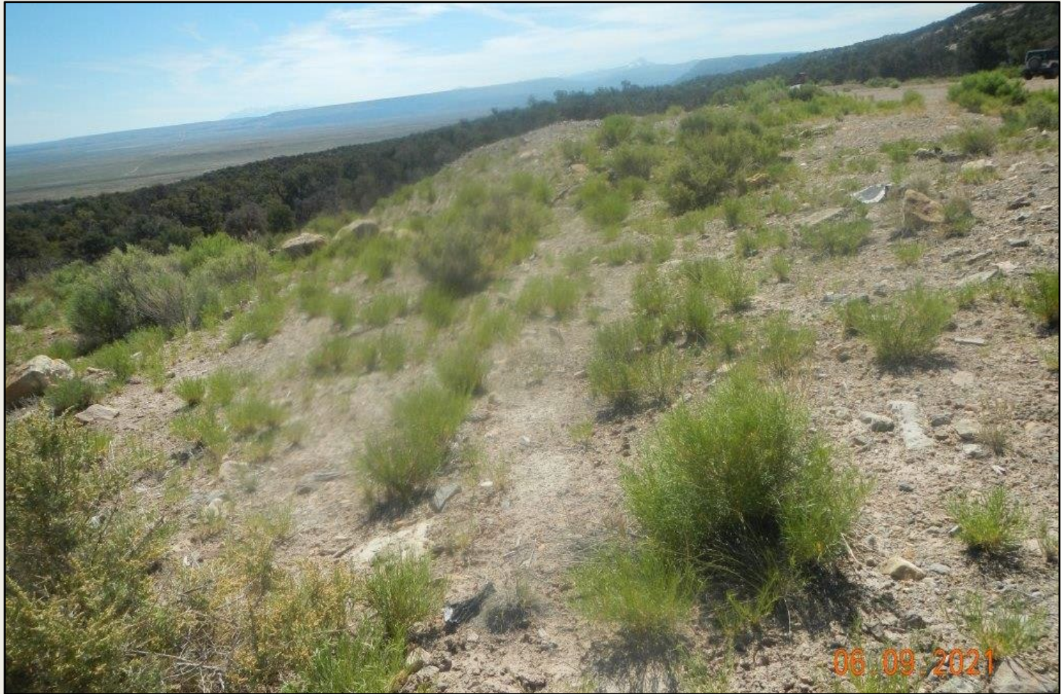
Photo 2. View of the northern project area from the northwestern corner facing eastward. Revegetation is progressing with rubber rabbitbrush, fourwing saltbush, squirreltail, and Indian ricegrass.