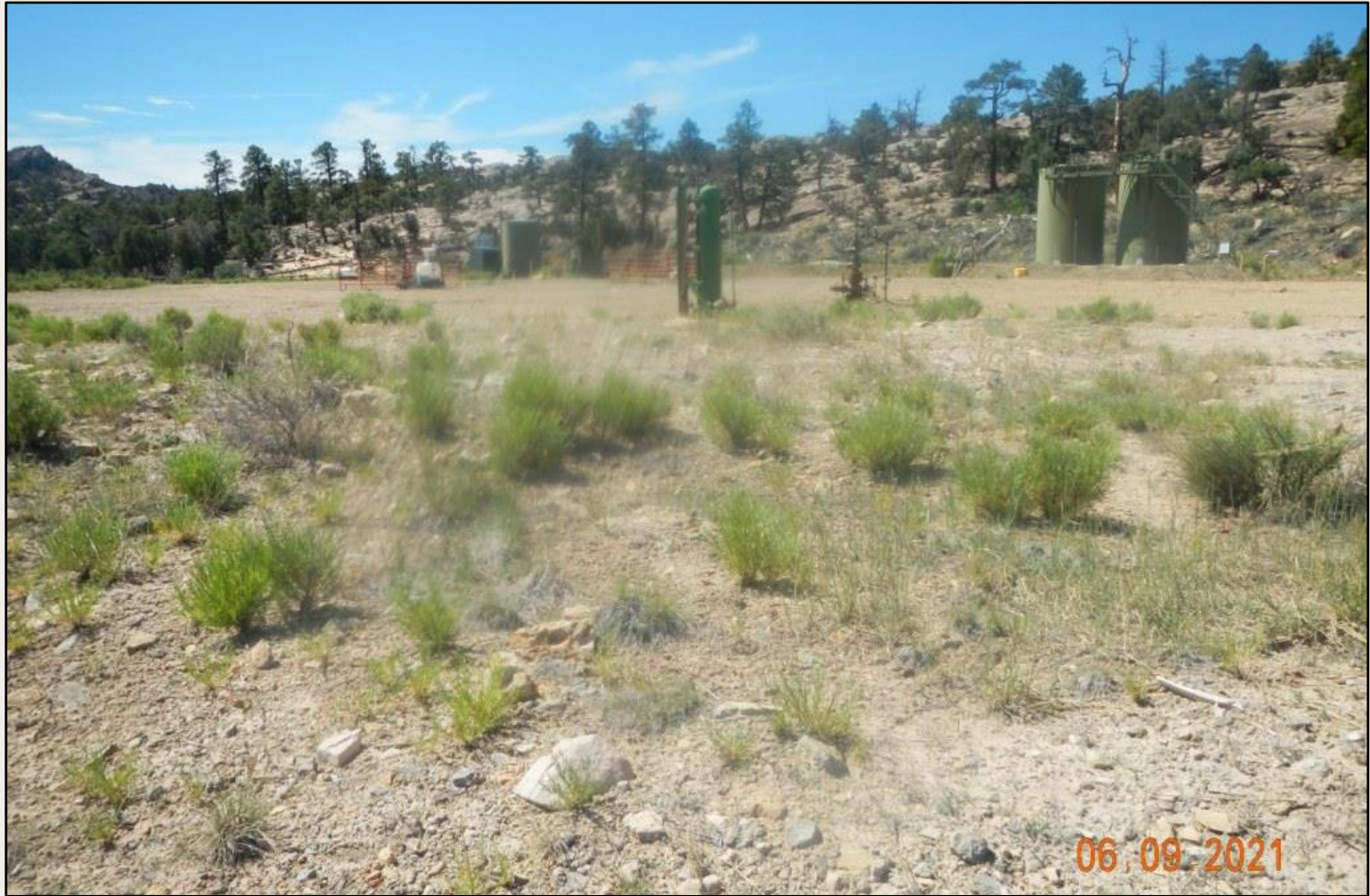
Photo 1. View the project area from the northwestern corner facing center.