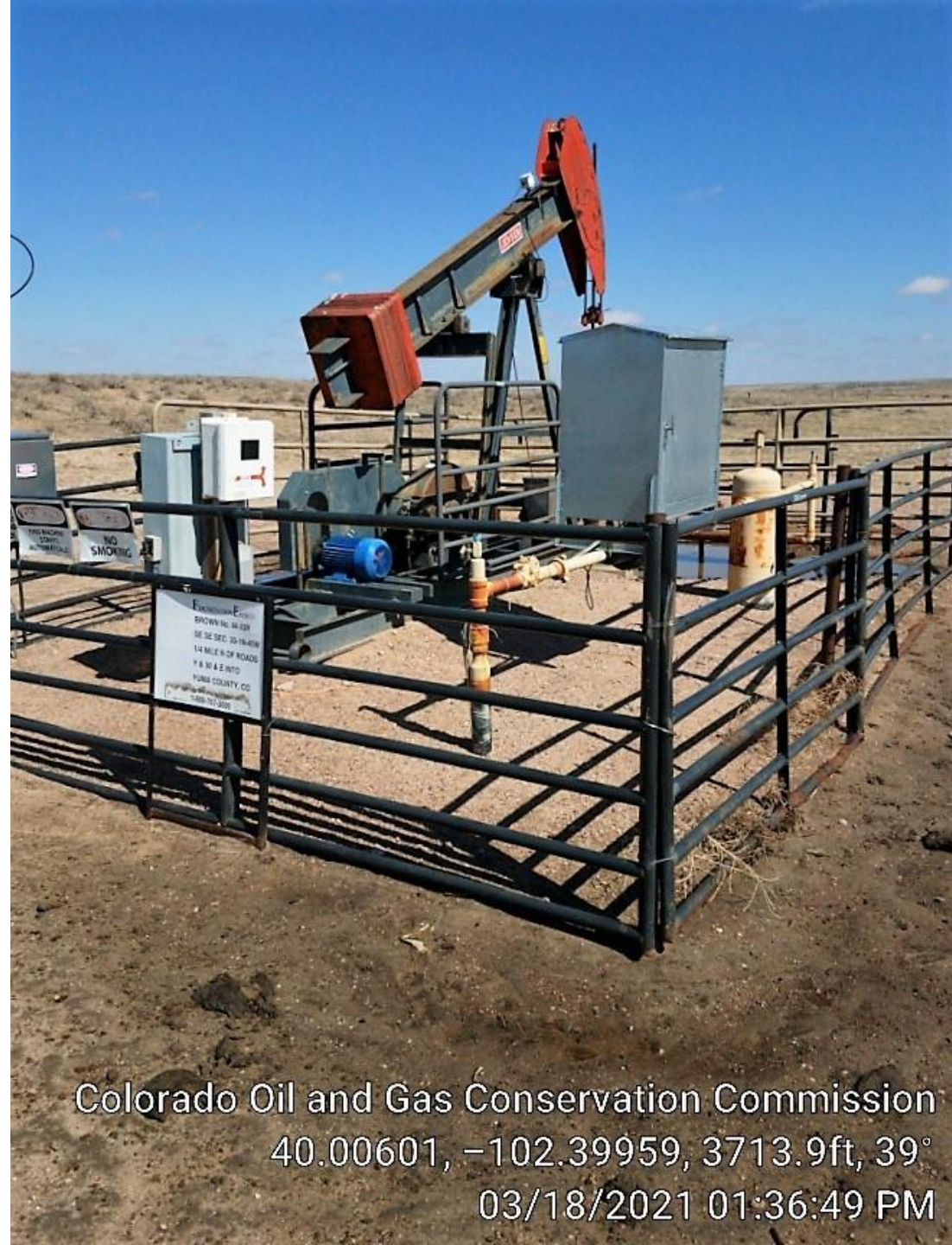
Colorado Oil and Gas Conservation Commission 40.00601, -102.39959, 3713.9ft, 39° 03/18/2021 01:36:49 PM