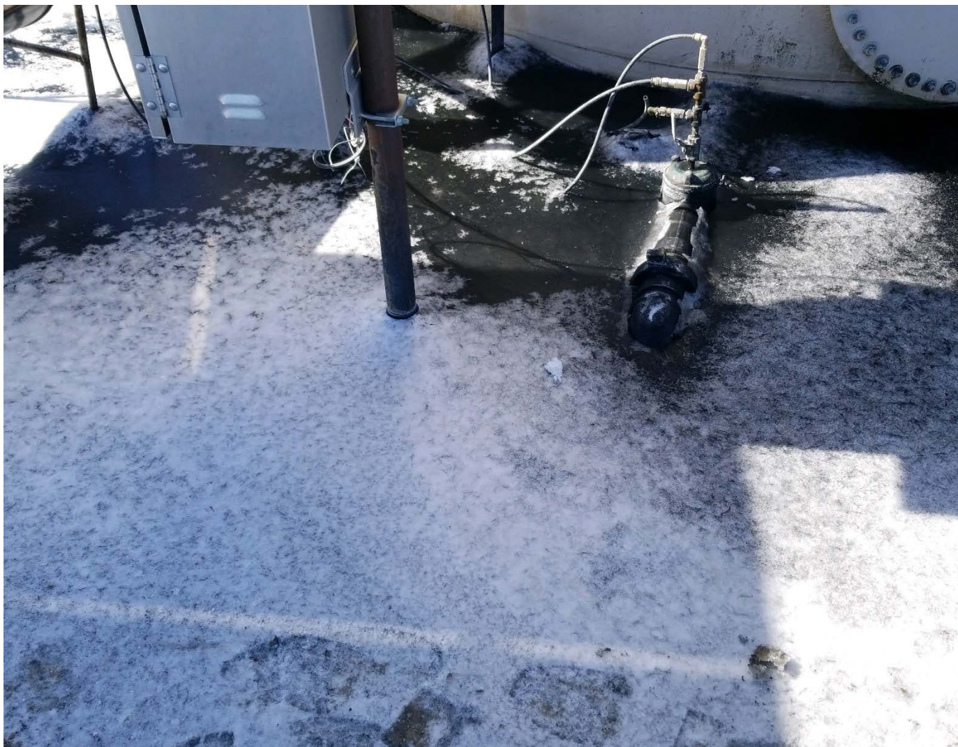
Produced water frozen inside containment.

Location Name: Spill 479428 Location ID/API #: Craig 6-4 SWD