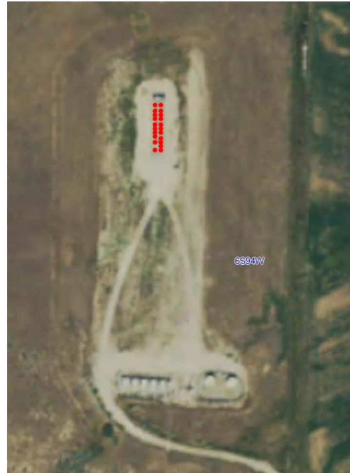
Photo#5: COGCC 2019 aerial; vegetation visible thought to be weed growth, not interim Veg, see 2020 Photos.