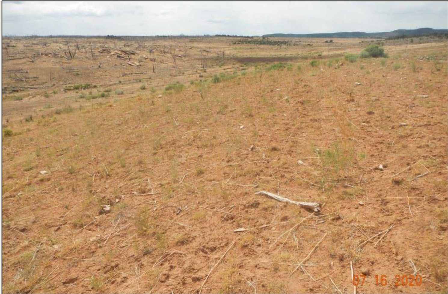
Photo 2. View of the eastern project area from the northeastern corner facing southward. Revegetation is progressing in a grazed condition with grasses and shrubs such as western wheatgrass, Indian ricegrass, and rubber rabbitbrush.