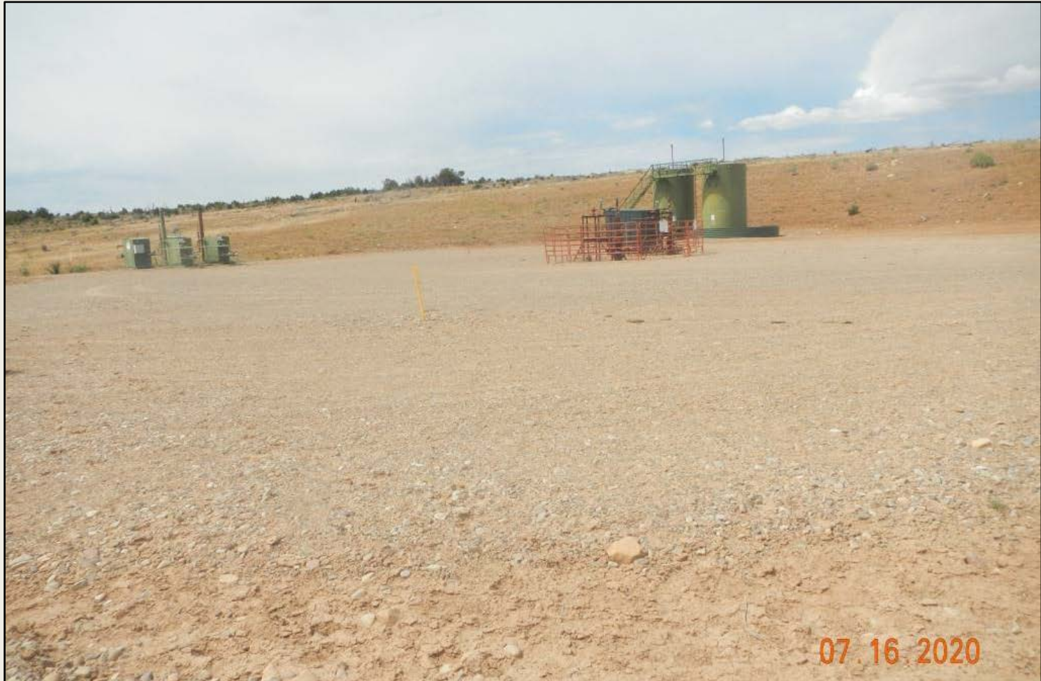
Photo 1. View of the project area from the northeastern corner facing center.