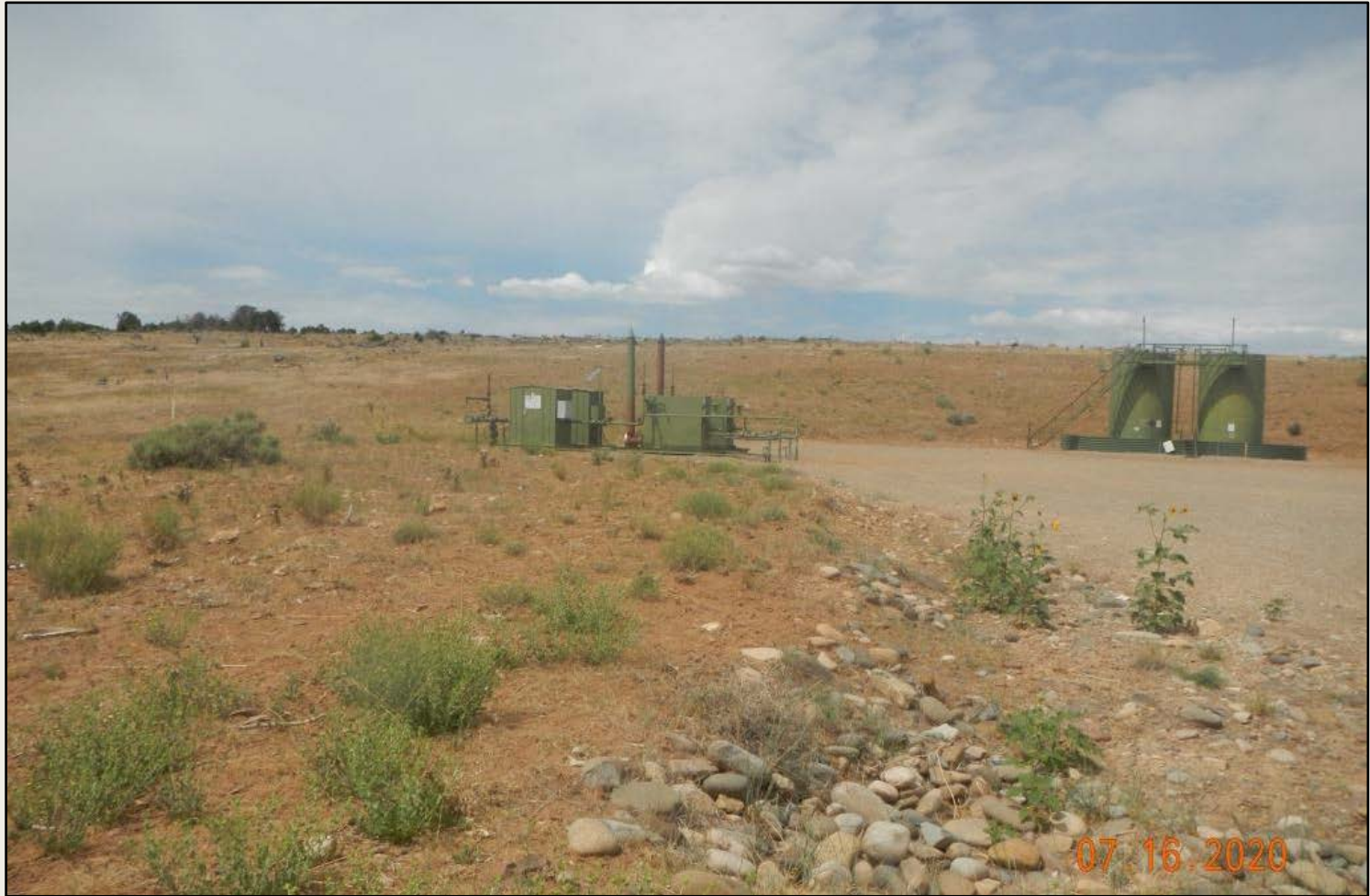
Photo 3. View of the southern project area from the southeastern corner facing westward.