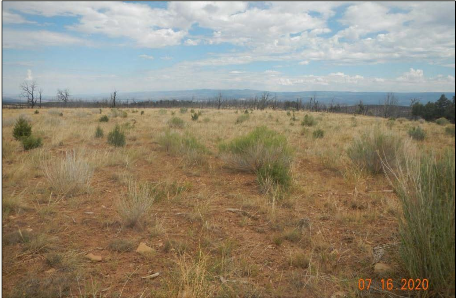
Photo 5. View of reference area comprised of post-burn vegetation community with young pinyon and juniper trees, rubber rabbitbrush, sand dropseed, and western wheatgrass.