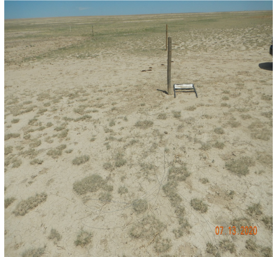
Photo 3. The electric fence around the location is in disrepair.