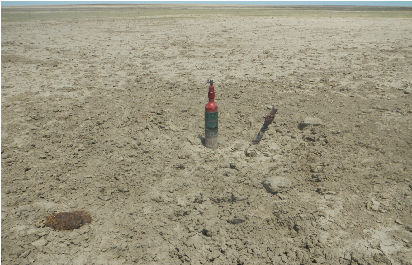
Photo 6. The well remains at center of the location and is currently TA.