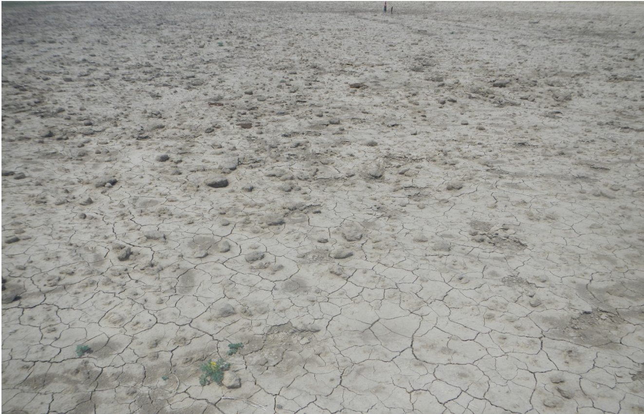
Photo 5. The soils are bare of vegetation and will need to be reseeded.