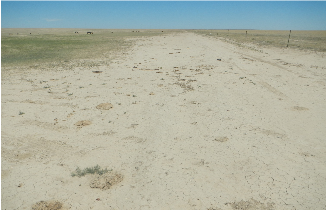
Photo 1. Facing north at the beginning of the access road.