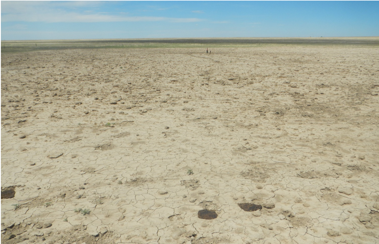
Photo 4. Facing north toward the location. The soils are bare of vegetation and will need to be reseeded.