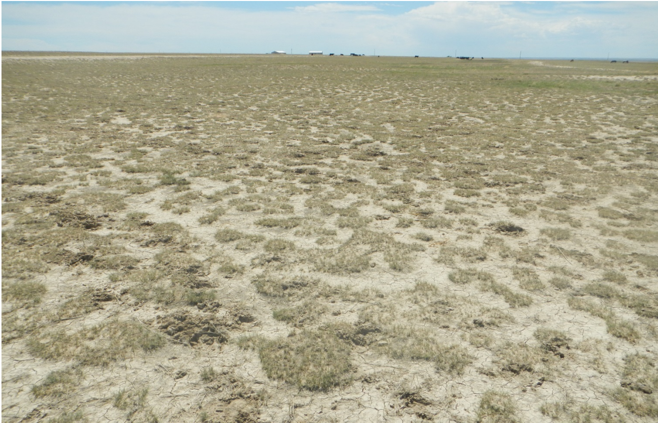
Photo 8. Facing west toward the surrounding pasture.