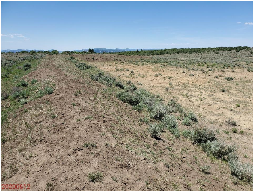
Photo 1: Photo taken from the southeast end of the Location, facing southwest. Photos 1-4 provide an overview of the Location from southwest, west, north and northeast. All wells on the location have either been drilled, abandoned, or permits expired. Interim reclamation of the Location due.