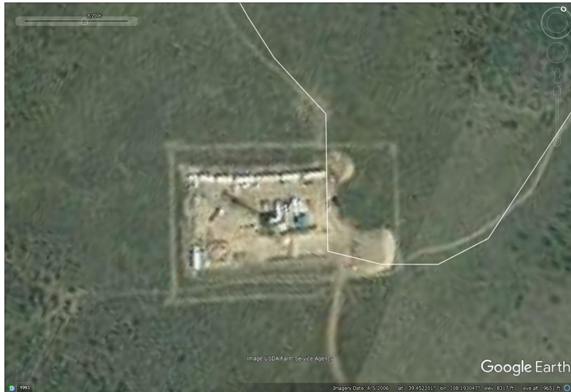
Photo 6: 8/2006 Google Earth aerial image. Photo shows Location during what appears drilling operations. Records show well 045-12399 SPUD 7/2006