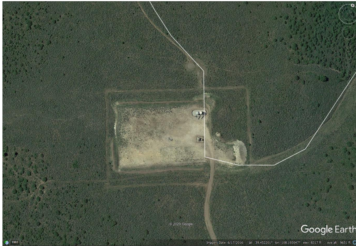
Photo 7: Most current Google Earth aerial image (2016) of the Location. It was observed that the Location's disturbance remains unchanged. Pad disturbance, including soil stockpiles/berms measures 3.22 acres,