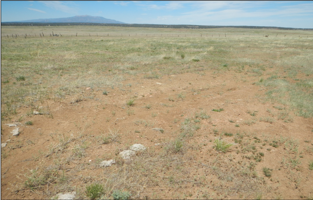
Photo 3. Facing north toward the location. This area is bare of vegetation and needs to be seeded.