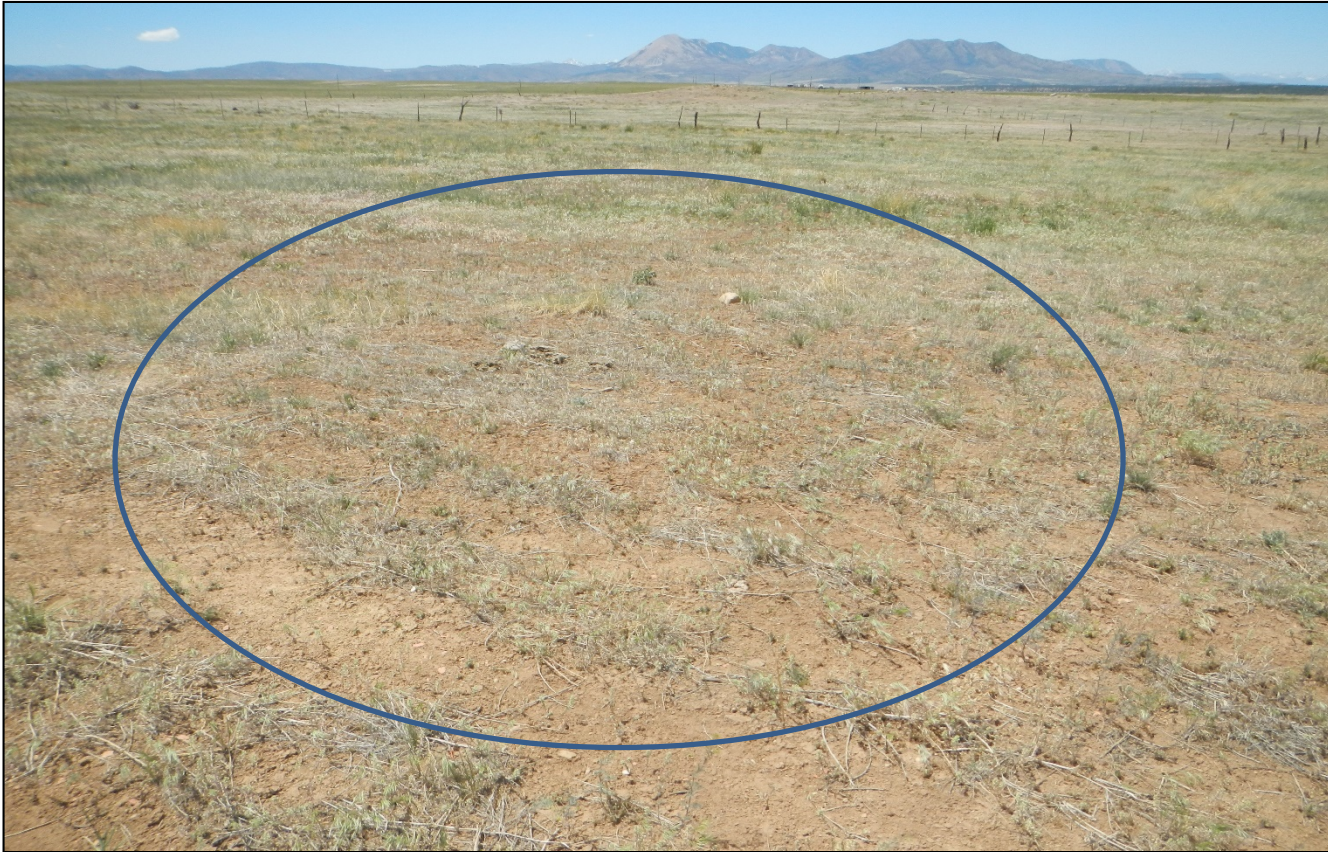
Photo 4. Facing northwest toward the location. This area circled is mostly undesirable weeds, Cheat grass.