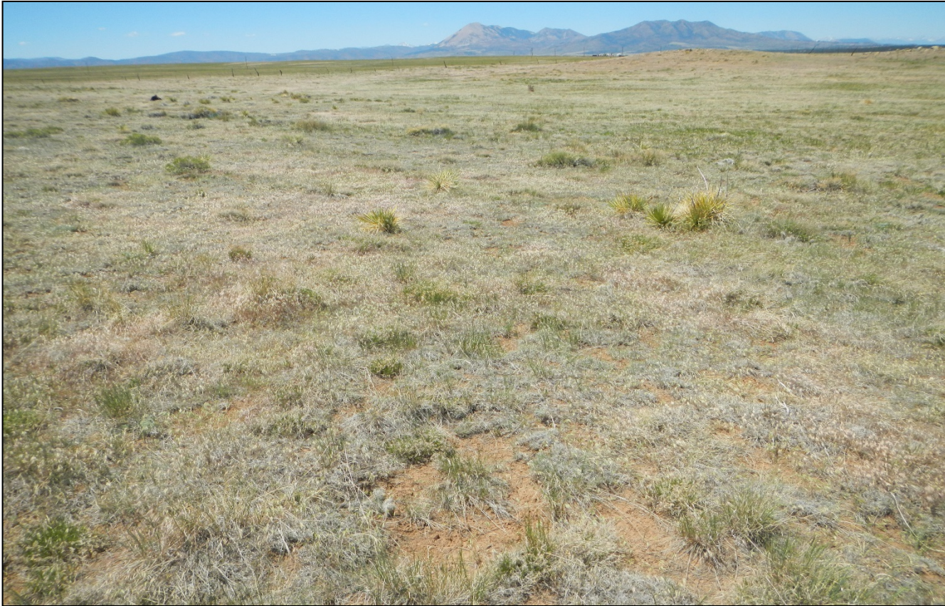
Photo 7. Facing northwest toward the surrounding undisturbed reference area.