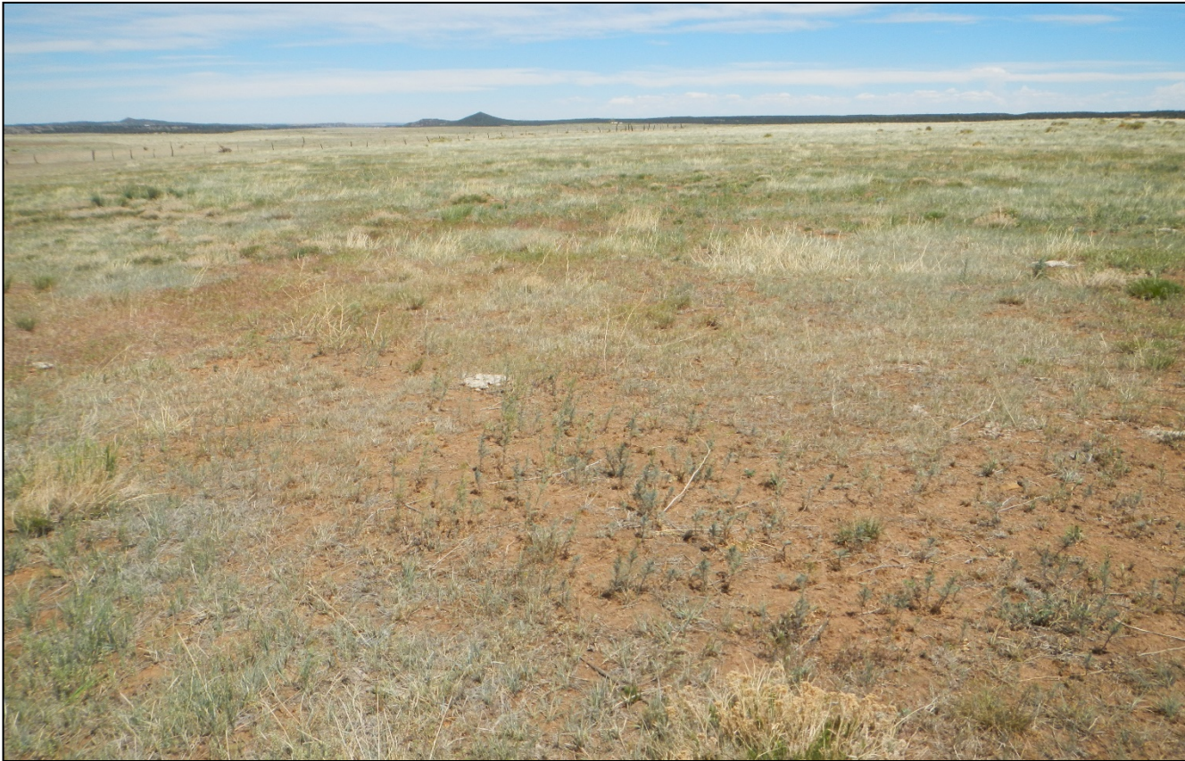
Photo 6. Facing east toward the location.