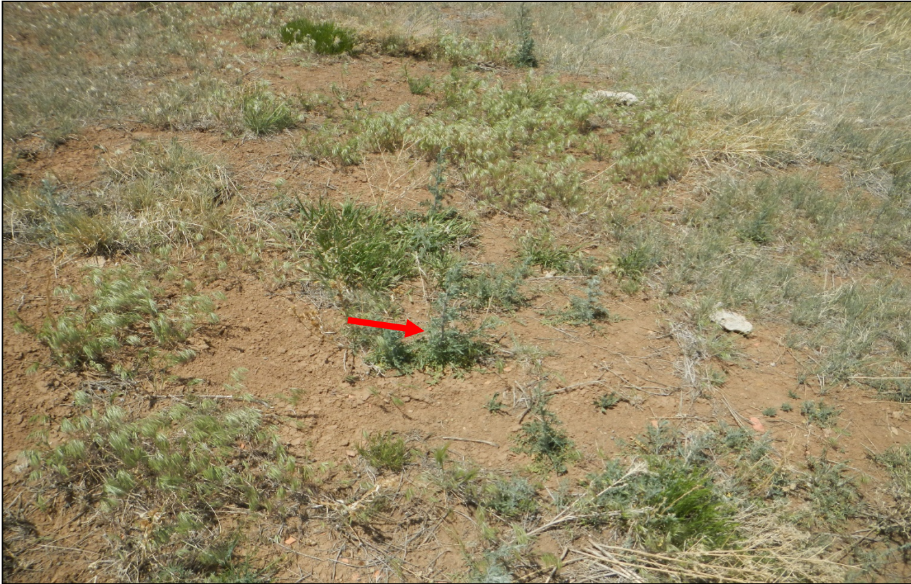
Photo 6. There were a few noxious weeds observed at the southwest side of the location. Arrow point to Diffuse knapweed.