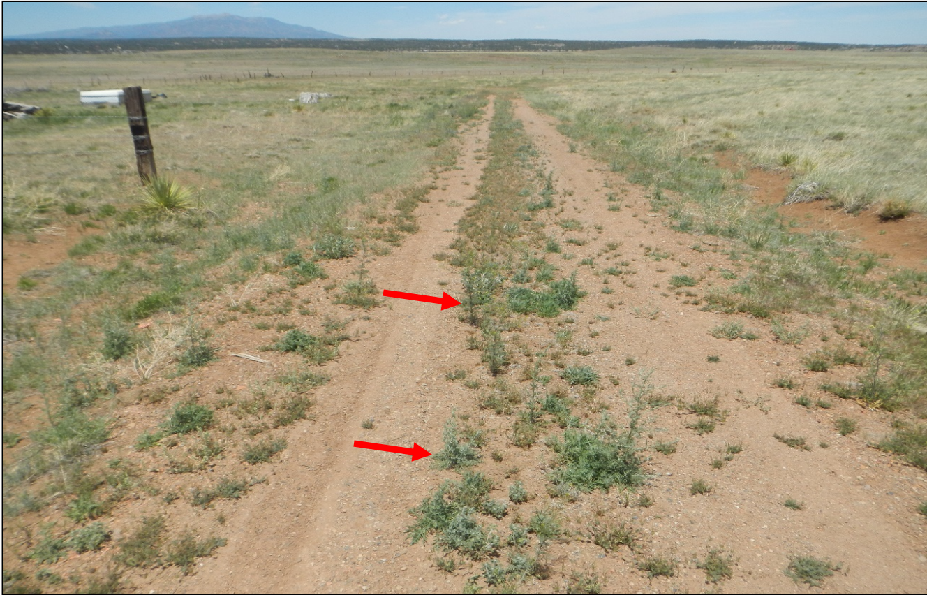
Photo 2. Facing north along the access road which remains per approved variance. There are noxious weeds along the road that need to be controlled. Arrows point to Diffuse knapweed.