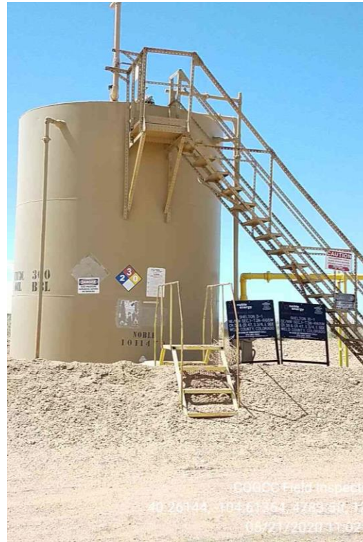
Photo 2 Battery