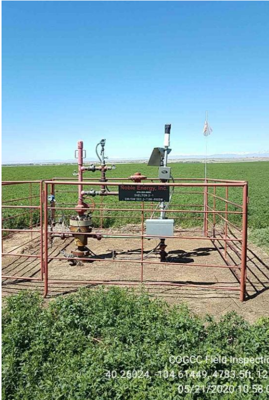
Photo 1 05-123-22559 SHELTON 3-1

Location ID, Name: 332900 UPRR 39 PAN AM /E/-63N65W 1NENW