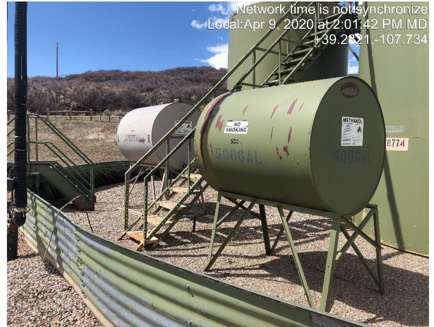
Photo #0942 Both 500 gallon methanol tanks missing operator name and contact number.