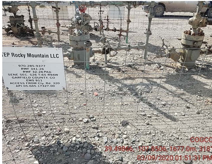
Well where staining is in next photo