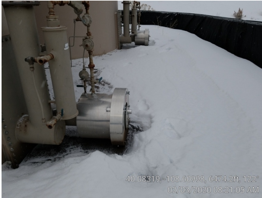
Photo 12. Back of tanks on 2-3-2020.

Fletcher Gulch 3-31 API: 05-103-10888 Inspection: 679707195