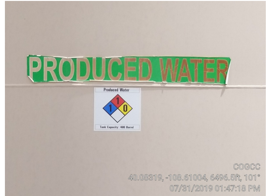
Photo 15. Tank label on 7-31-2019.