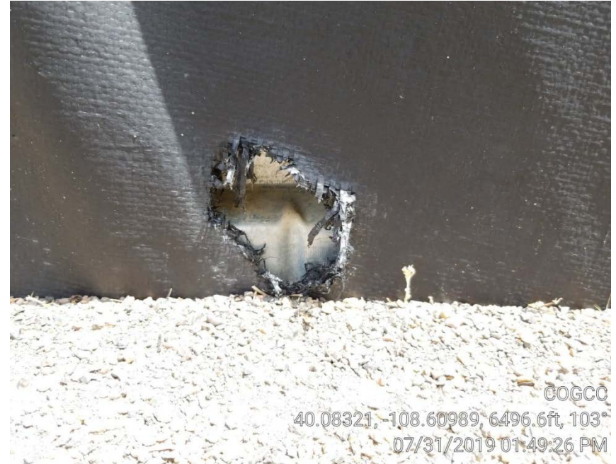
Photo 11. Tank secondary containment liner on 7-31-2019.