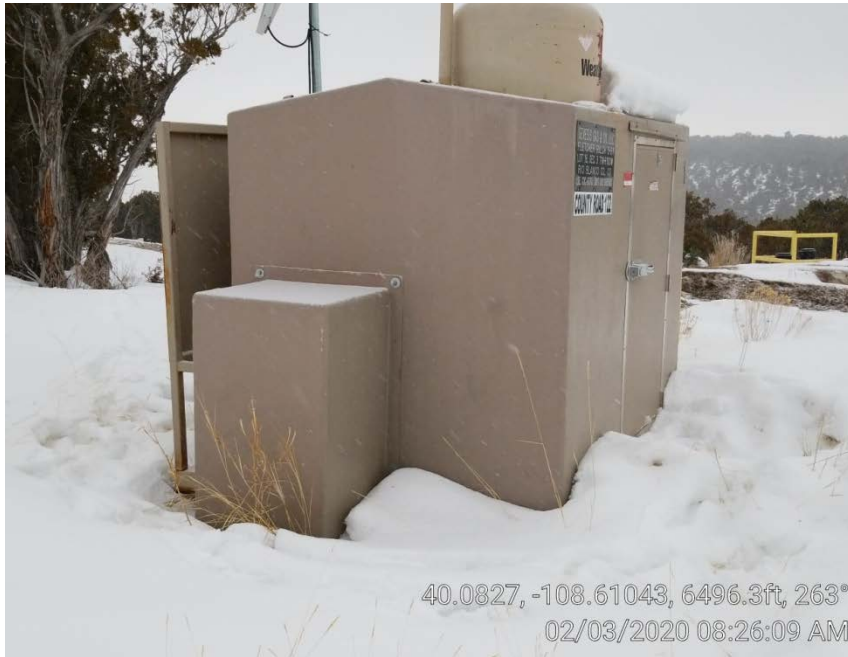
Photo 5. Vegetation next to meter building on 2-3-2020.

Fletcher Gulch 3-31 API: 05-103-10888 Inspection: 679707195