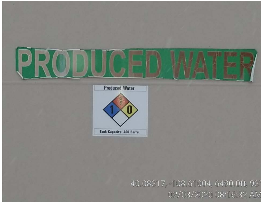
Photo 14. Tank label on 2-3-2020.

Fletcher Gulch 3-31 API: 05-103-10888 Inspection: 679707195