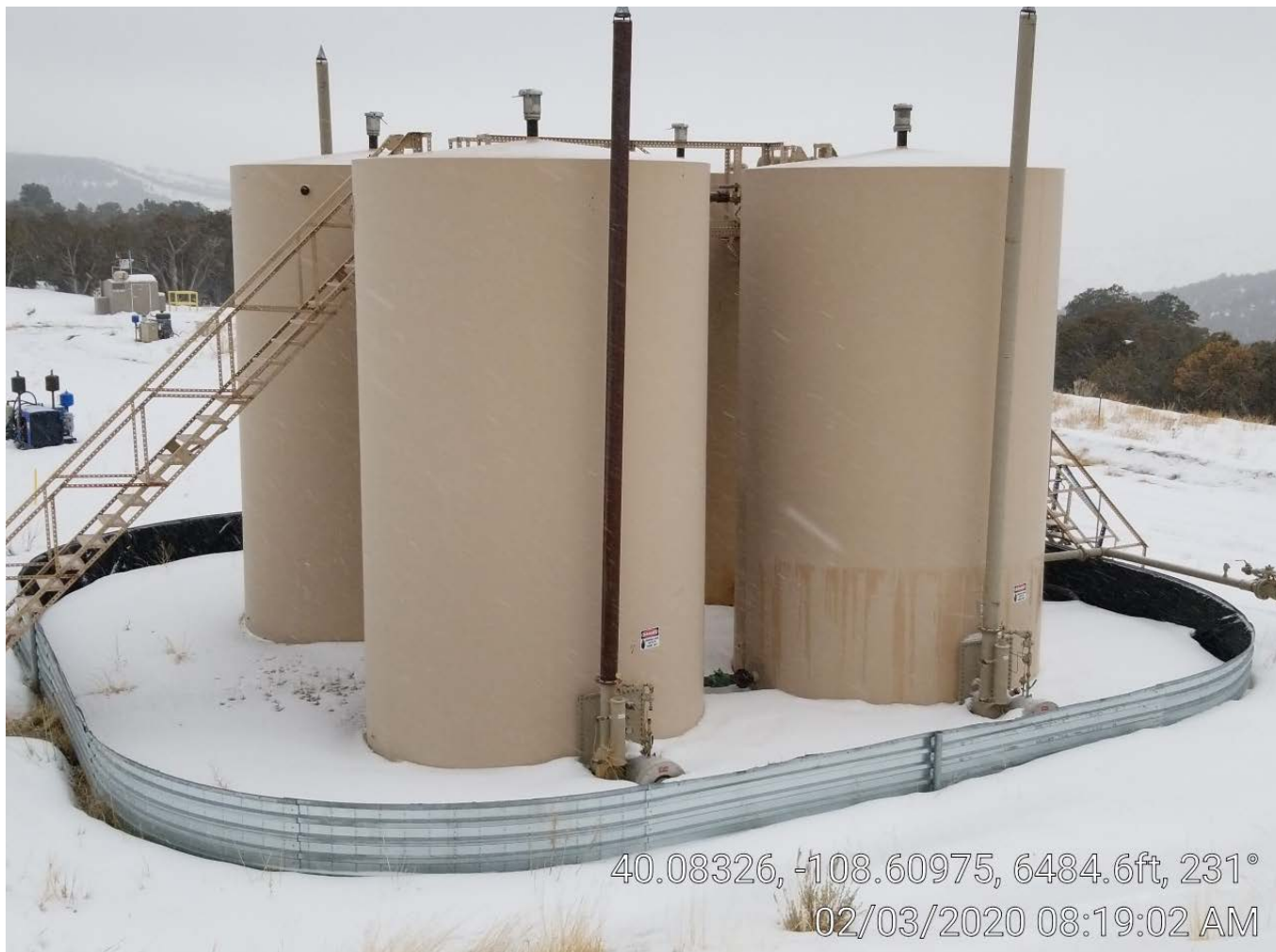
Photo 2. Tank battery.

Fletcher Gulch 3-31 API: 05-103-10888 Inspection: 679707195