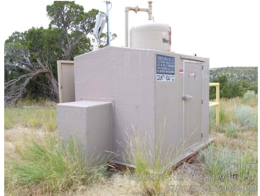
Photo 6. Vegetation next to meter building on 7-31-2019.