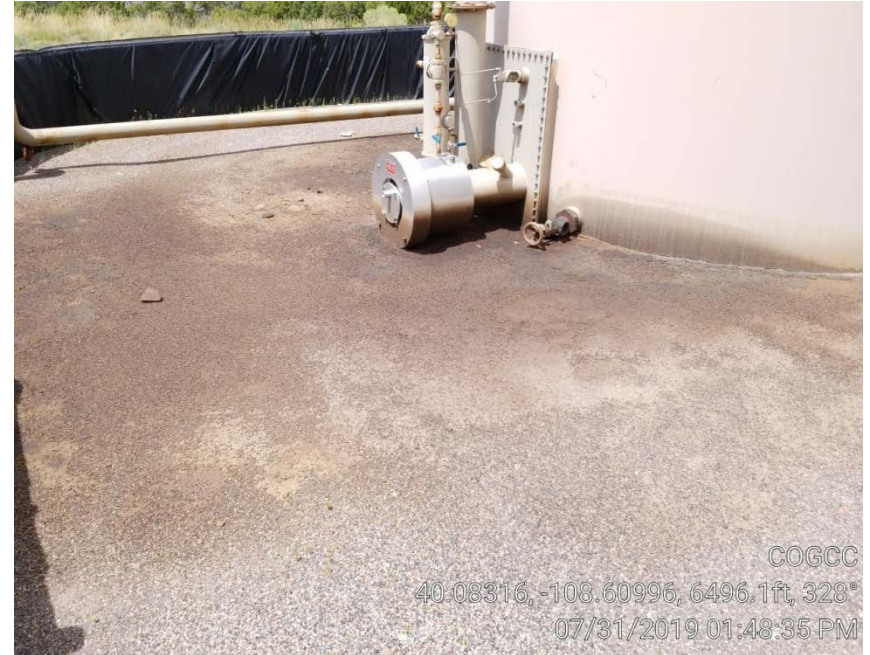
Photo 13. Stained gravel on 7-31-2019.