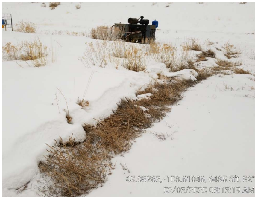
Photo 7. Weed debris.

Fletcher Gulch 3-31 API: 05-103-10888 Inspection: 679707195