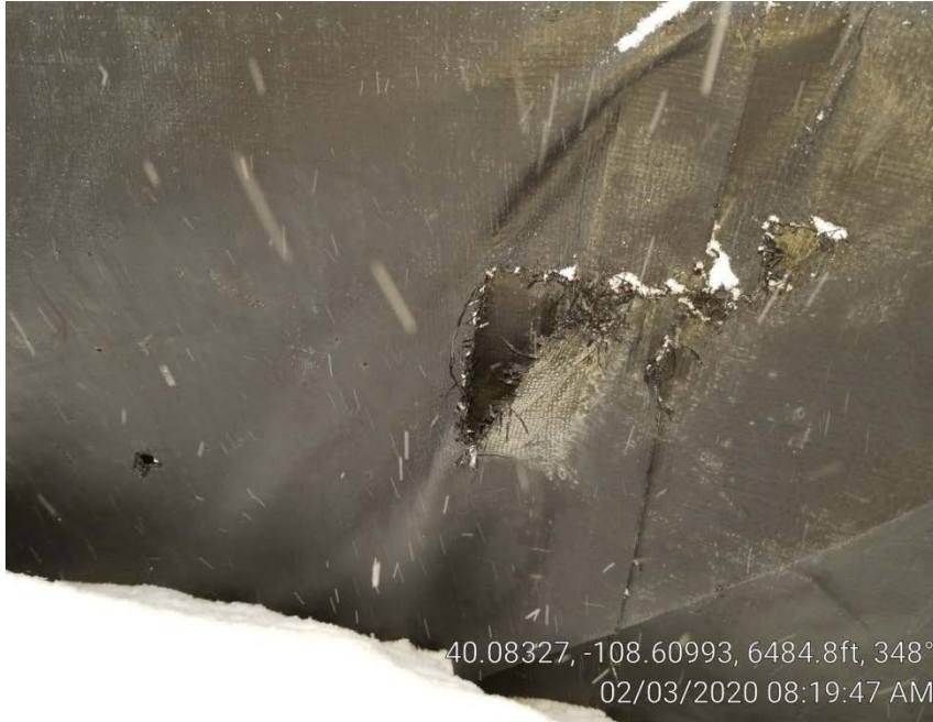
Photo 10. Tank secondary containment liner on 2-3-2020.

Fletcher Gulch 3-31 API: 05-103-10888 Inspection: 679707195