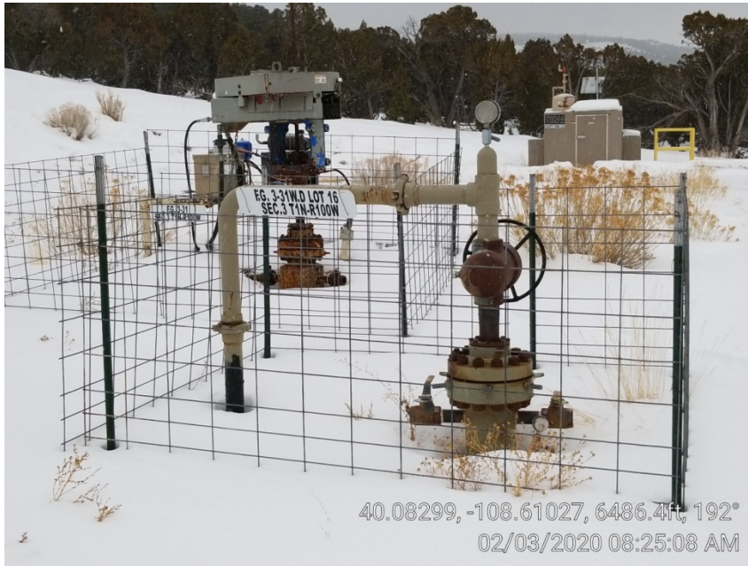
Photo 3. Vegetation next well heads on 2-3-2020.