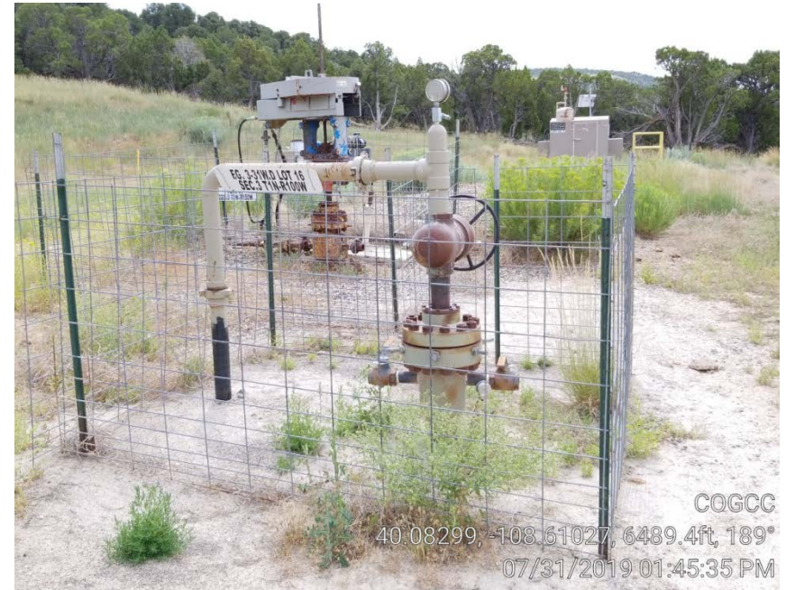
Photo 4. Vegetation next to well heads on 7-31-2019.