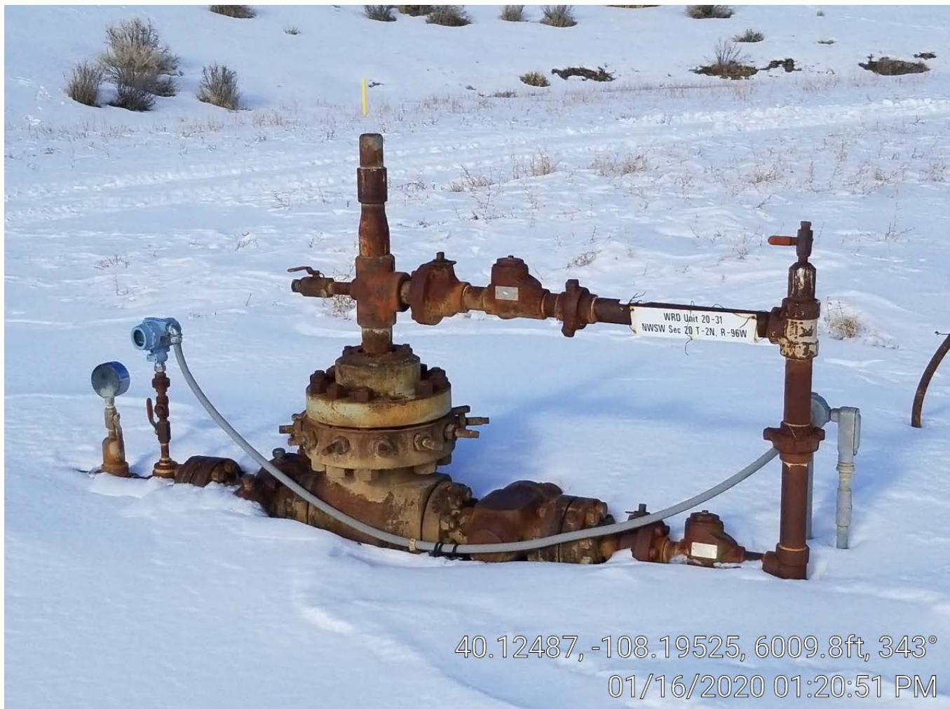
Photo 2. Well head.

WRD Unit 20-31 API: 05-103-09924 Inspection: 679707005