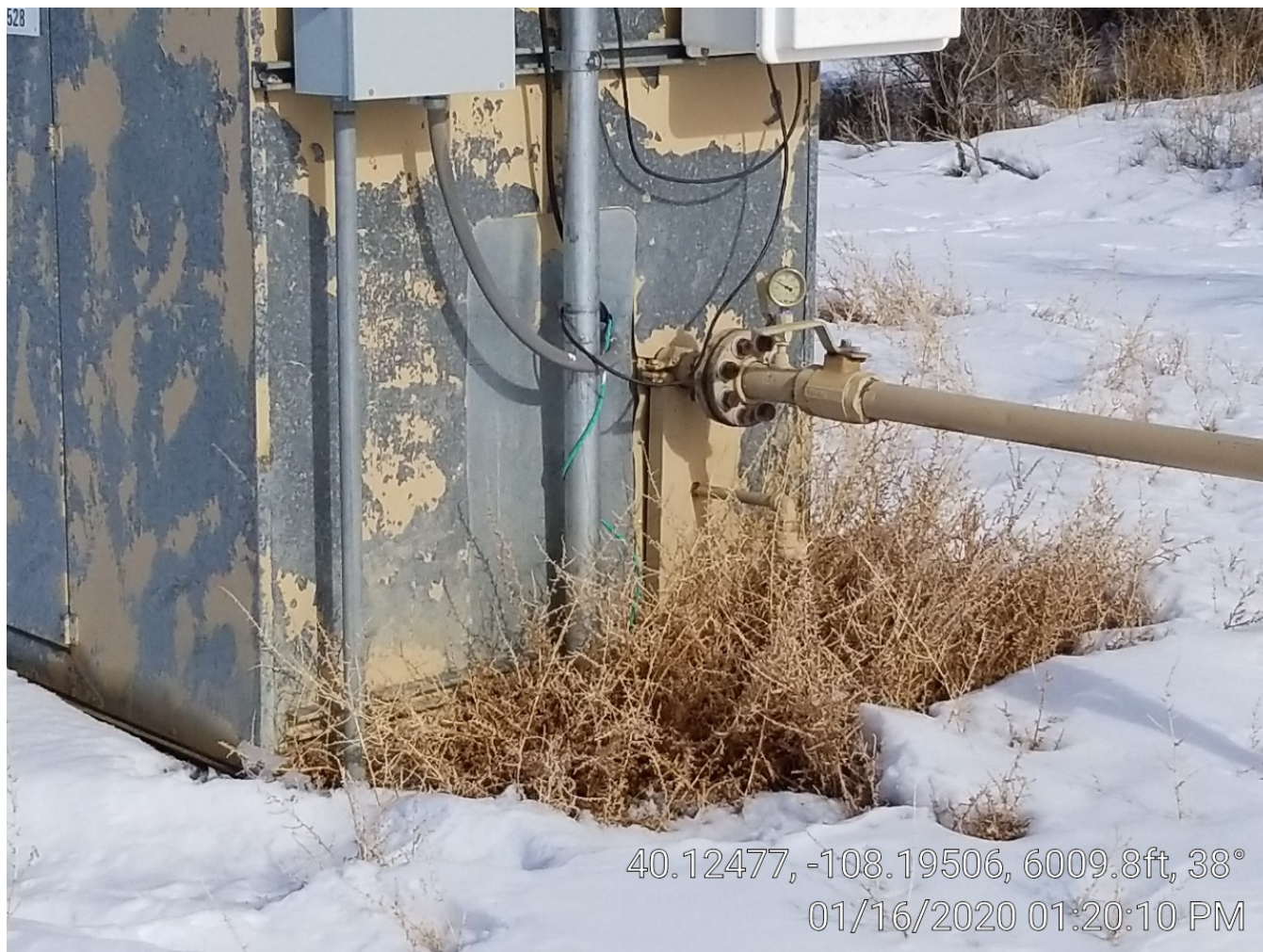
Photo 5. Meter building.

WRD Unit 20-31 API: 05-103-09924 Inspection: 679707005