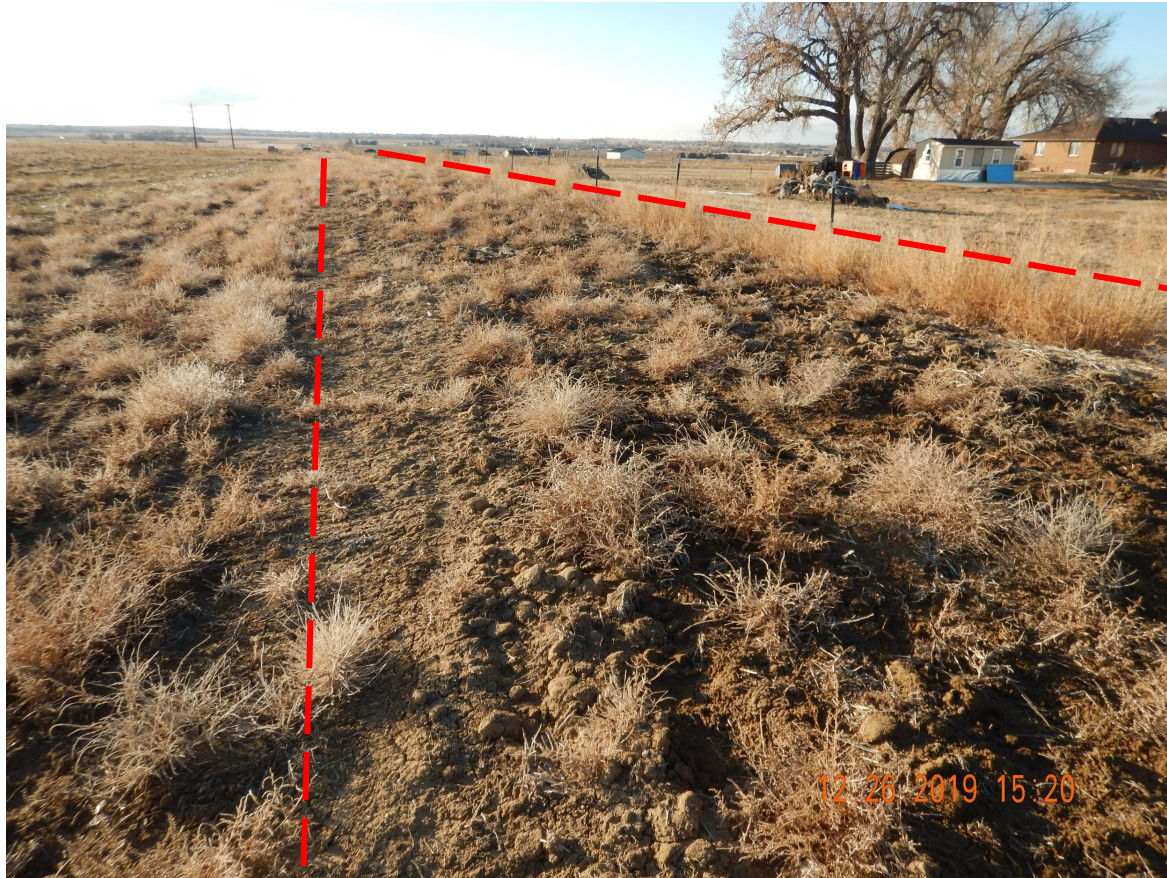
Photo 2. Photo taken from a portion of the access road just west of the tank battery, facing West. Photo illustrates Operator has failed to properly contour all of the access road west of the tank battery- refer to Photo 1.