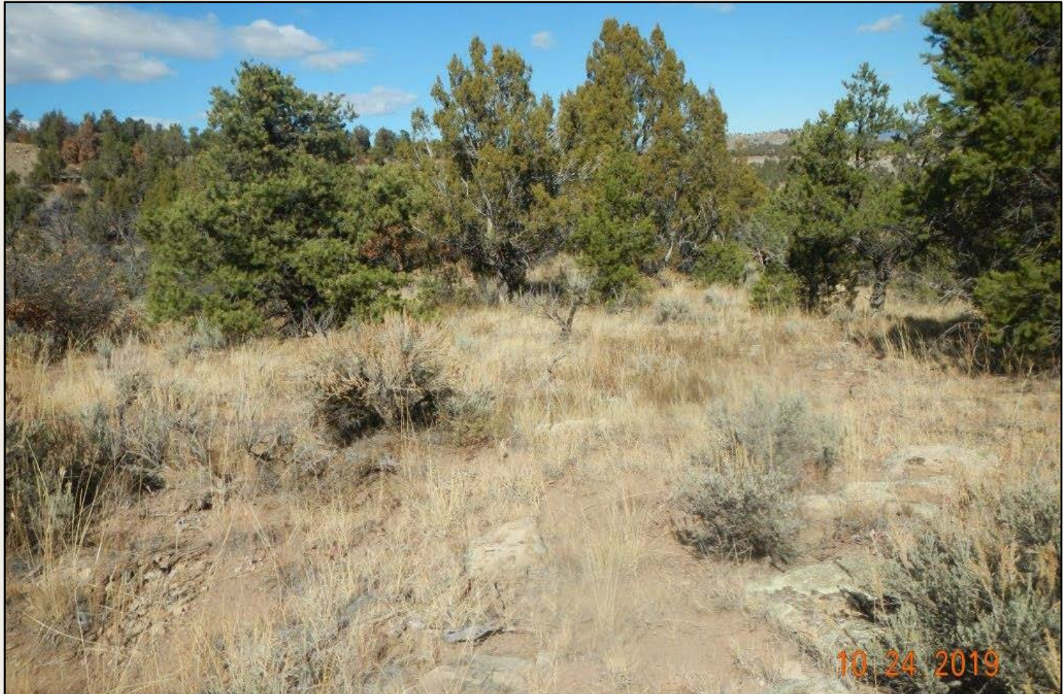
Photo 6. View of reference are vegetation comprised of mixed pinyon juniper woodland, and sagebrush shrubland with native grasses such as James galleta and forbs such as Tetrandeum sp.