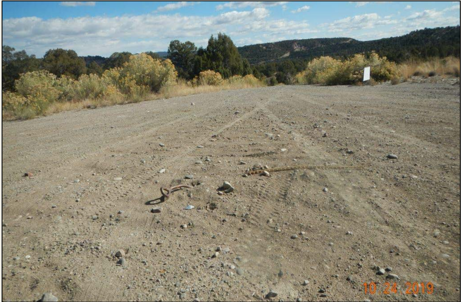
Photo 5. View of unmarked rig anchor at the well pad entrance.