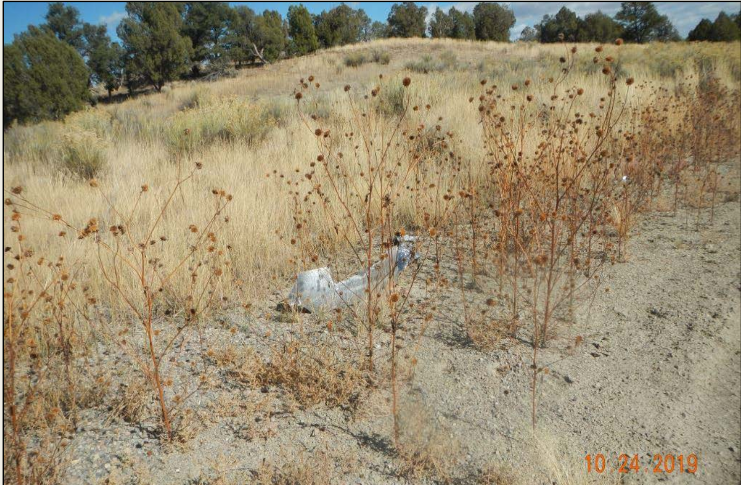
Photo 3. View of trash/debris blown to the edge of the northern working area.