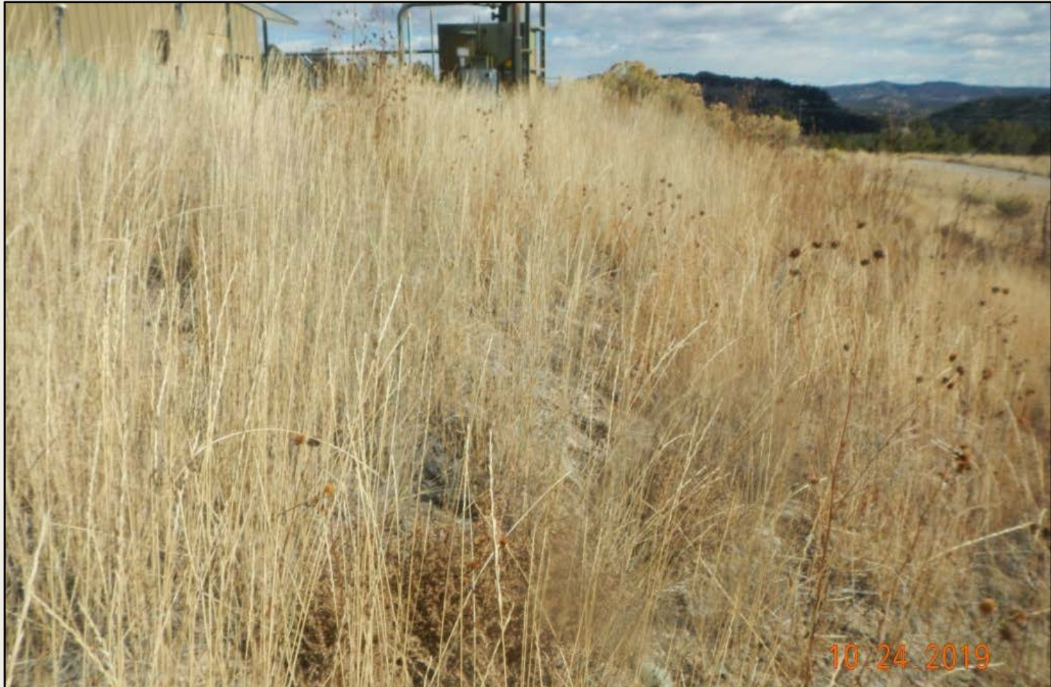
Photo 1. View of the southern project area from the southwestern edge facing eastward.