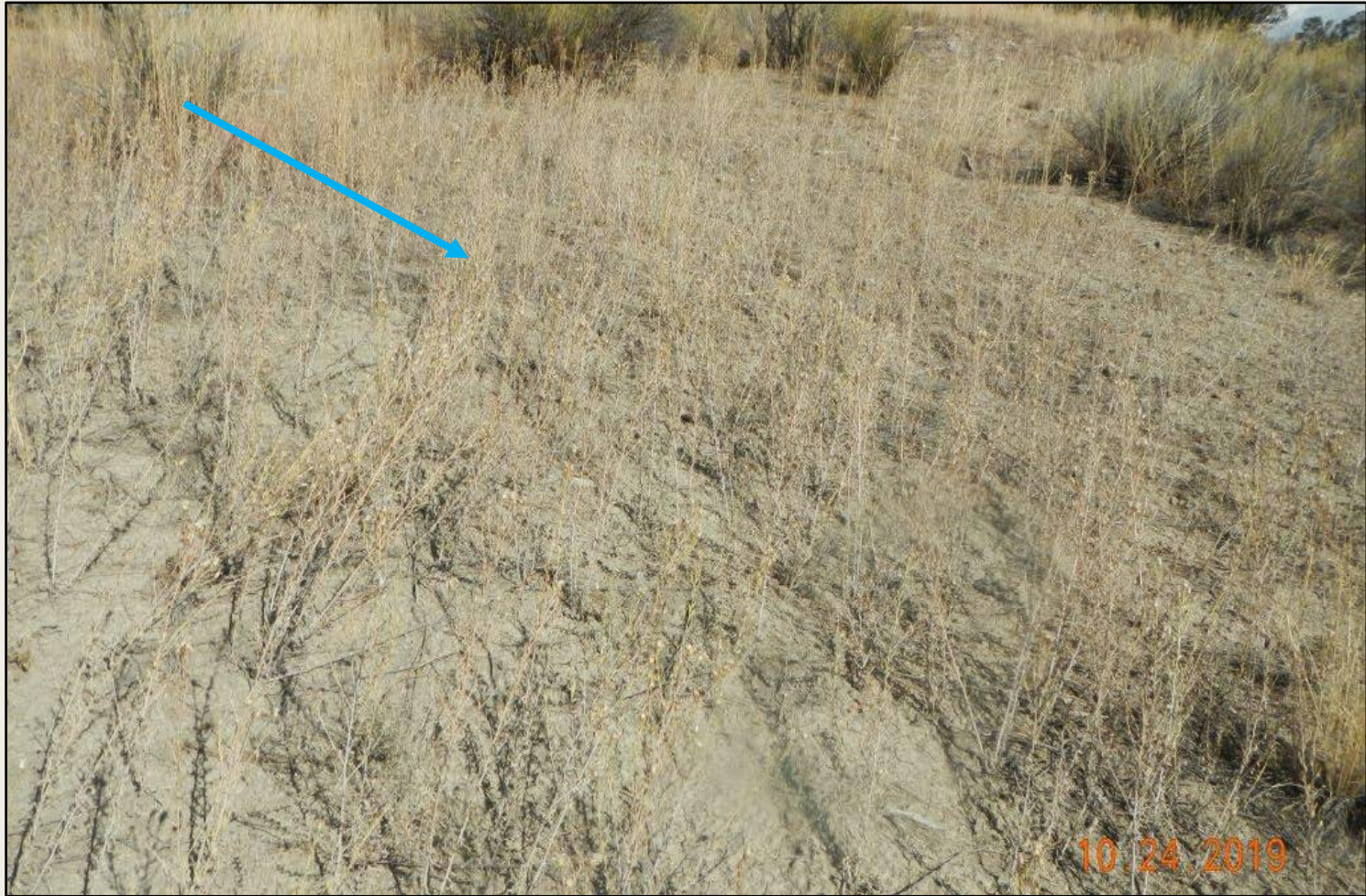
Photo 4. View of Russian knapweed infestation within the northern cut-slope. Areas with knapweed will require revegetation and stabilization after treatment.