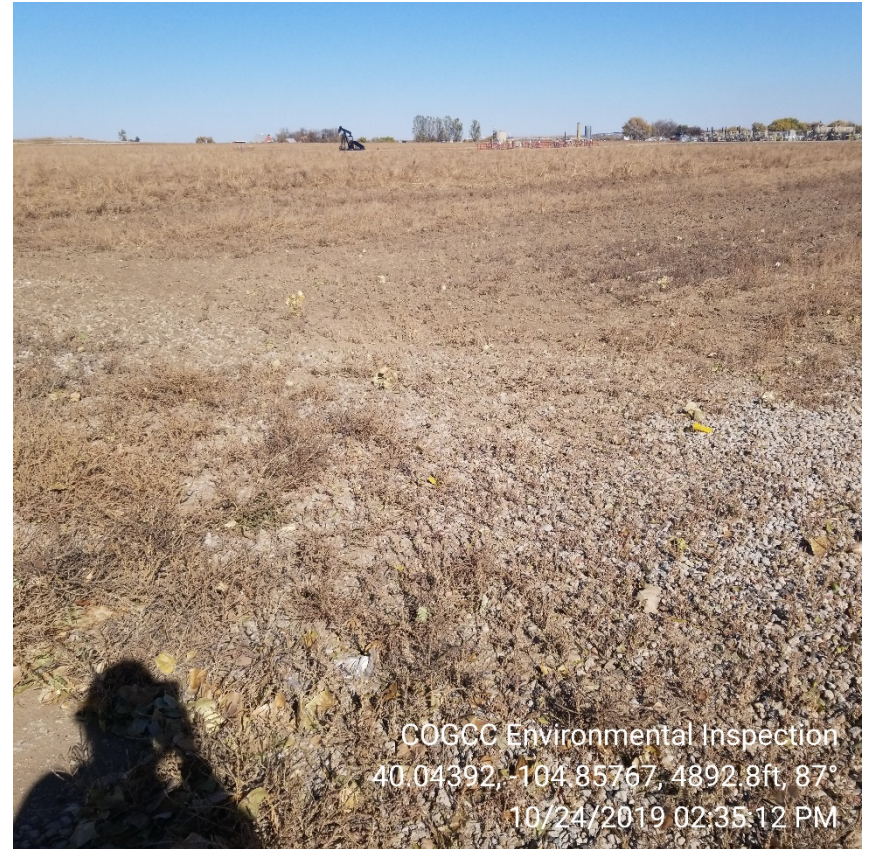
Photo 6 – Looking west; area of excavation related to Remediation #10757.