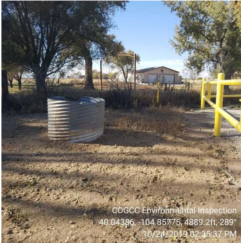
Photo 3 – Unmarked culvert. Excavation was backfilled imported material; surface appears to be road base or a similar material.