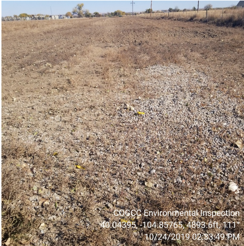
Photo 5 – Looking west; area of excavation related to Remediation #10757. Gravel is from the pigging station pad.