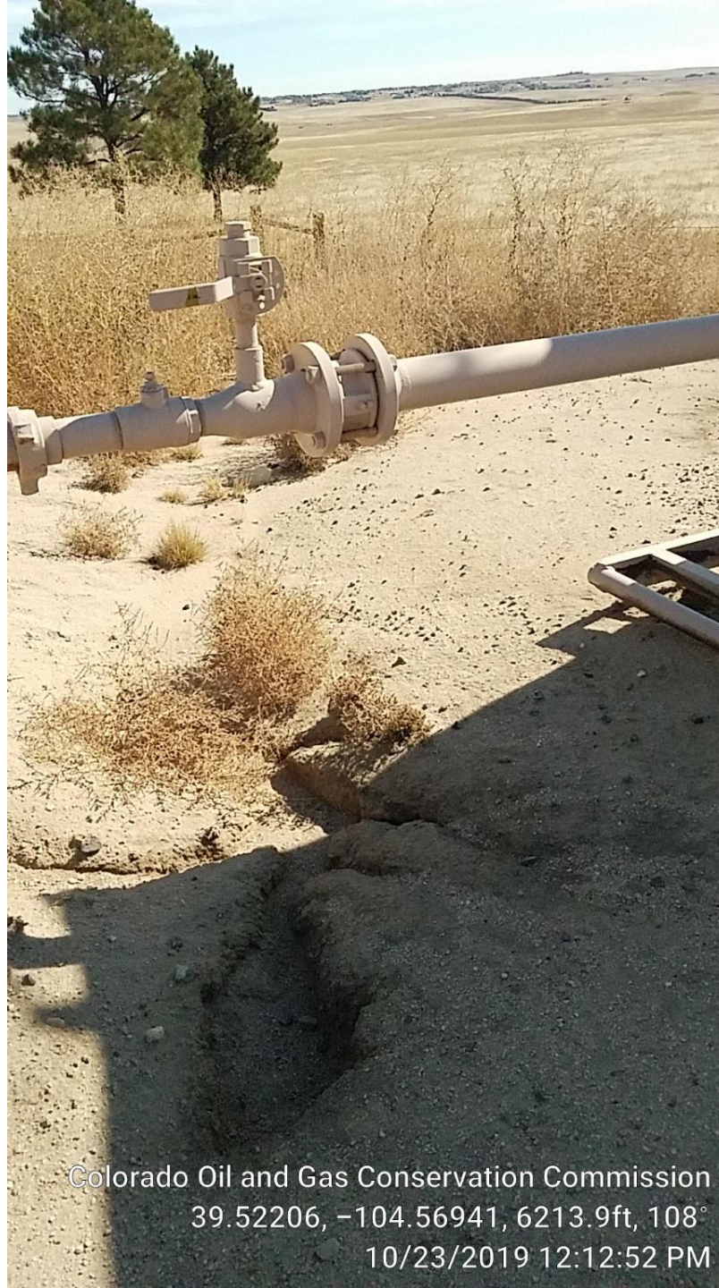
Erosion rill near gas meter run.