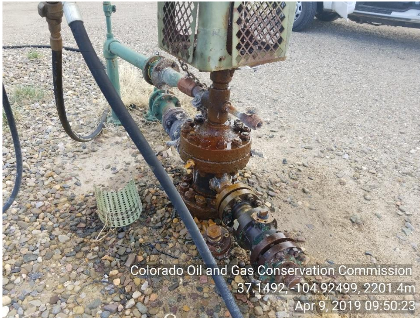
Photo 3 Stained soil around WH and packing leaking on well head.