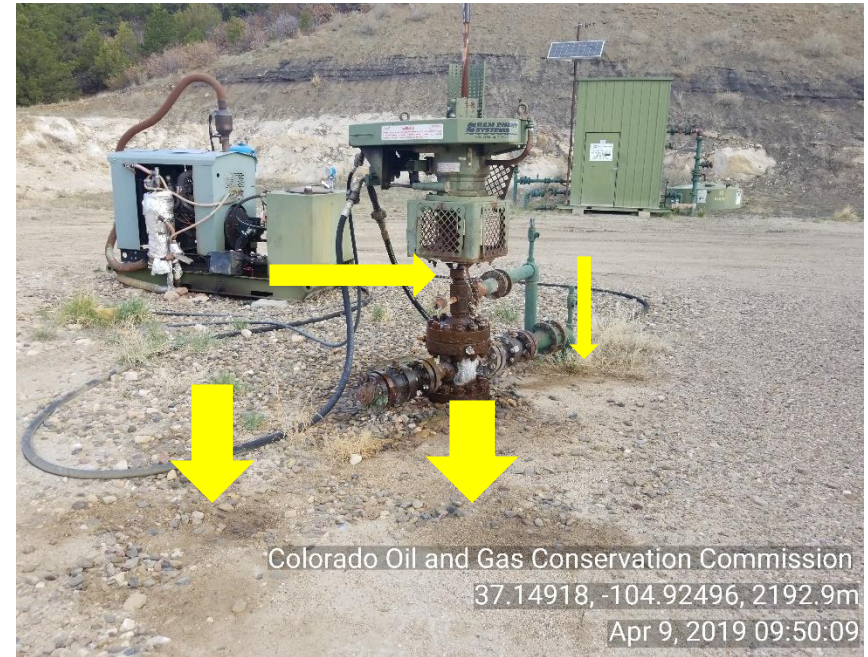
Photo 2 WH. Stained soil around well head. Packing on WH leaking at time of inspection.