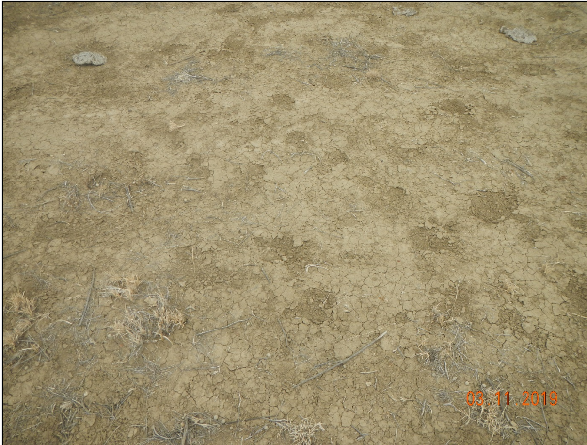
Photo 3. View of groundcover which is mostly bare soil.