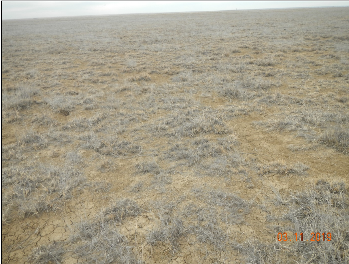
Photo 5. Facing west toward the undisturbed surrounding pasture.