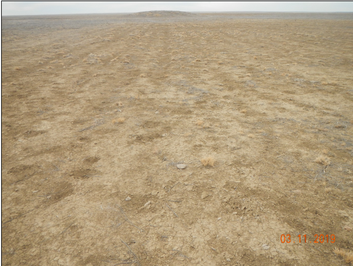
Photo 1. Facing southwest toward the location. There is sparse vegetation establishment.