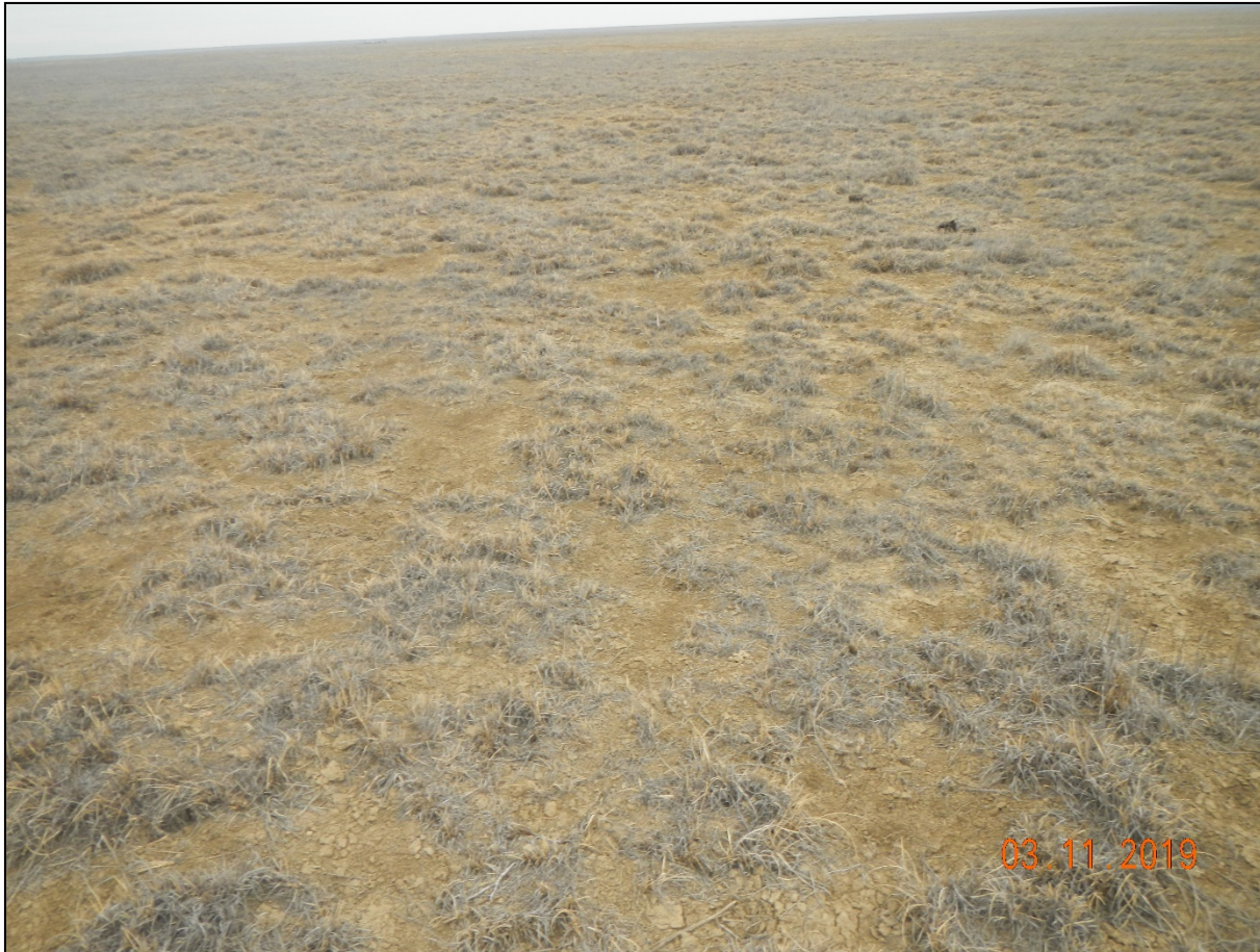
Photo 6. Facing east toward the undisturbed surrounding pasture.