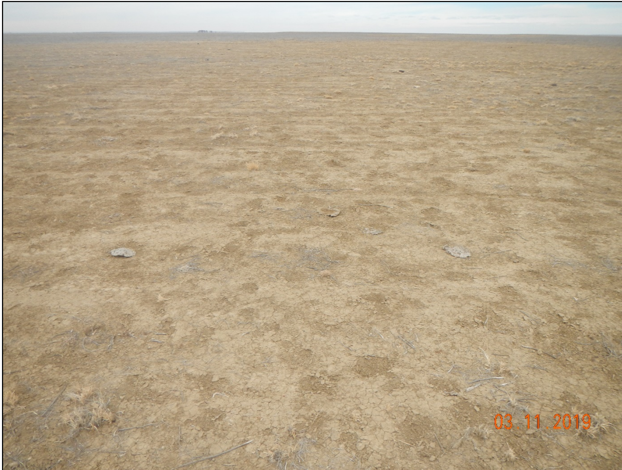
Photo 2. Facing northwest toward the location. There is sparse vegetation establishment.