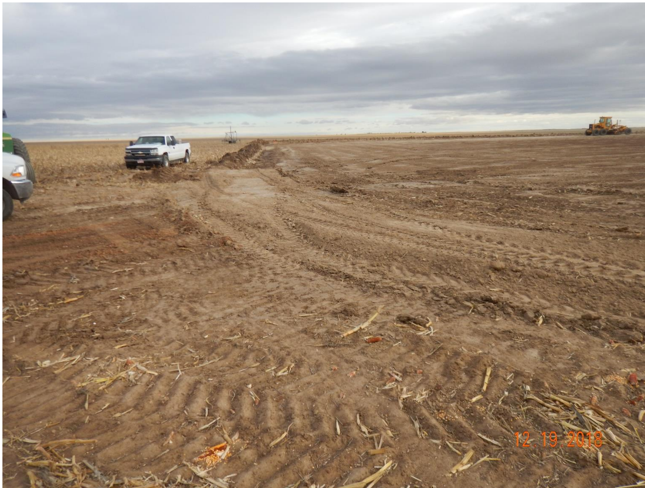
Photo 2: Photo taken from the southwest end of the construction disturbance, facing north. Photo provides an overview of the location. Photo also shows that perimeter stormwater and erosion control BMPs have not been installed in accordance with good engineering practices prior to and during construction activities.