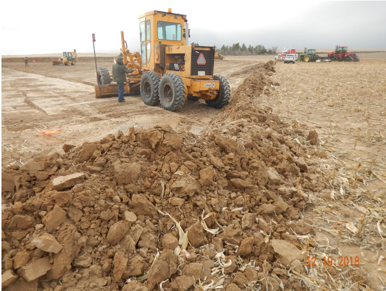
Photo 11: Photo taken from the northwest end of the construction disturbance, facing southwest. Photo provides an overview of the location. Photo also shows that perimeter stormwater and erosion control BMPs have not been installed in accordance with good engineering practices prior to and during construction activities.