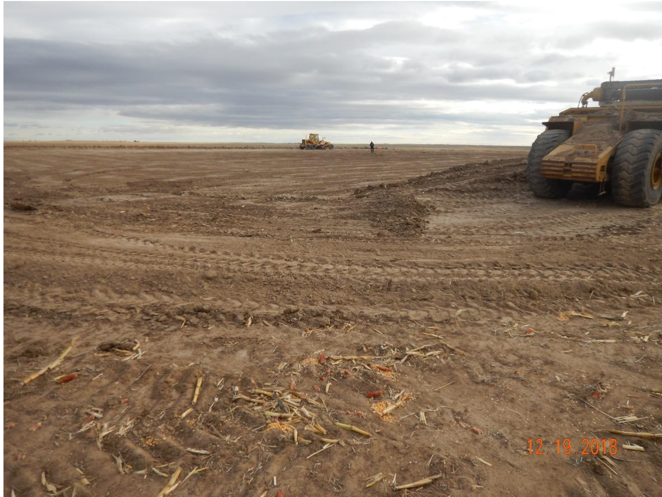
Photo 3: Photo taken from the southwest end of the construction disturbance, facing east. Photo provides an overview of the location. Photo also shows that perimeter stormwater and erosion control BMPs have not been installed in accordance with good engineering practices prior to and during construction activities.