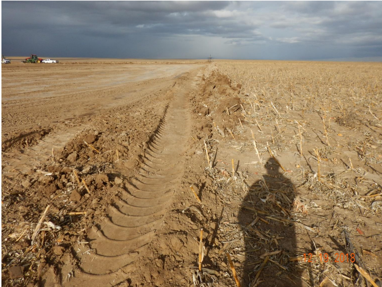
Photo 9: Photo taken from the northeast end of the construction disturbance, facing northwest. Photo provides an overview of the location. Photo also shows that perimeter stormwater and erosion control BMPs have not been installed in accordance with good engineering practices prior to and during construction activities.