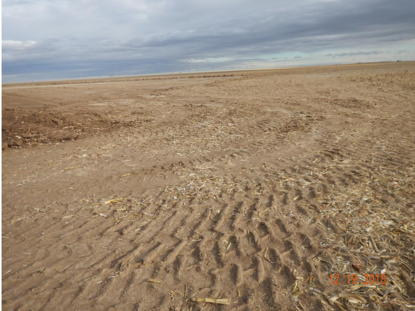
Photo 7: Photo taken from the southeast end of the construction disturbance, facing north. Photo provides an overview of the location. Photo also shows that perimeter stormwater and erosion control BMPs have not been installed in accordance with good engineering practices prior to and during construction activities. Photo also shows topsoil stockpile