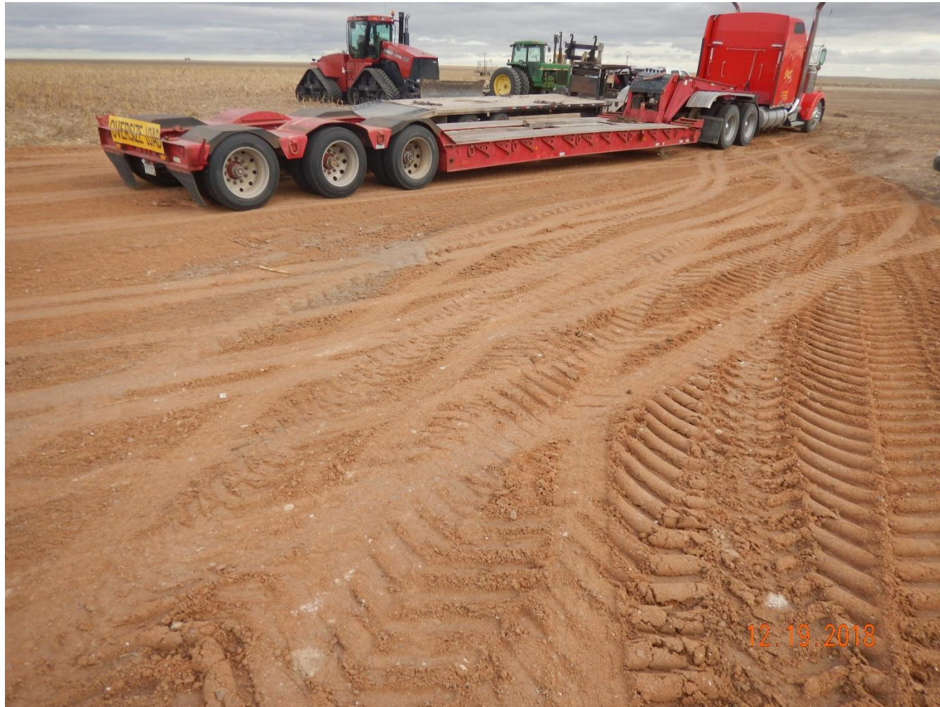
Photo 12: Photo taken from the access road, on the southwest end of the location, facing east. Photo shows fill material appears to have been brought onto the location to construct access road.