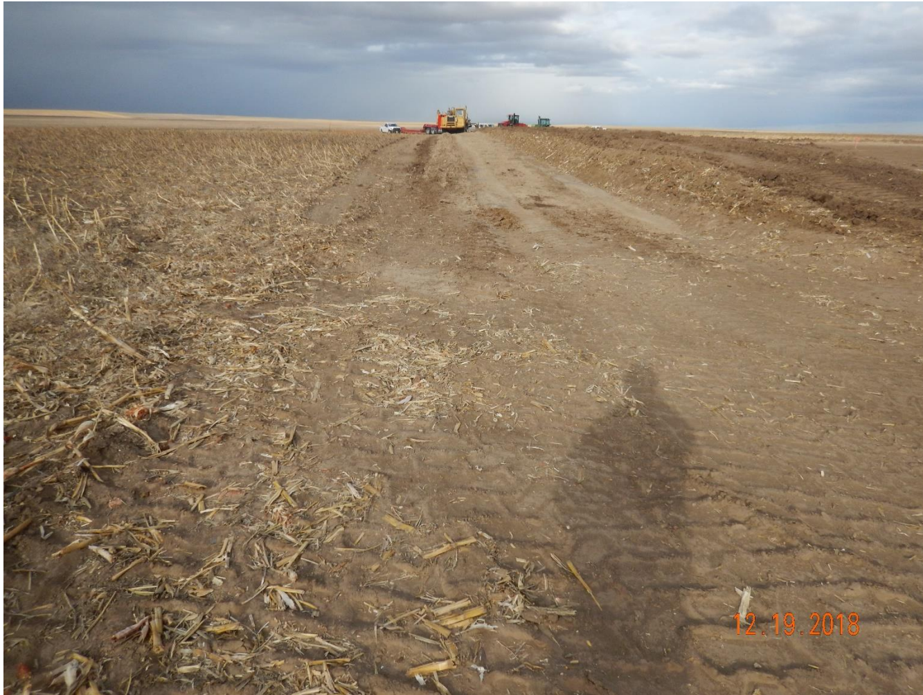
Photo 5: Photo taken from the southeast end of the construction disturbance, facing northwest. Photo provides an overview of the location. Photo also shows that perimeter stormwater and erosion control BMPs have not been installed in accordance with good engineering practices prior to and during construction activities. Photo also shows topsoil stockpile