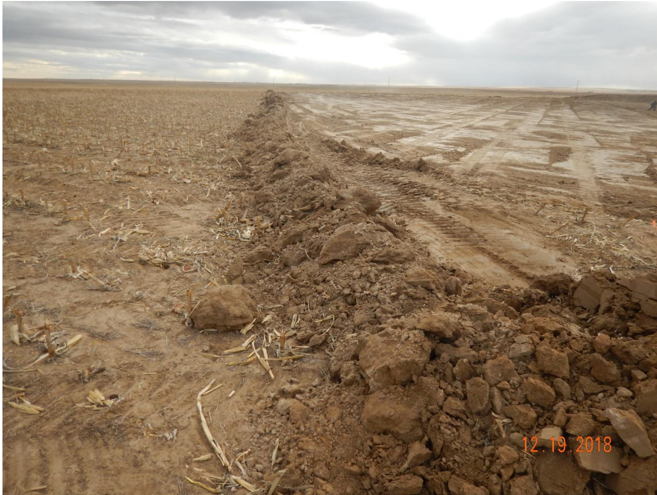
Photo 10: Photo taken from the northwest end of the construction disturbance, facing east. Photo provides an overview of the location. Photo also shows that perimeter stormwater and erosion control BMPs have not been installed in accordance with good engineering practices prior to and during construction activities.