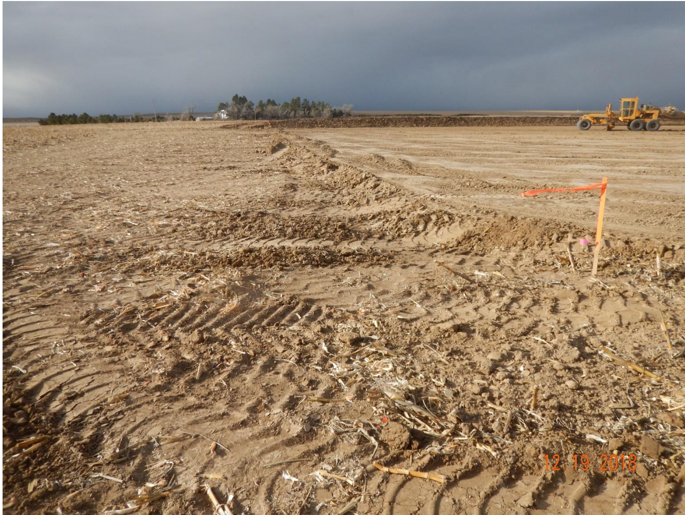
Photo 8: Photo taken from the northeast end of the construction disturbance, facing southwest. Photo provides an overview of the location. Photo also shows that perimeter stormwater and erosion control BMPs have not been installed in accordance with good engineering practices prior to and during construction activities.