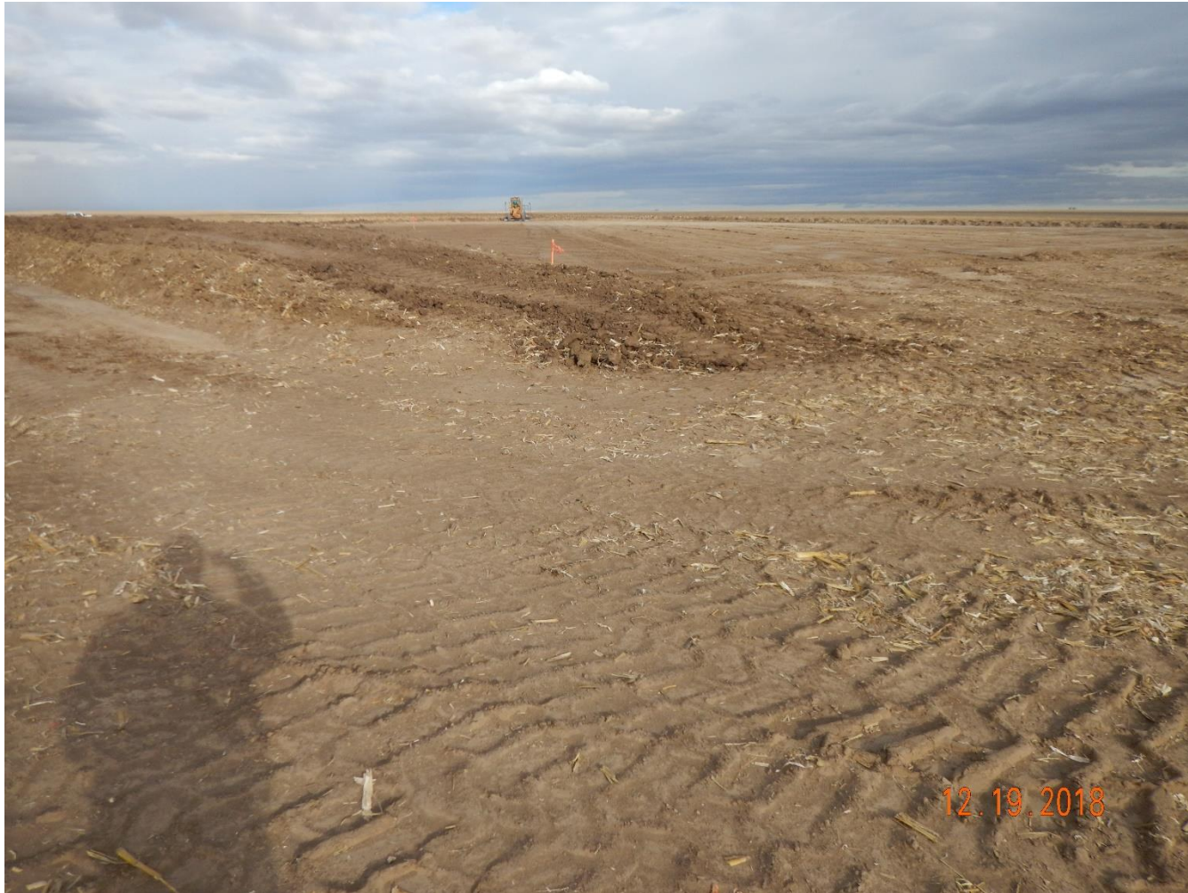
Photo 6: Photo taken from the southeast end of the construction disturbance, facing north. Photo provides an overview of the location. Photo also shows that perimeter stormwater and erosion control BMPs have not been installed in accordance with good engineering practices prior to and during construction activities. Photo also shows topsoil stockpile