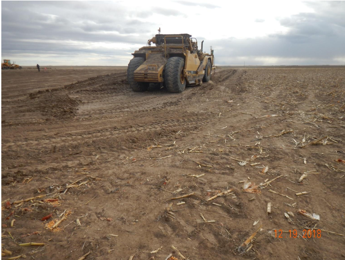
Photo 4: Photo taken from the southwest end of the construction disturbance, facing southeast. Photo provides an overview of the location. Photo also shows that perimeter stormwater and erosion control BMPs have not been installed in accordance with good engineering practices prior to and during construction activities. Photo also shows topsoil stockpile