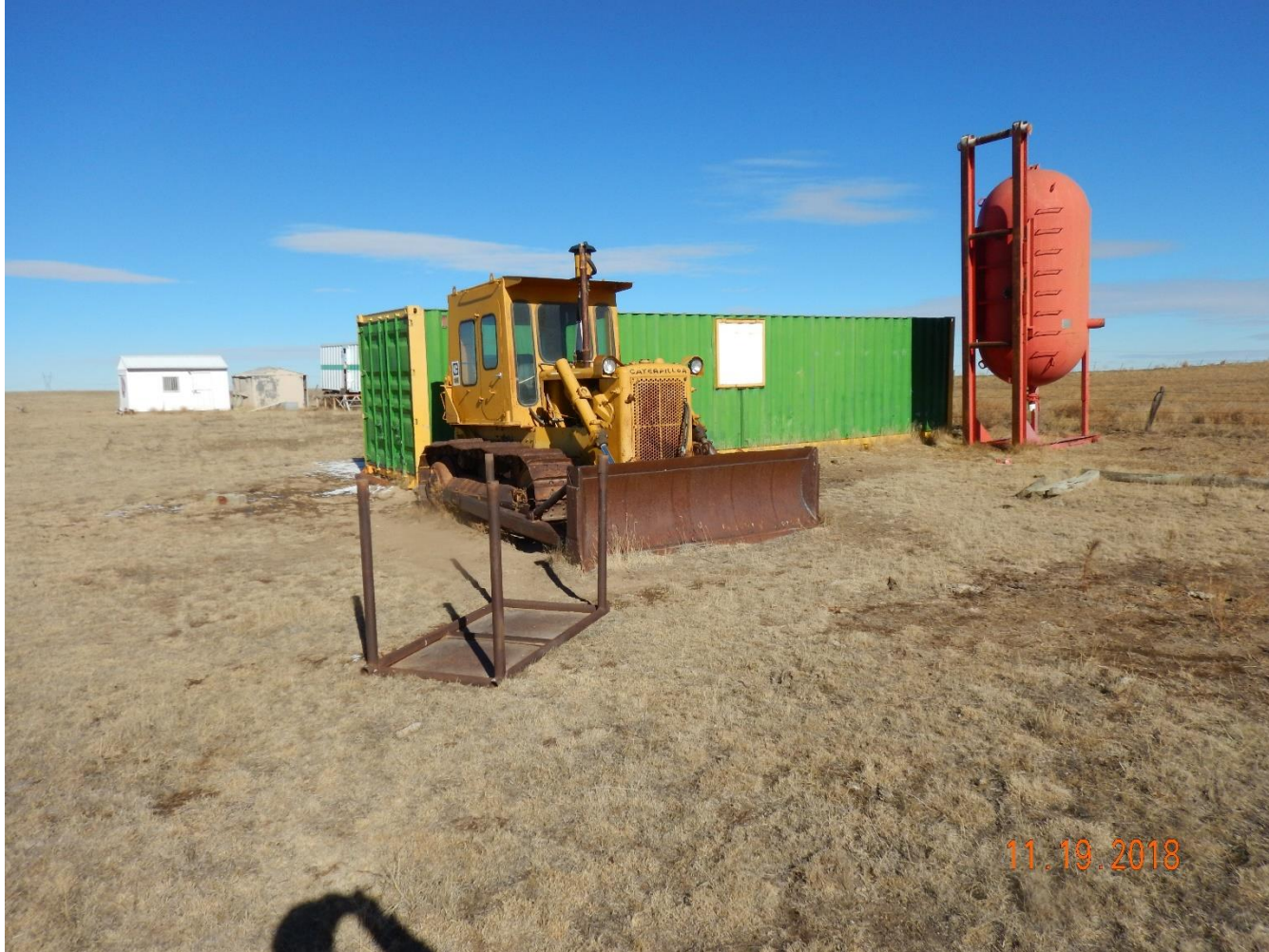
Photo 26: Photo taken from the battery location, facing north. See comments under photo 7