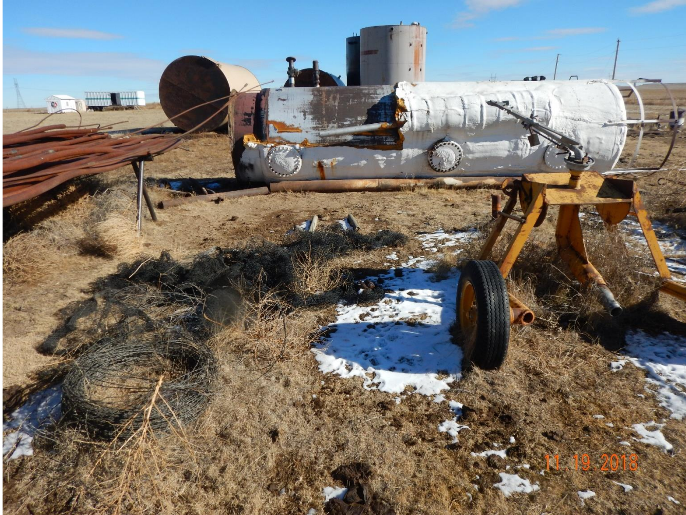
Photo 13: Photo taken from the battery location, facing east. See comments under photo 7