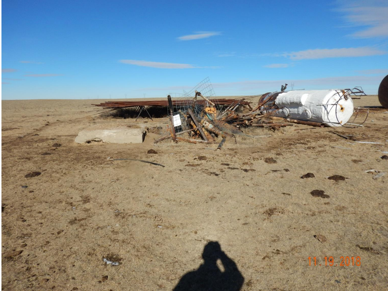
Photo 10: Photo taken from the battery location, facing northeast. See comments under photo 7