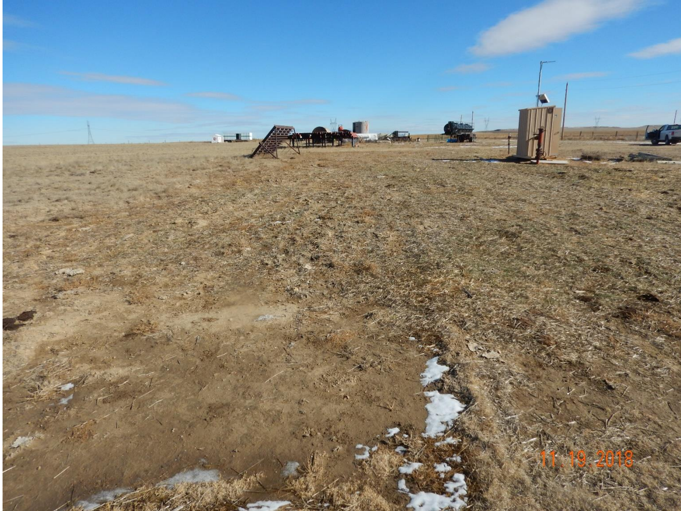
Photo 6: Photo taken from the west end of the battery location, facing east. Photo shows pits appear to have been closed.