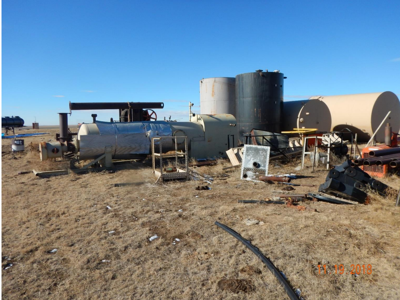
Photo 22: Photo taken from the battery location, facing west. See comments under photo 7