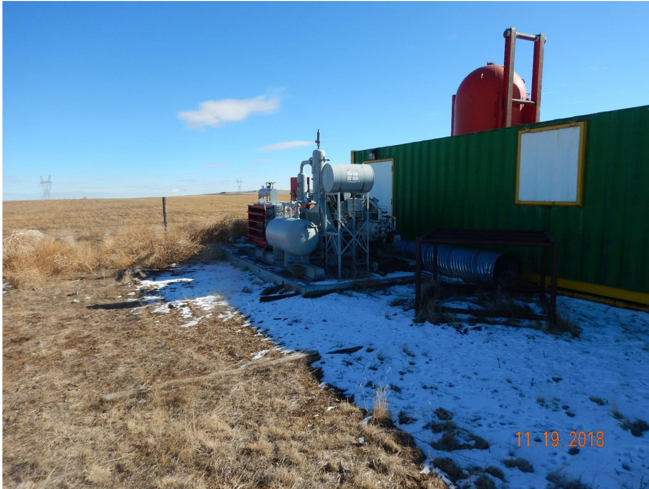
Photo 27: Photo taken from the battery location, facing east. See comments under photo 7