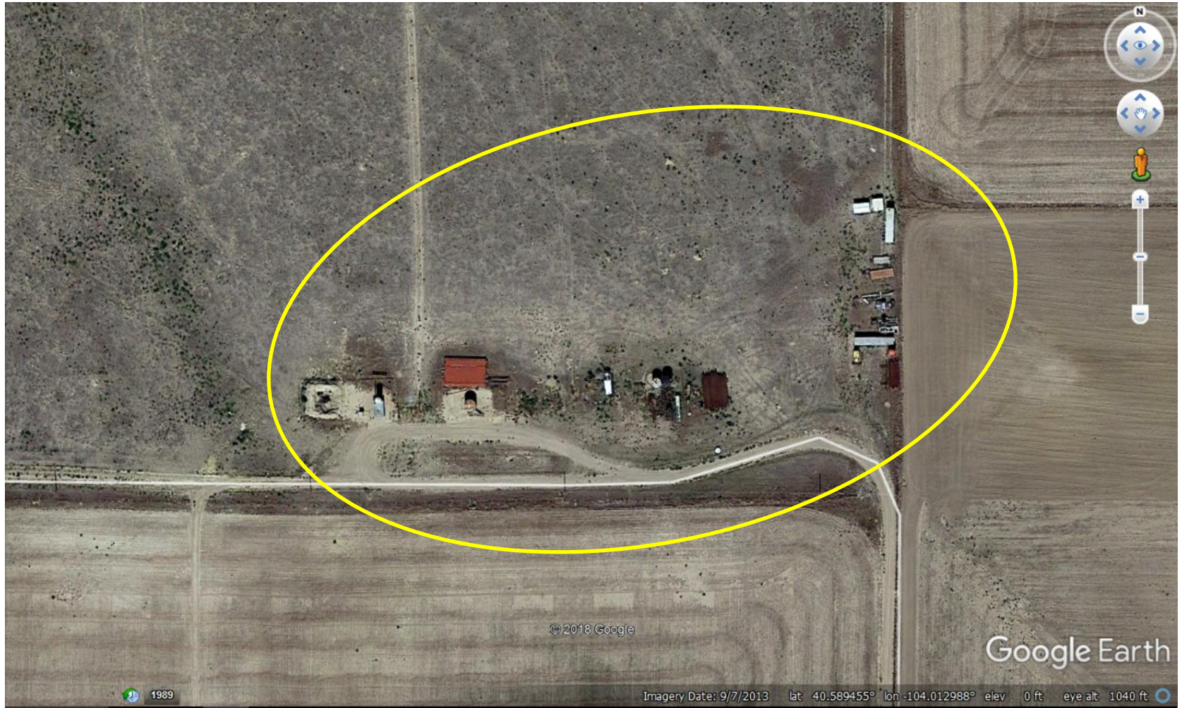
Photo 1: 2013 Google Earth aerial imagery. Photo shows aerial image of the tank battery and various equipment on site.