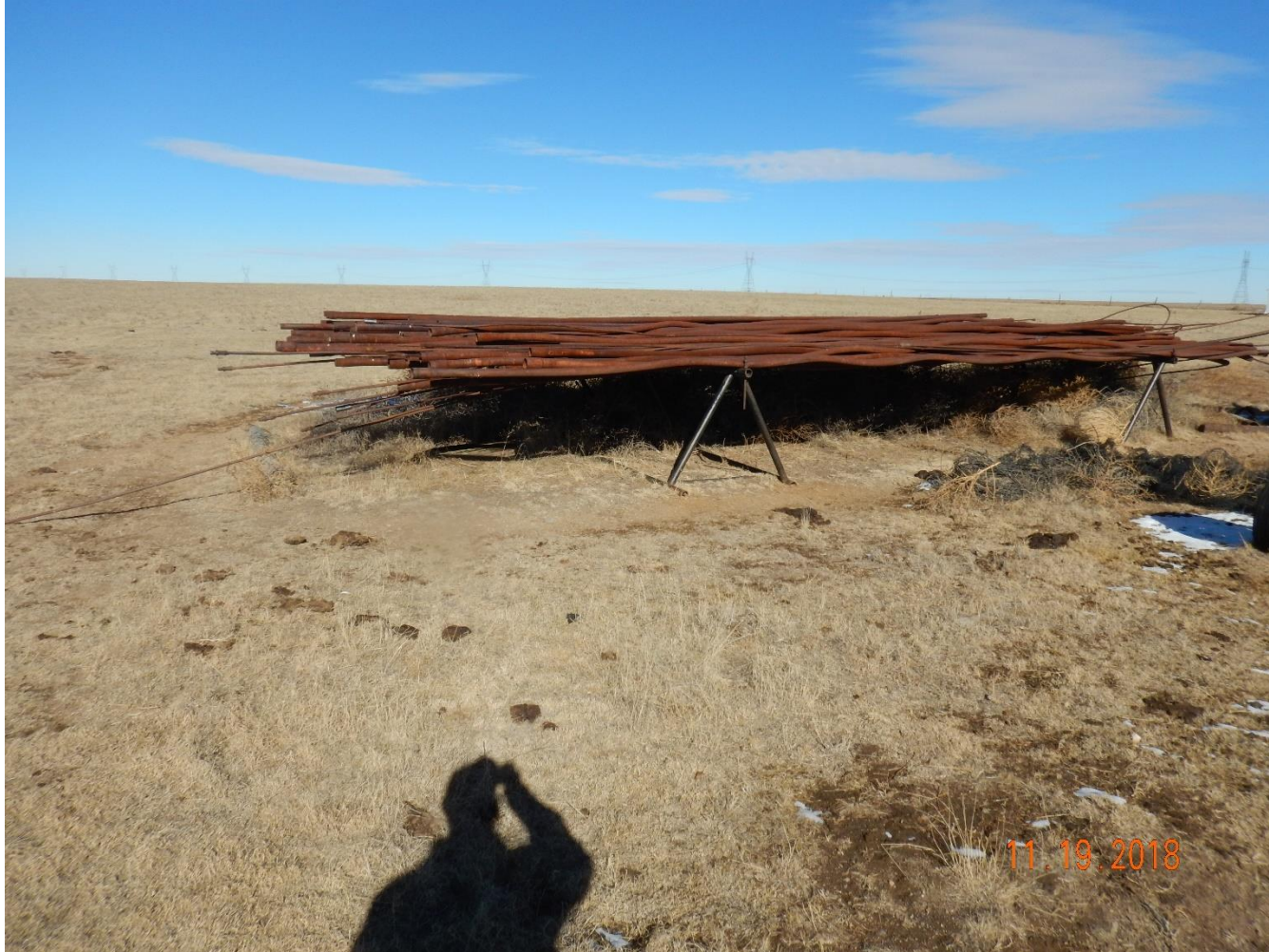
Photo 14: Photo taken from the battery location, facing north. See comments under photo 7