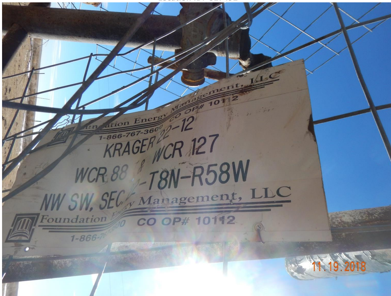
Photo 12: Photo taken from the battery location, facing north. Photo shows "Foundation" sign amongst debris on site.