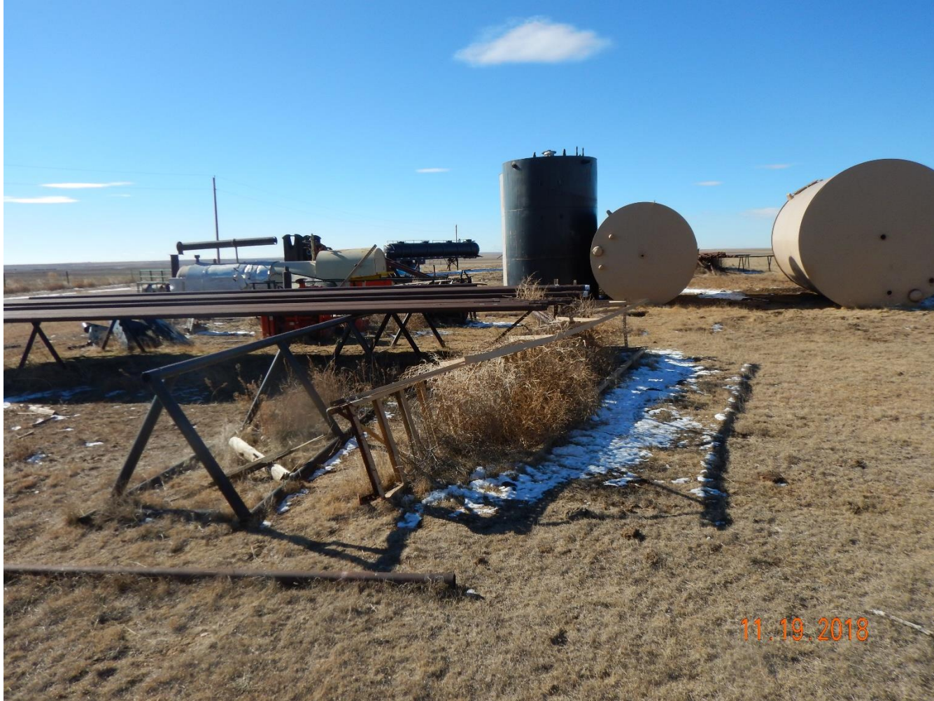
Photo 23: Photo taken from the battery location, facing west. See comments under photo 7