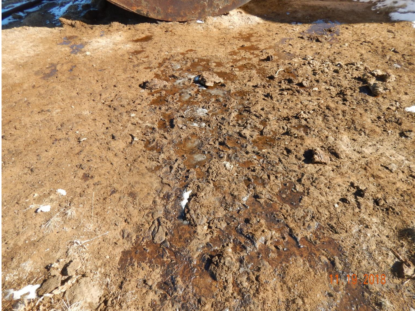
Photo 18: Continued from photo 17. Photo shows contaminated soils at tank base.