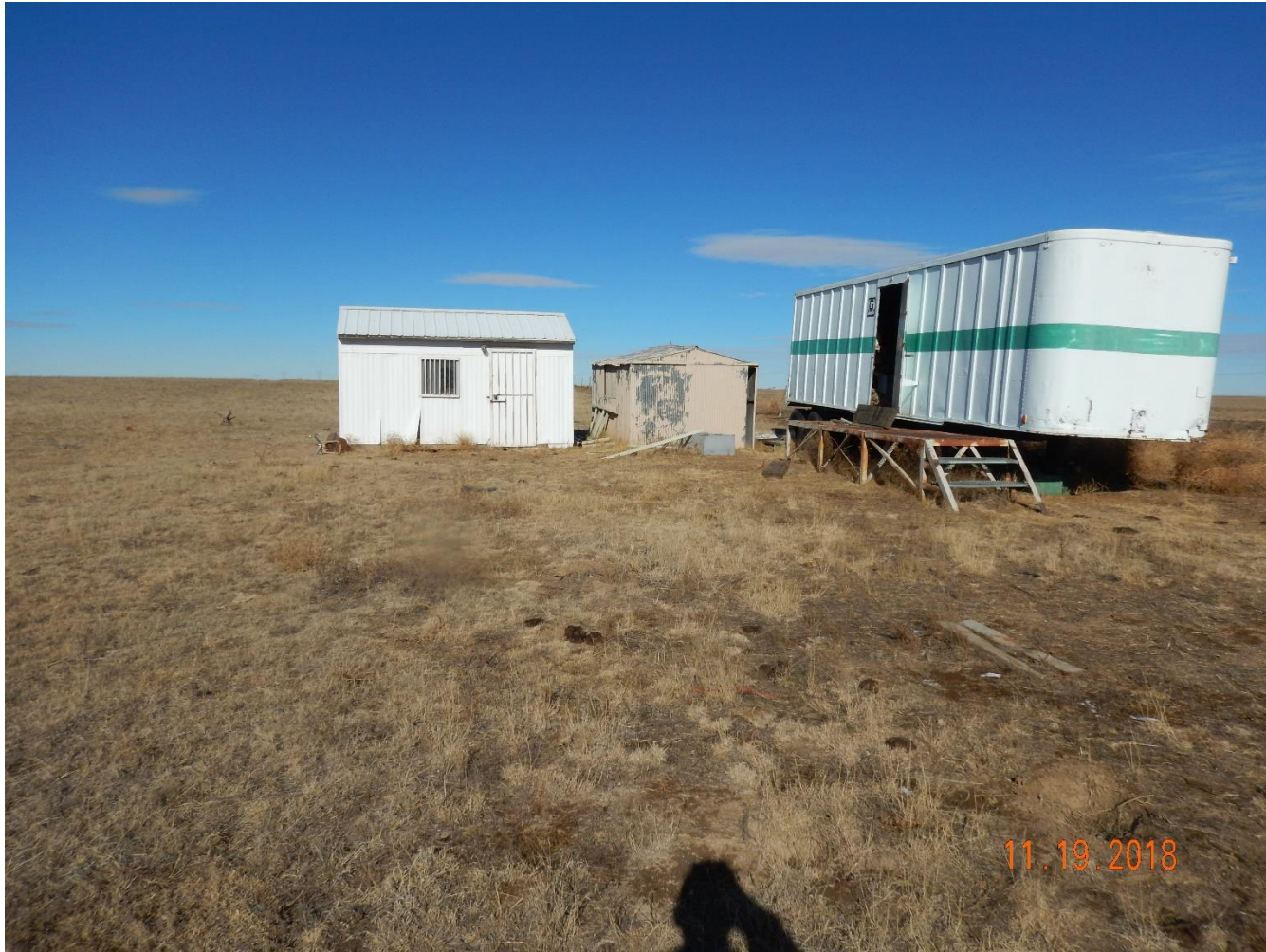
Photo 28: Photo taken from the battery location, facing north. See comments under photo 7