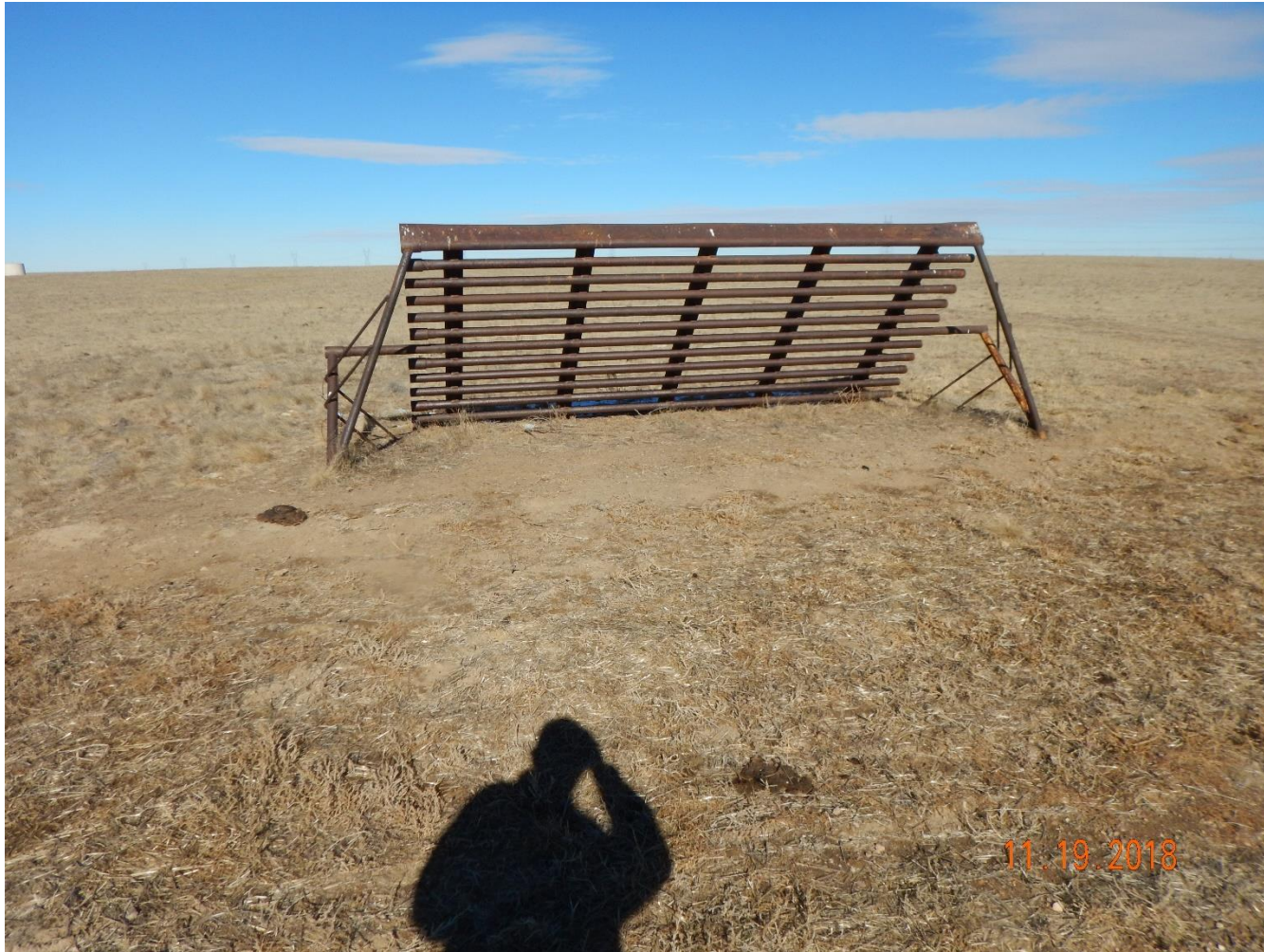
Photo 7: Photo taken from the battery location, facing north. Photo shows operator has failed to remove equipment from the location per 603.f and 1004.a.