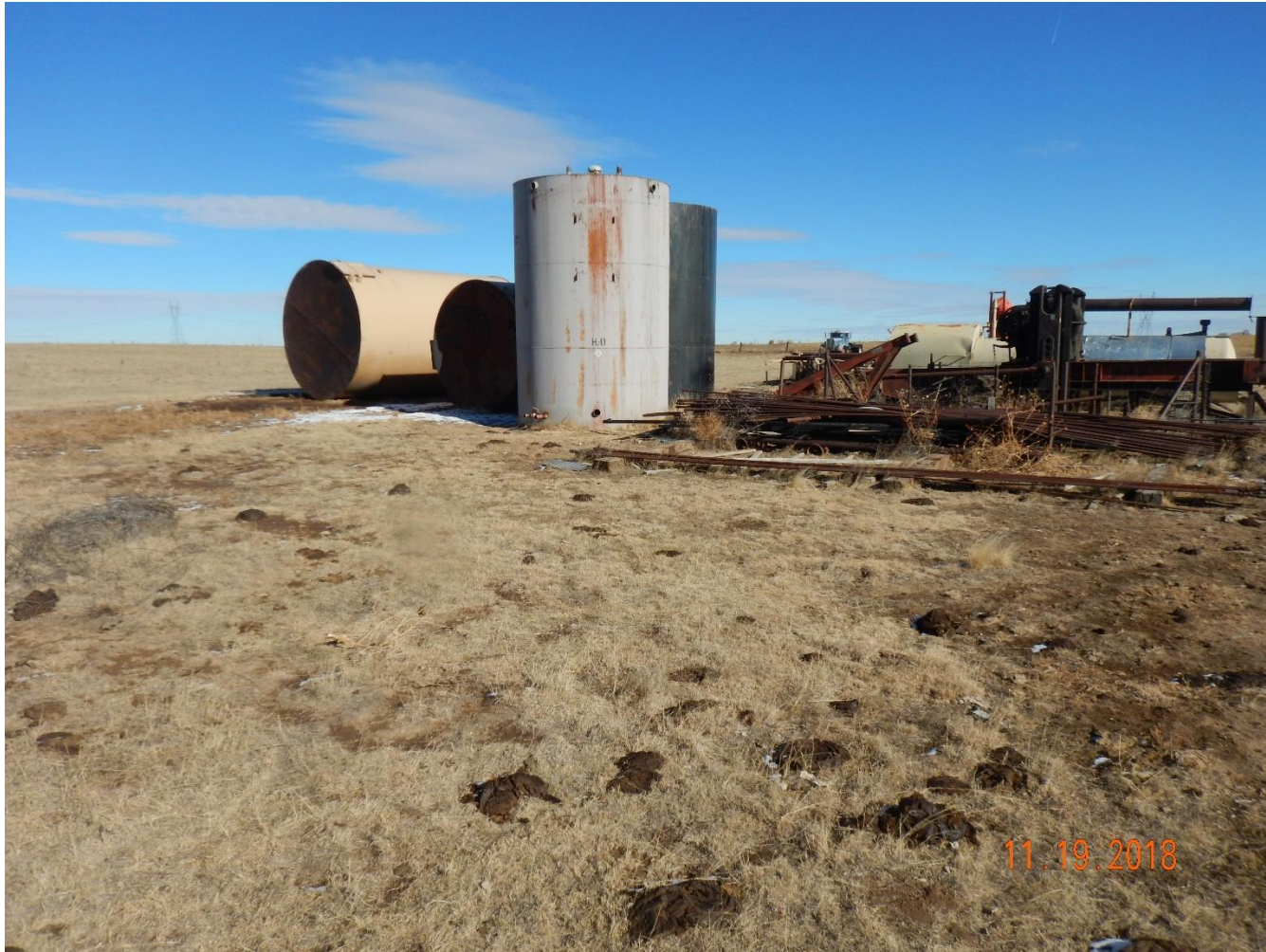
Photo 15: Photo taken from the battery location, facing east. See comments under photo 7