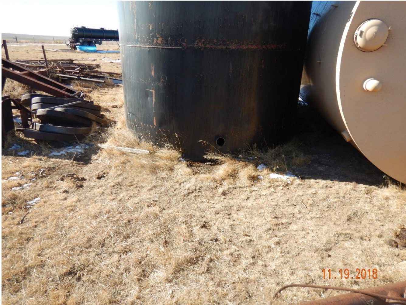
Photo 24: Photo taken from the battery location, facing north. Photo shows tank appears to have been leaking as contaminated soils evident at tank base.