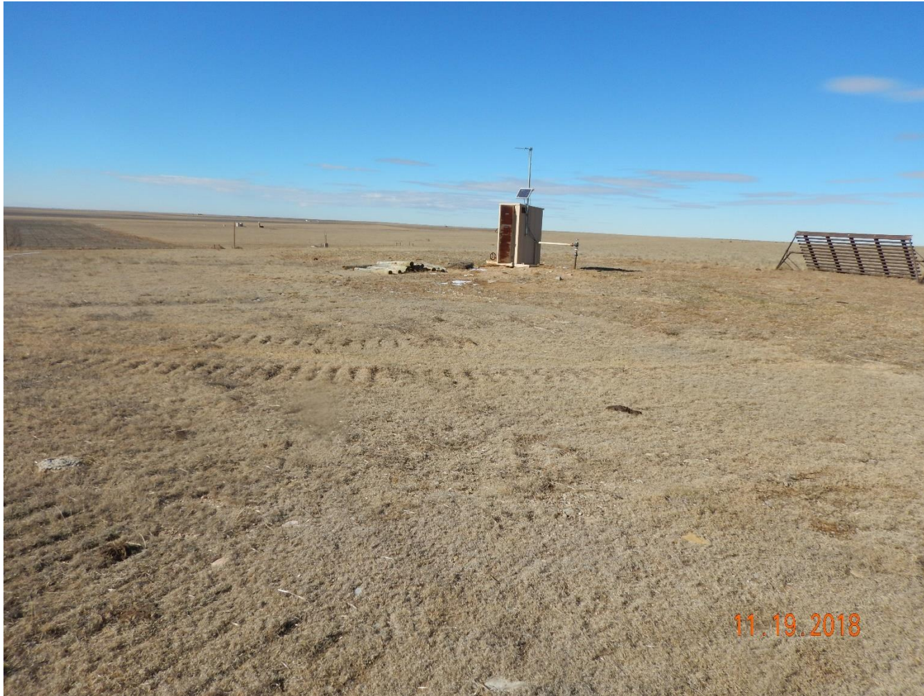
Photo 2: Photo taken from the south end of the battery location facing west. Photos 2-4 provide an overview of the location from west, north, to east. Photos also show operator has failed to remove equipment and conduct reclamation of the location.