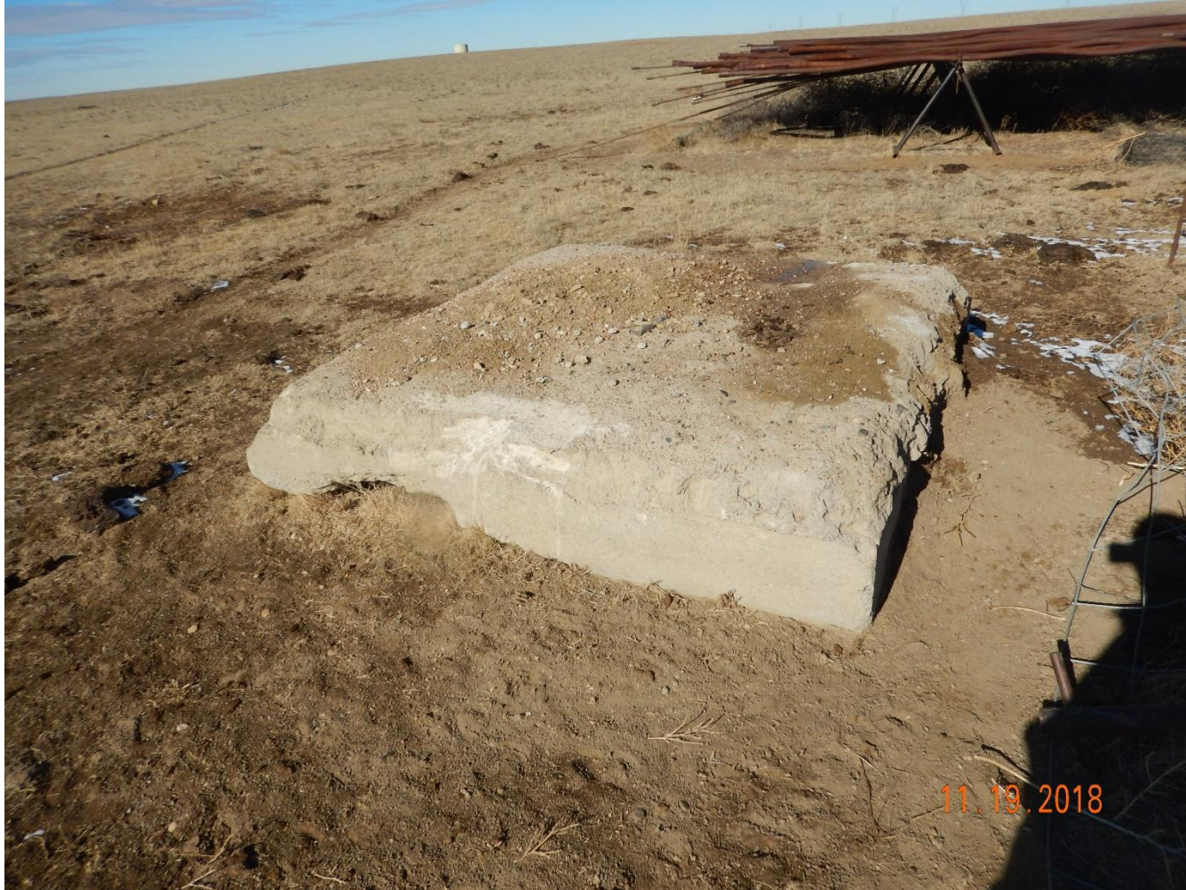
Photo 11: Photo taken from the battery location, facing north. See comments under photo 7