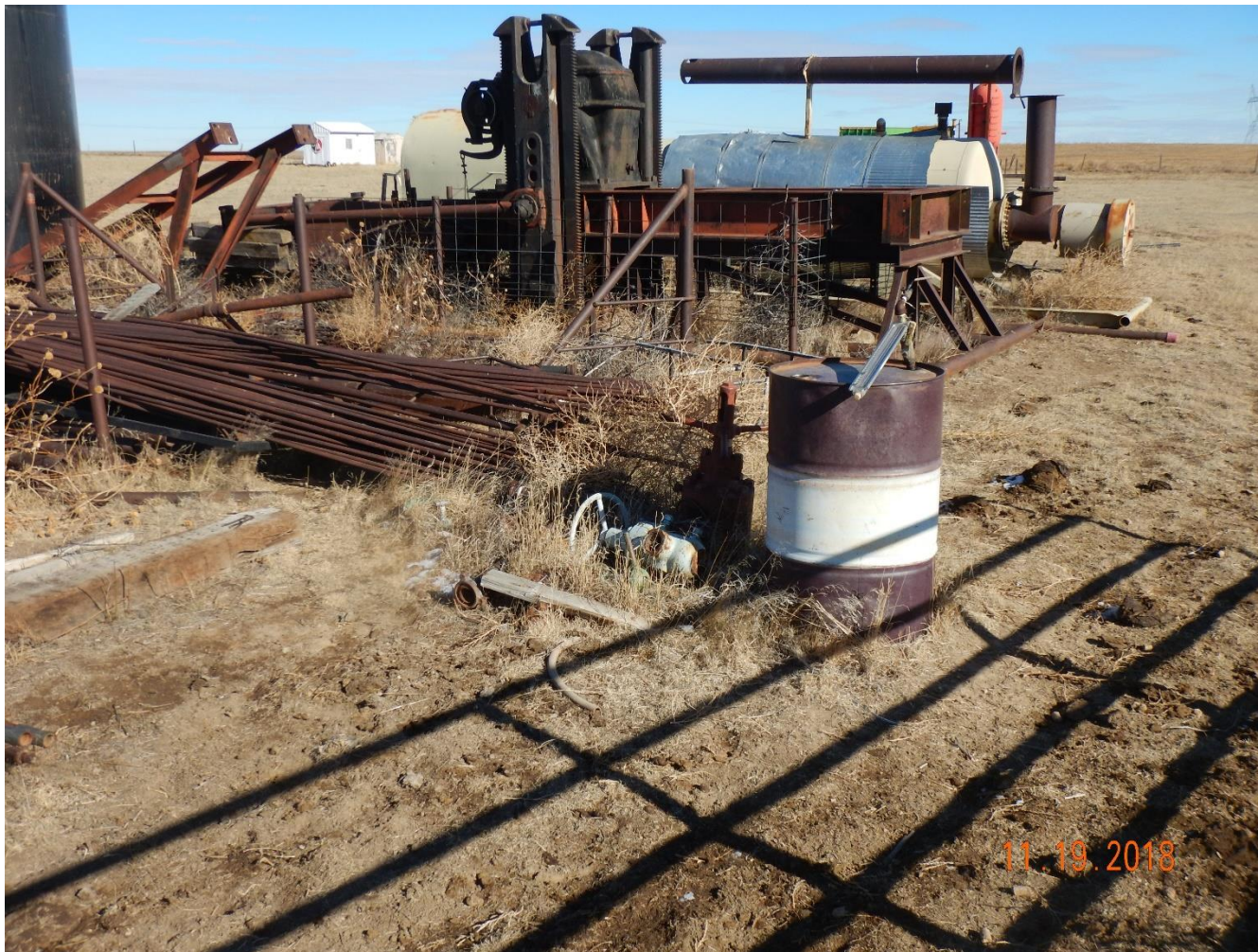
Photo 20: Photo taken from the battery location, facing east. See comments under photo 7. Photo also shows a barrel filled with chemical not in secondary containment.