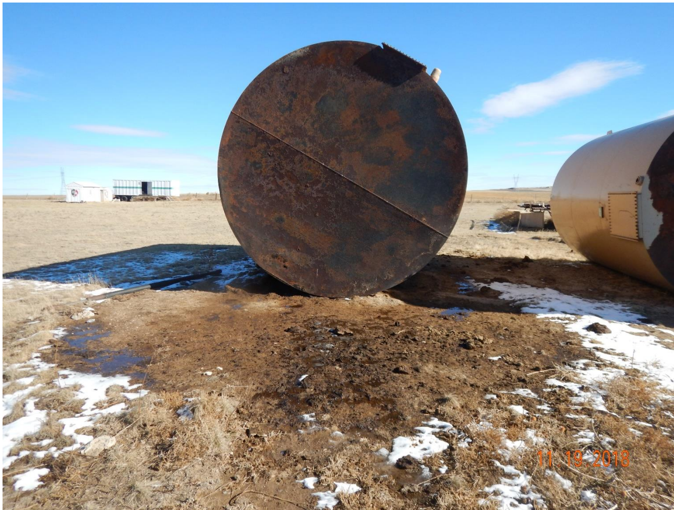
Photo 16: Photo taken from the battery location, facing north. Photo shows tank laying on side. Base of tank appears to have a hole. Photo also shows contaminated soils at tank base.