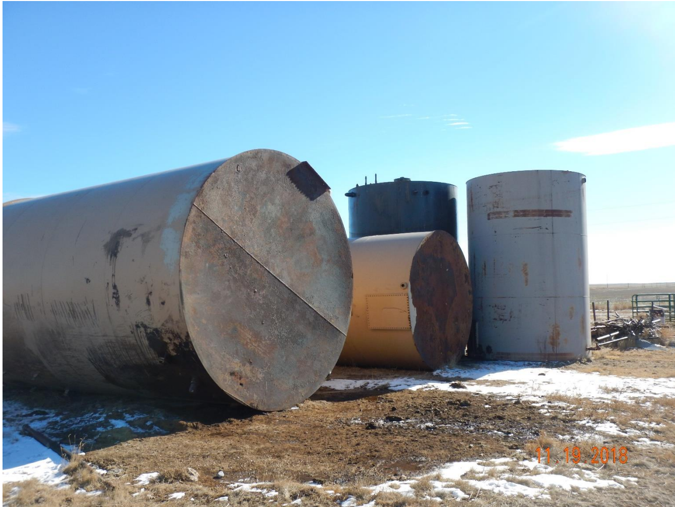
Photo 19: Photo taken from the battery location, facing southeast. See comments under photo 7