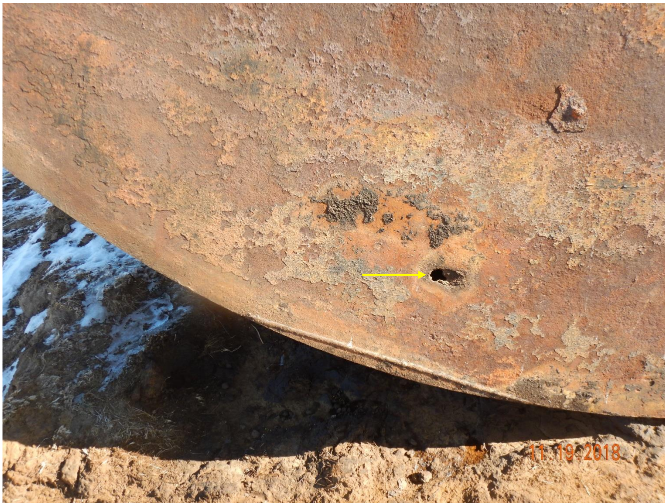
Photo 17: Photo taken from the battery location, facing north. Photo shows tank laying on side. Base of tank appears to have a hole. Photo also shows contaminated soils at tank base.