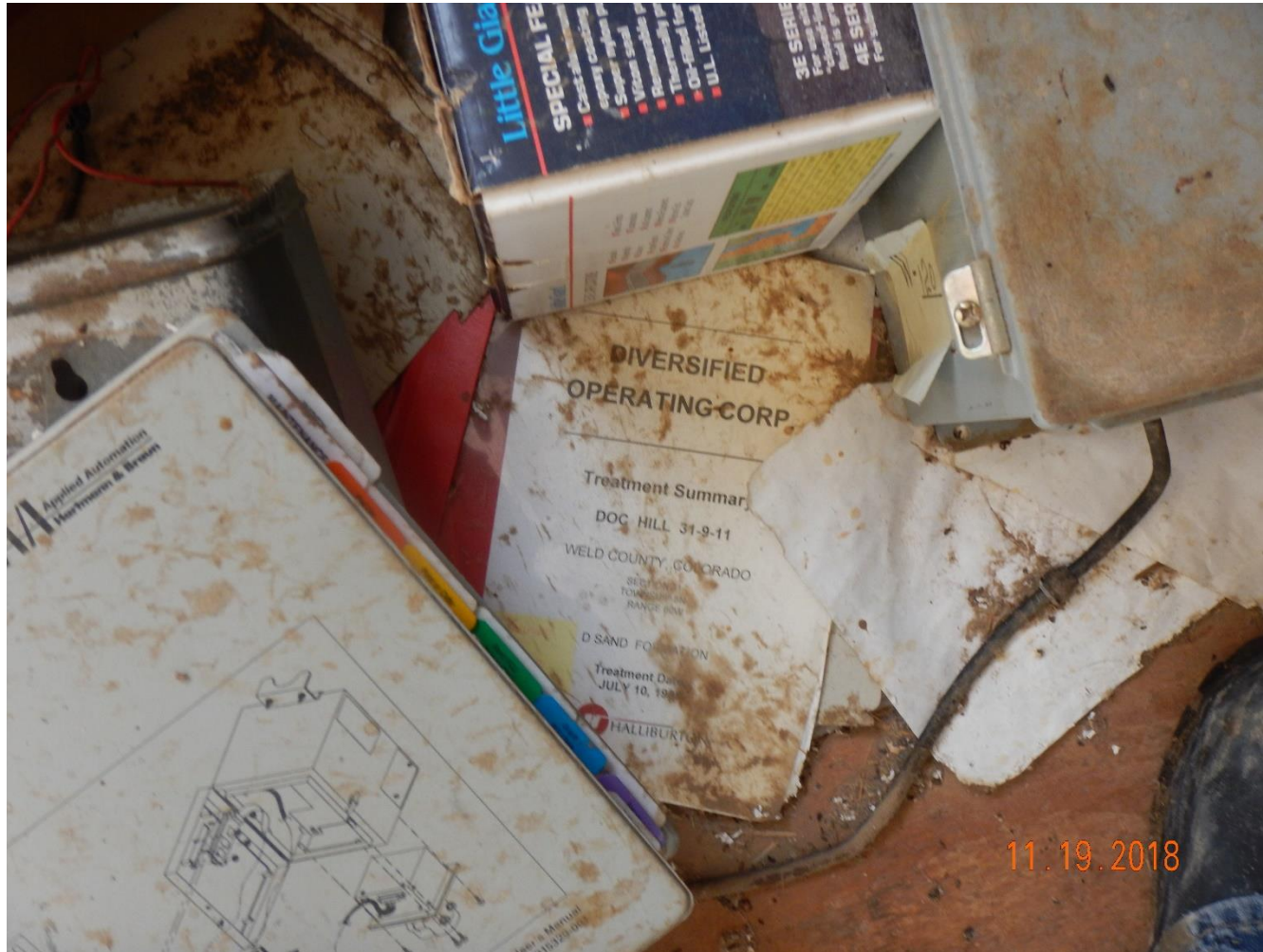
Photo 29: Photo taken from shed in photo 28. Multiple documents from the operator “Diversified Operating Corp” were observed within the building. Diversified was a previous operator for this location. Photo shows sheds observed on the east are associated with oil and gas.