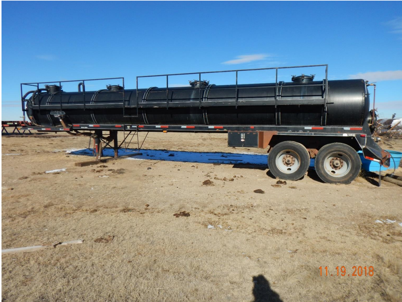
Photo 9: Photo taken from the battery location, facing north. See comments under photo 7