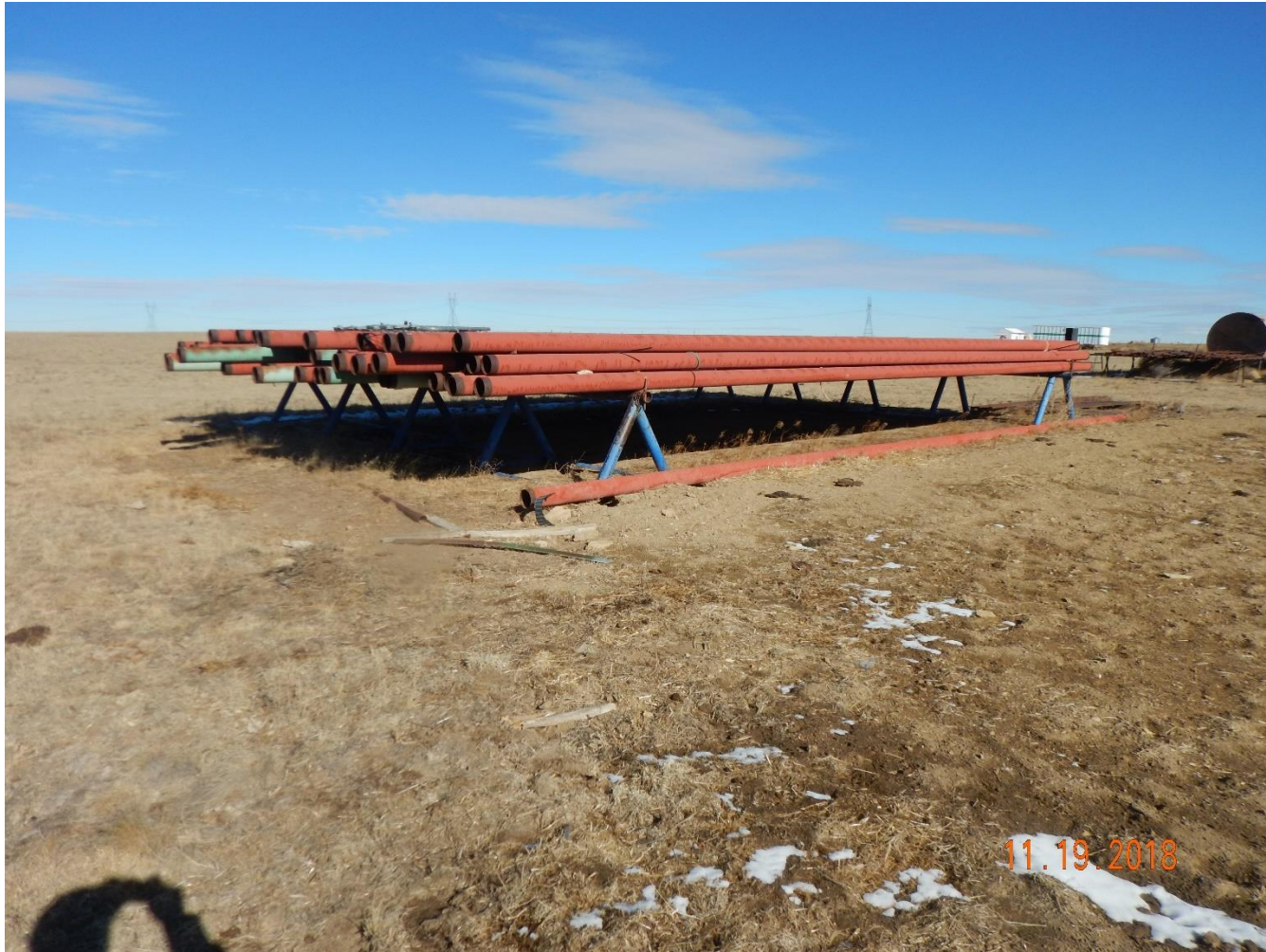
Photo 8: Photo taken from the battery location, facing northeast. See comments under photo 7