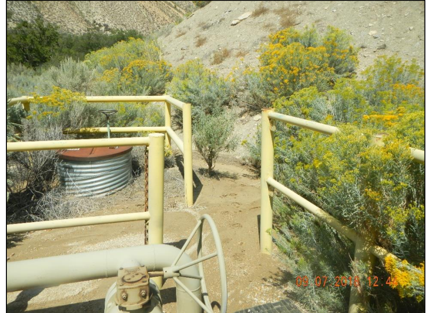
Road ditch overflowing to valve station.