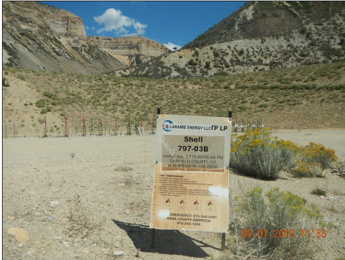
Location sign. Access road not on sign.

Shell 697-34-14B Api# 05-045-17584 Inspection # 689701777