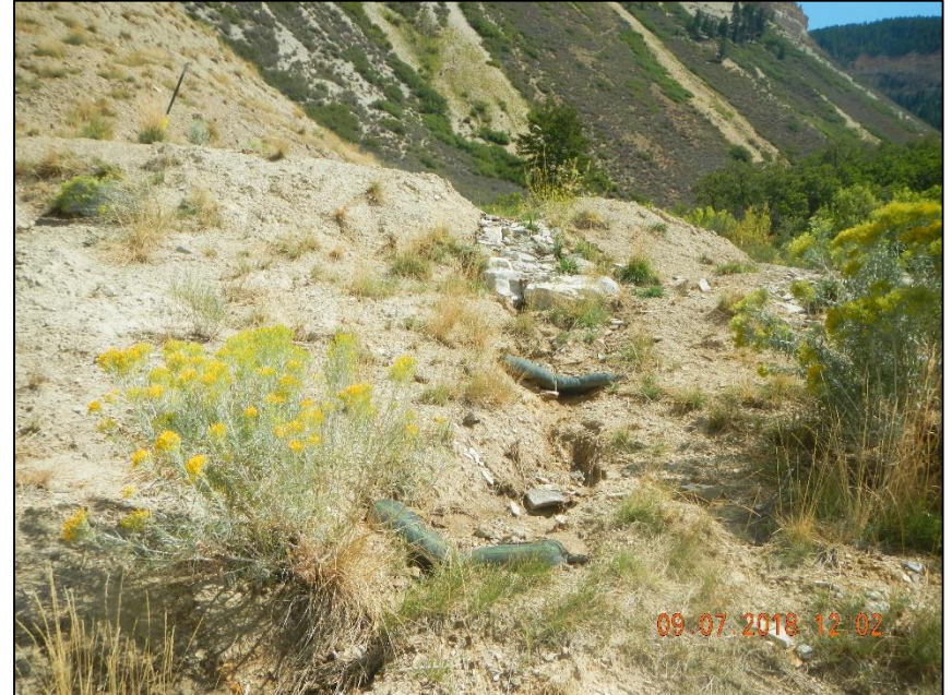
Washing of slope from check dam to location.