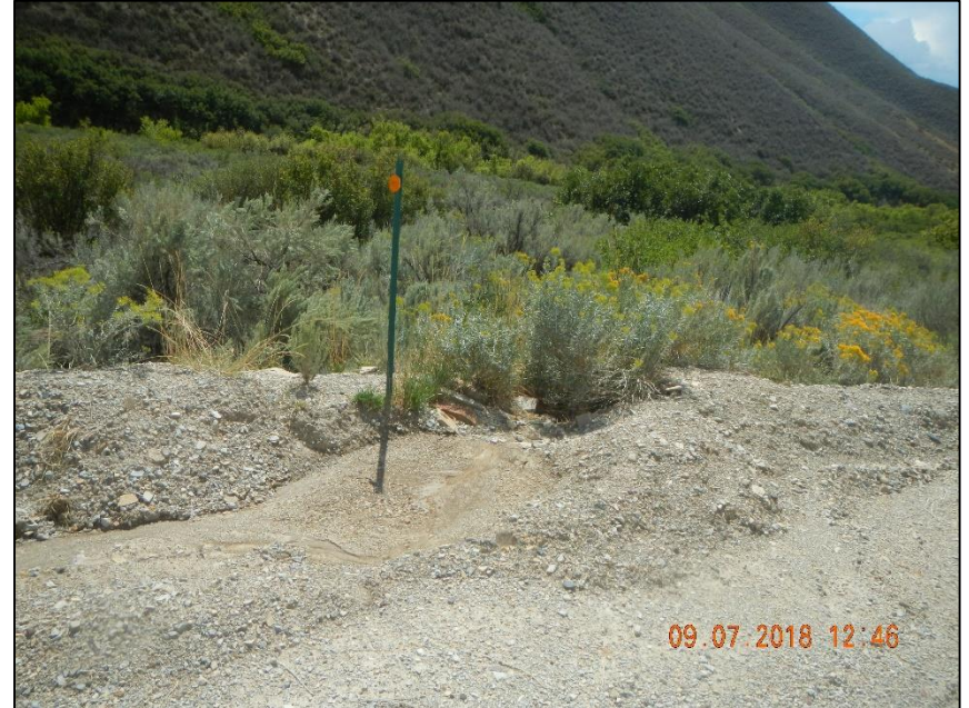
Sediment build up