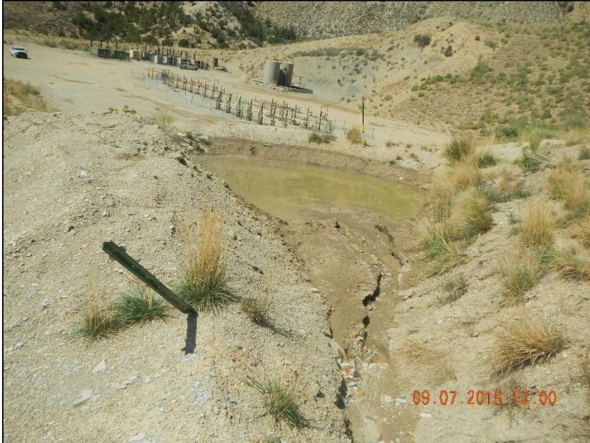
Sediment build up.

Shell 697-34-14B Api# 05-045-17584 Inspection # 689701777