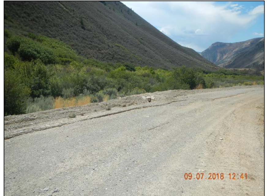
Erosion rill down road.