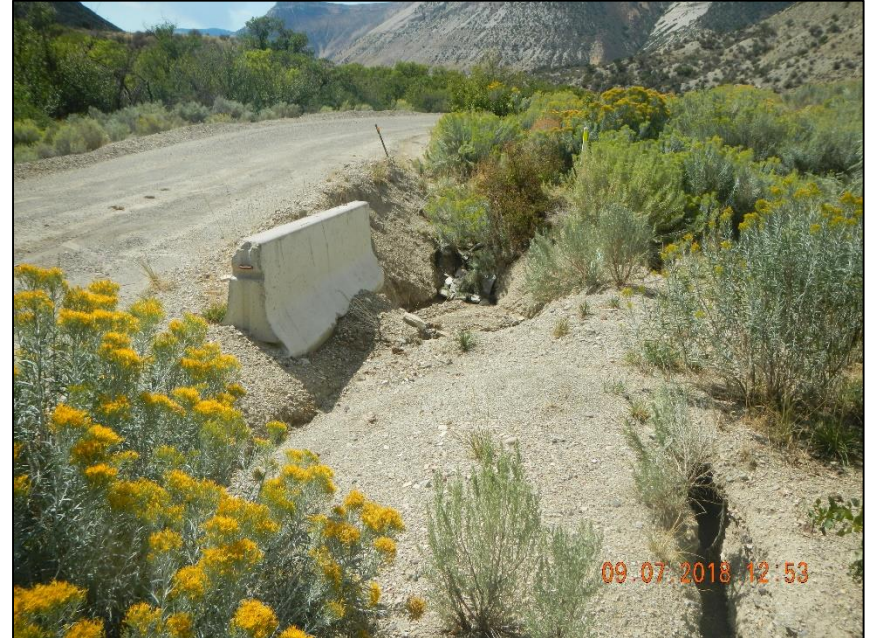
Erosion riling and channeling of ditch into culvert basin.