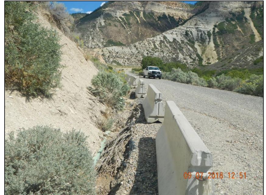
Washing of ditch and roadway along barriers.