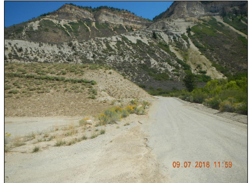
Riling across entrance.