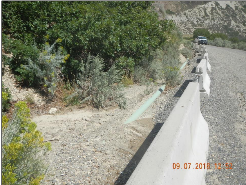
Sediment build up

Shell 697-34-14B Api# 05-045-17584 Inspection # 689701777