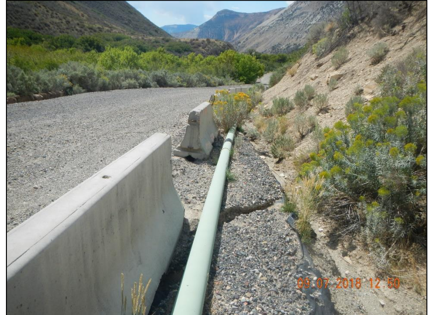
Washing of ditch and roadway along barriers.