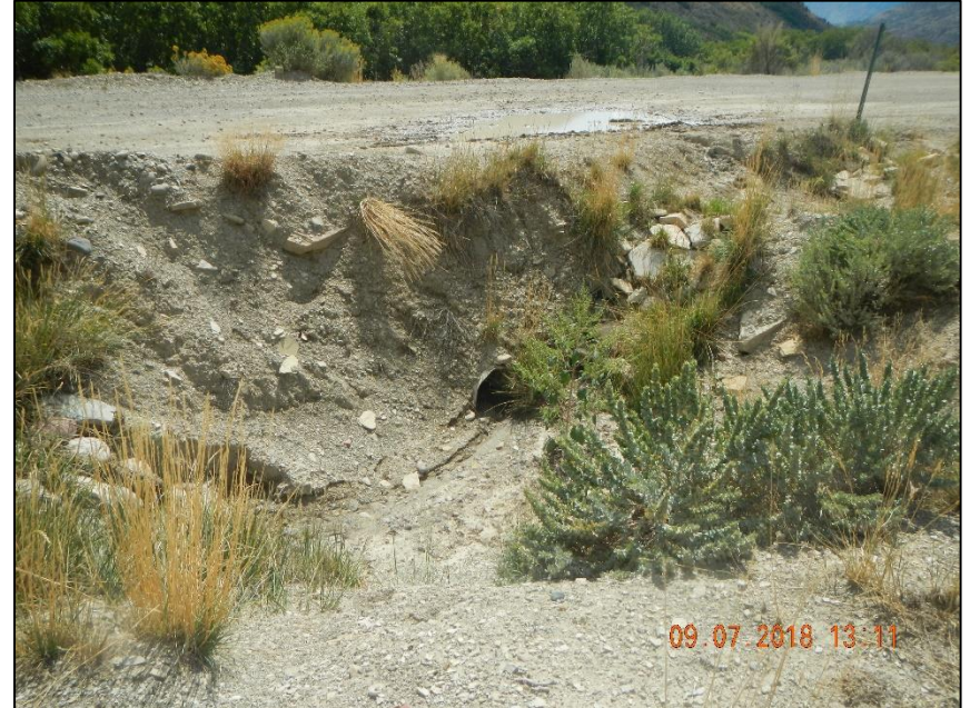
Sediment in culvert and unmaintained basins.