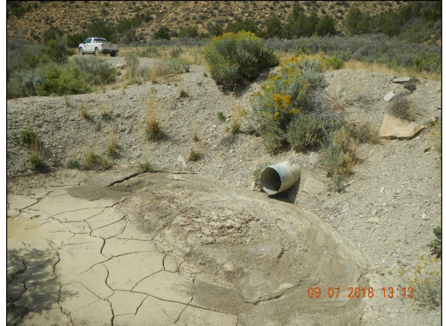
Sediment build up.