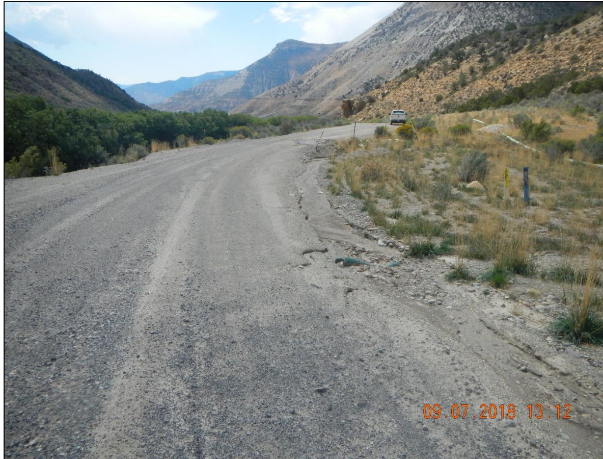
Washing and movement of sediment in ditch.

Shell 697-34-14B Api# 05-045-17584 Inspection # 689701777