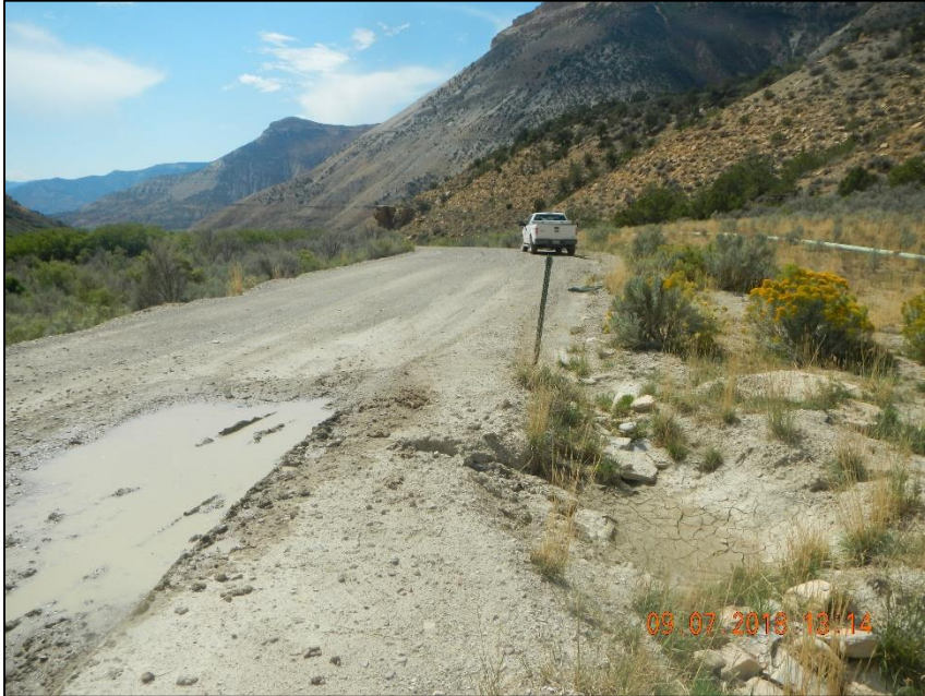
Washing of roadway into culvert.

Shell 697-34-14B Api# 05-045-17584 Inspection # 689701777