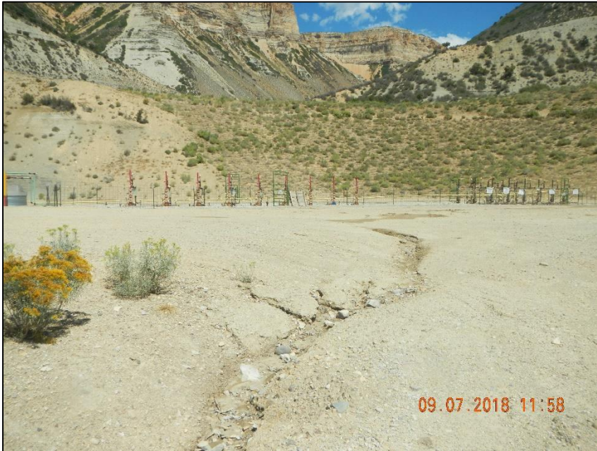
Erosion rill running from wells to entrance.

Shell 697-34-14B Api# 05-045-17584 Inspection # 689701777