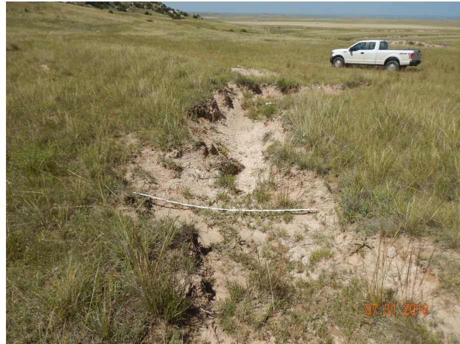
Photo 8: Photo taken from the access road, east of the location, facing southwest. See comments under photo 5. 6 foot measuring stick for reference.