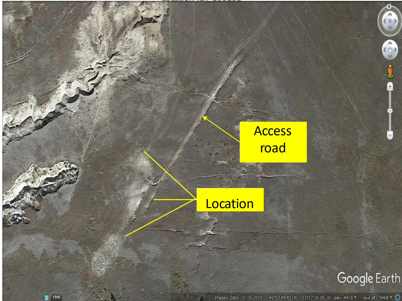
Photo 15: Current available aerial imager (2015). Photo shows access road and well location.