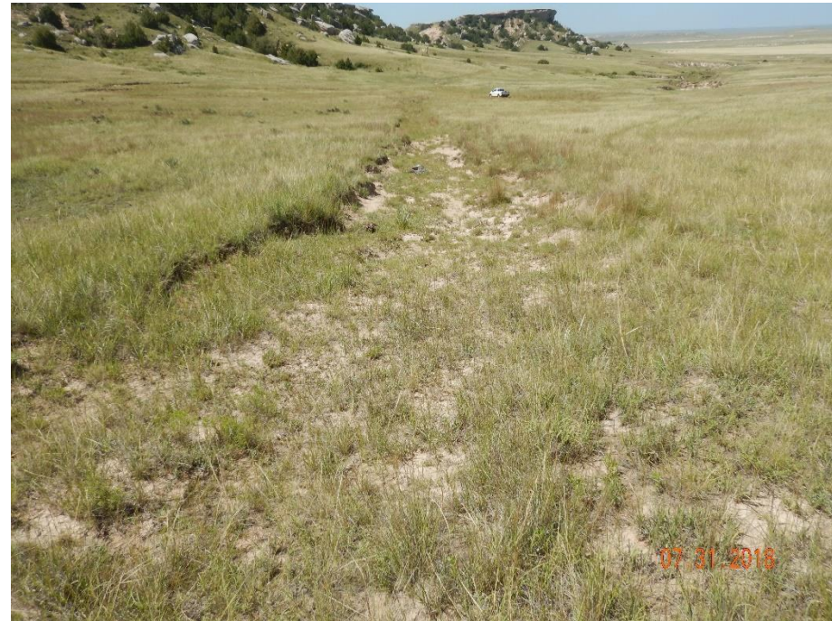
Photo 12: Photo taken from the access road, northeast of the location, facing southwest. See comments under photo 5.