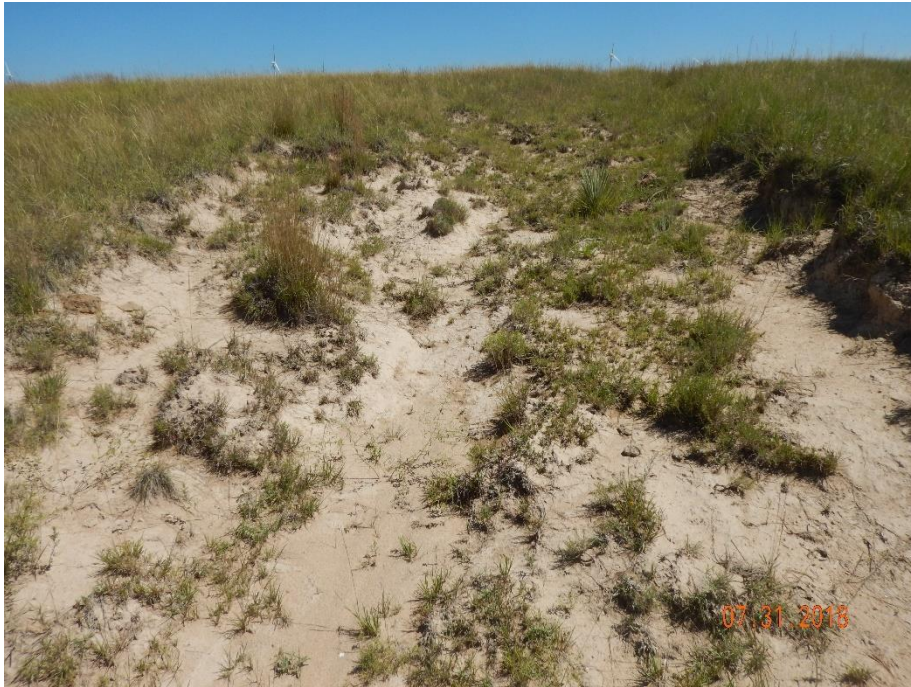
Photo 11: Photo taken from the access road, northeast of the location, facing northeast. See comments under photo 5