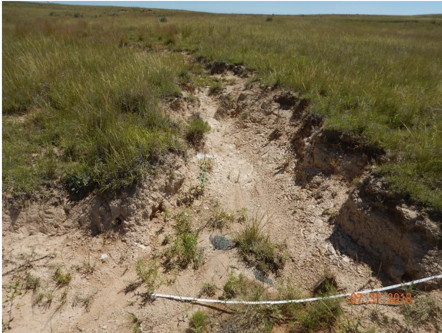
Photo 5: Photo taken from the access road, northeast of the location, facing northeast. Photo shows access road has not been recontoured/reggraded to the adjacent lands and stormwater has continued to degrade and channelize the access road creating a gulley. 6 foot measuring stick for reference.