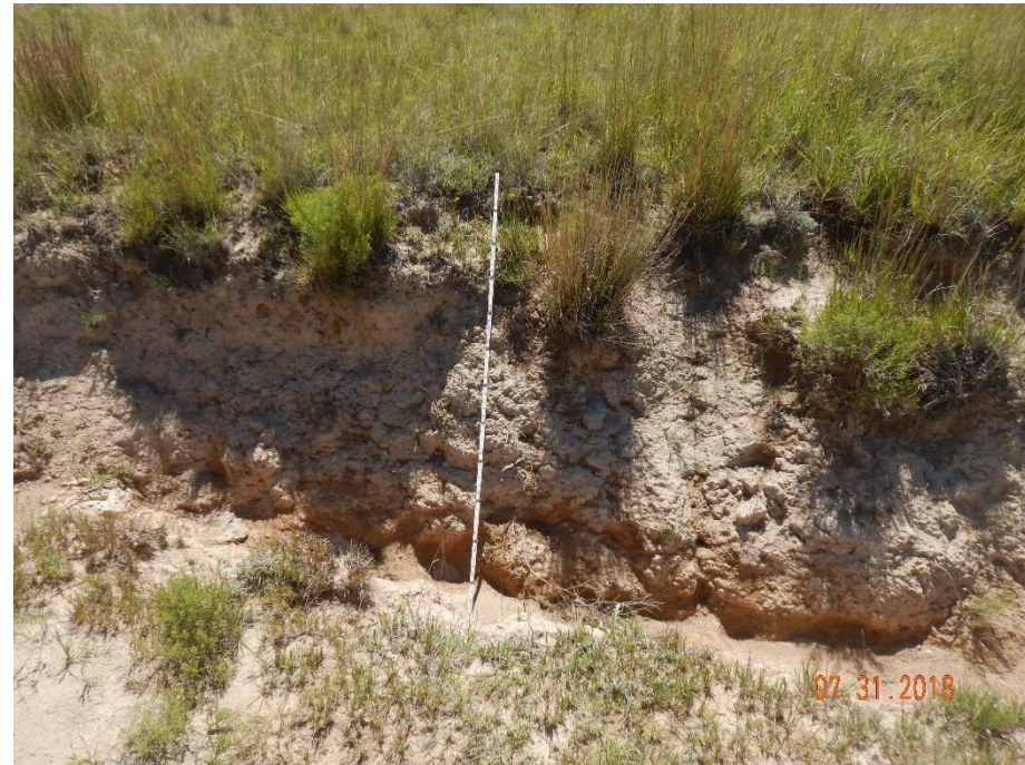
Photo 10: Photo taken from the access road. Photo shows 6 foot measuring stick. Photo shows stormwater erosion degradation has incised to a depth of almost 6 feet in areas of the access road