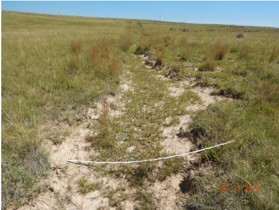
Photo 7: See comments under photo 5. 6 foot measuring stick for reference.