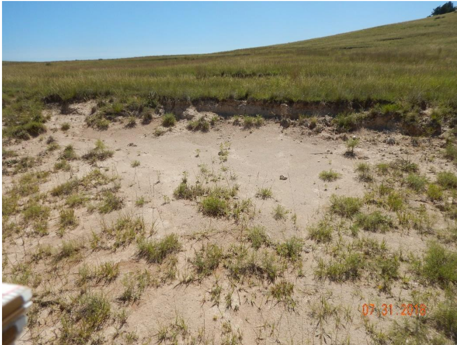
Photo 1: Photo taken from the east end of the location, facing north. Previous inspections documented that areas on the east end of the location and access road have not achieved a uniform desirable perennial vegetative cover, and stormwater has caused erosion degradation. Inspections required operator to perform reclamation and stormwater management. Photo shows no management activities per the corrective action appear to have been conducted; location/access road has not been adequately contoured/graded and re-vegetated, stormwater has continued to cause erosion degradation.