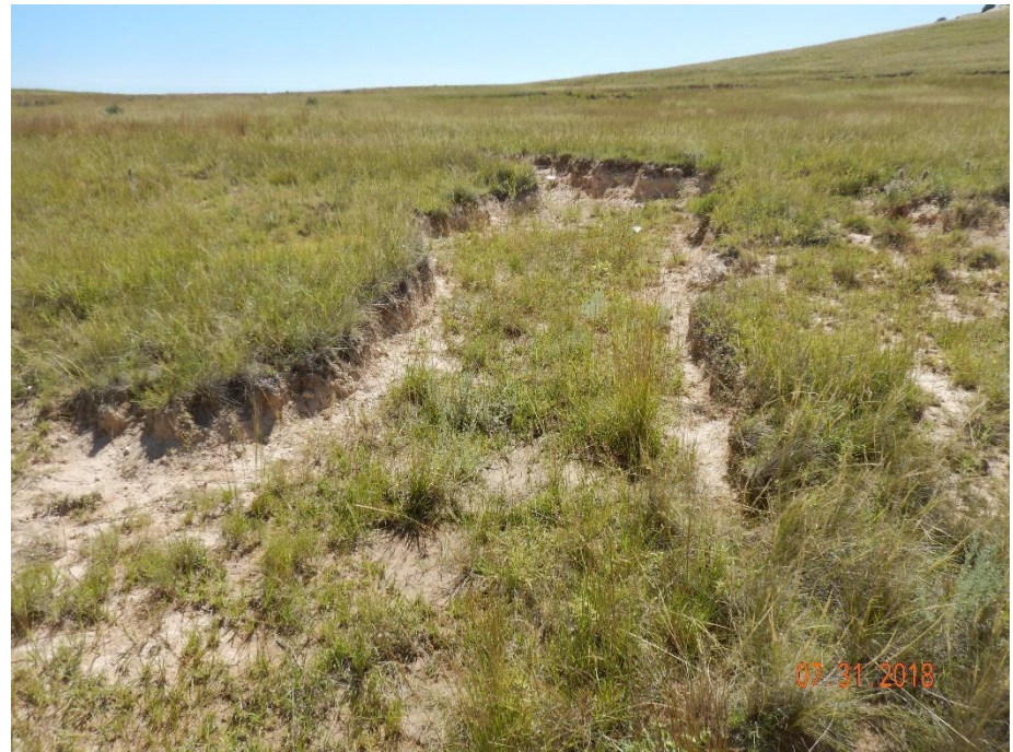
Photo 4: Photo taken from the east end of the location, facing east. Photo shows gully erosion where the access road meets location. See comments under photo 1.