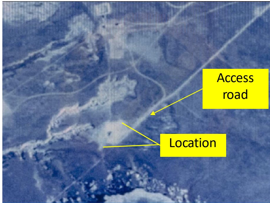
Photo 13: 1985 Aerial imagery Well was PA in 1987. Photo shows the active location and access road