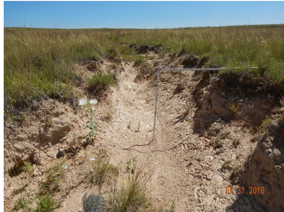
Photo 6: See comments under photo 5. Photo shows gulley is ~2.5 feet deep.