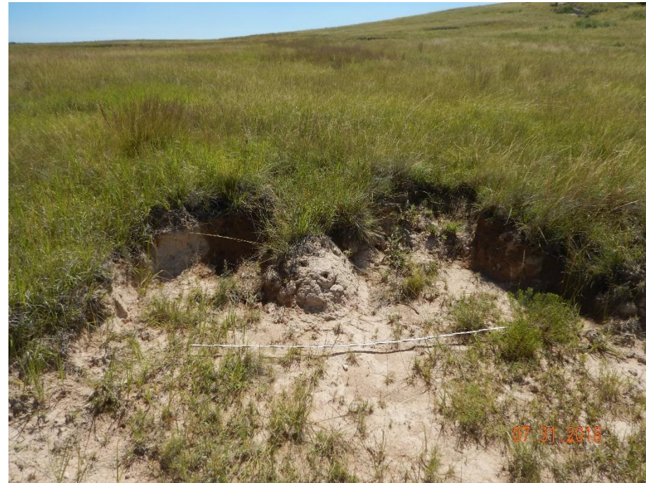
Photo 2: See comments under photo 1. 6 foot measuring stick for reference.