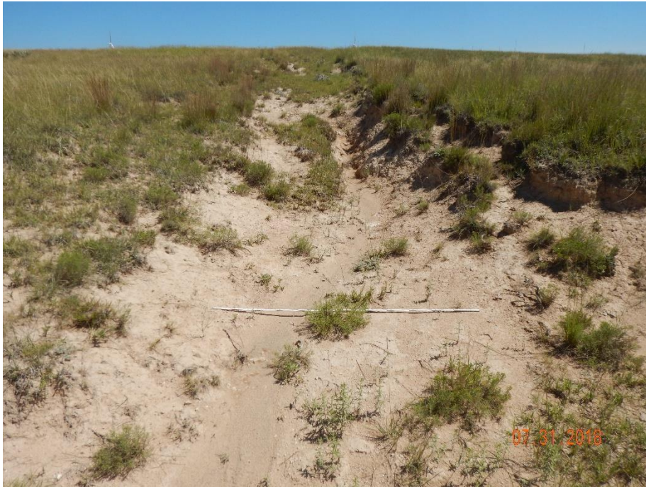
Photo 9: Photo taken from the access road, northeast of the location, facing northeast. See comments under photo 5. 6 foot measuring stick for reference.