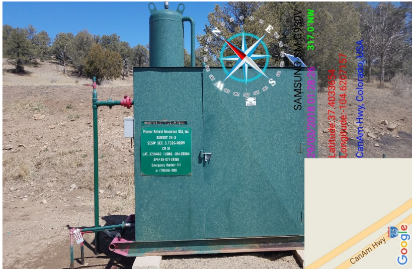
Location Sign on Meter House

Location Name: Pioneer Sunset 24-3 Location 308516