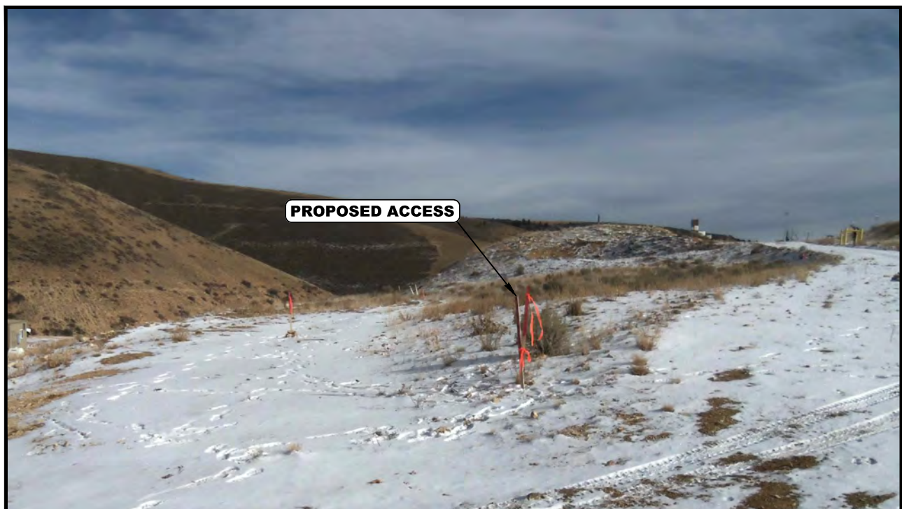
PHOTO: VIEW FROM BEGINNING OF NEW CONSTRUCTION