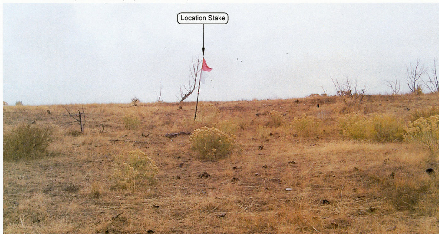
PHOTO LOCATION: LATITUDE LONGITUDE NAD 83: (40° 00' 56.78"N) (108° 24' 36.54"W)