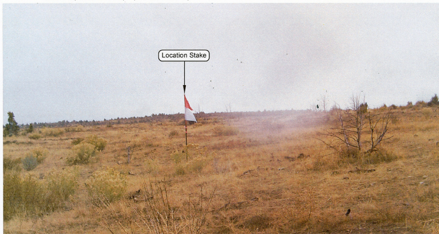
PHOTO LOCATION: LATITUDE LONGITUDE NAD 83: (40° 00' 57.37"N) (108° 24' 37.37"W)